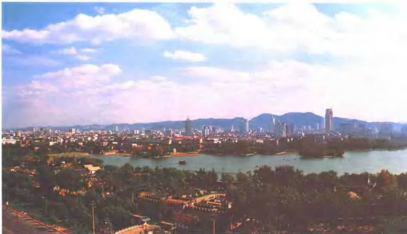
湖光山色 城市 Mount, Lake, City Meng Fanting