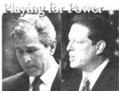
2000 May 1 pp.