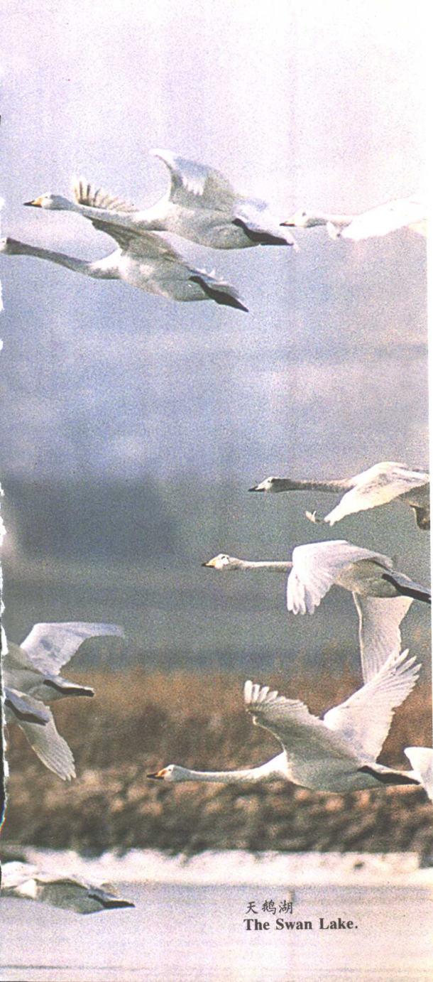
天鹅湖 The Swan Lake.