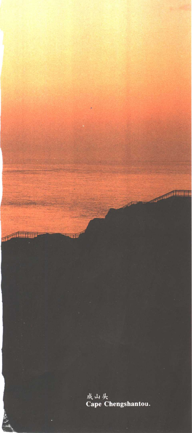
成山头 Cape Chengshantou.