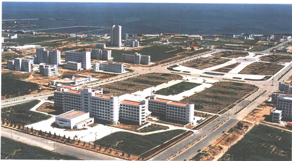
蜊江海滨 Lijiang Seaside.

荣成市地处山东半岛最东端，北东南三面濒临黄海，海岸线长达 500 公里，与韩国、日本隔海相望，距韩国最近处仅 94 海里。荣成市陆地总面积 1392 平方公里，辖 26 个镇，4 个省级开发区(度假区)，人口 68.5 万。