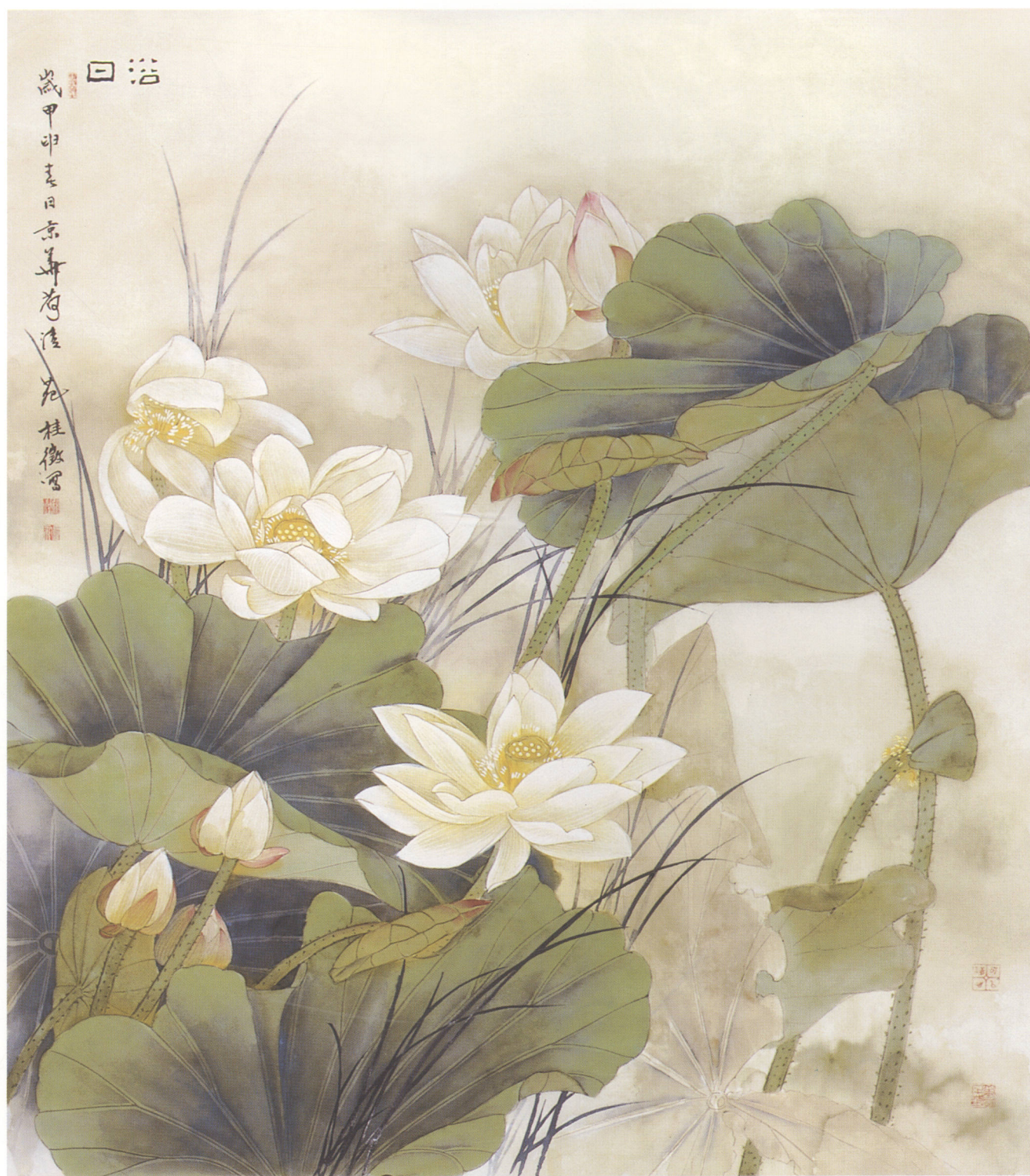
冷香 (局部) Cool Fragrance (details)