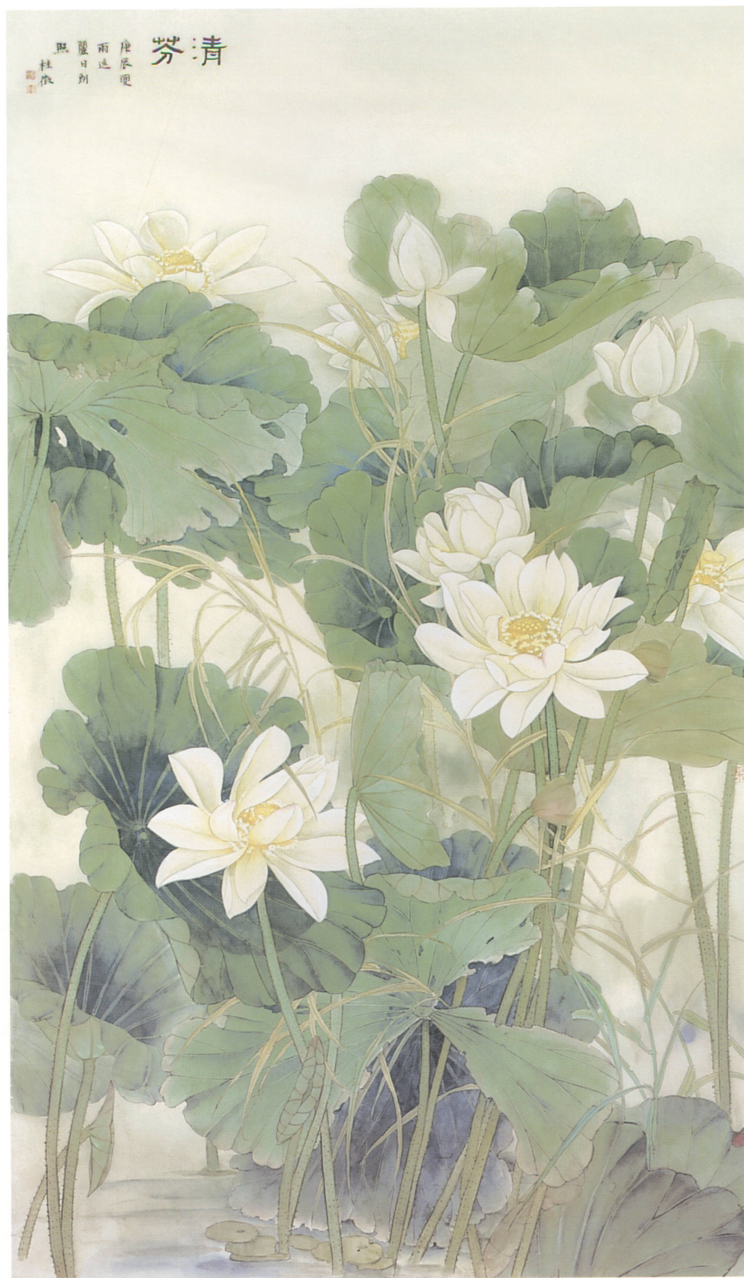
清芬 2002年 (1196cm × 1150cm) Delicate Fragrance (details)