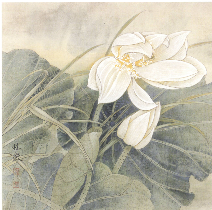
风 2004年 (43cm × 43cm) Lotus in the Wind