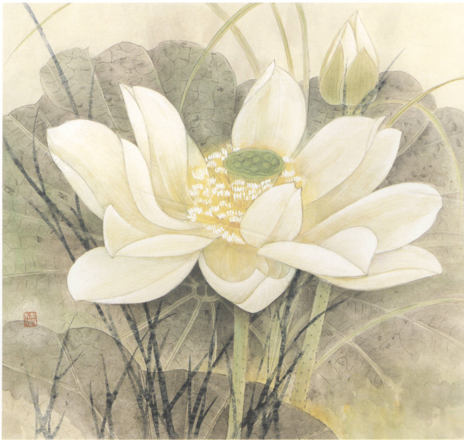
露 2004年 (43cm × 41cm) Lotus with the Dews