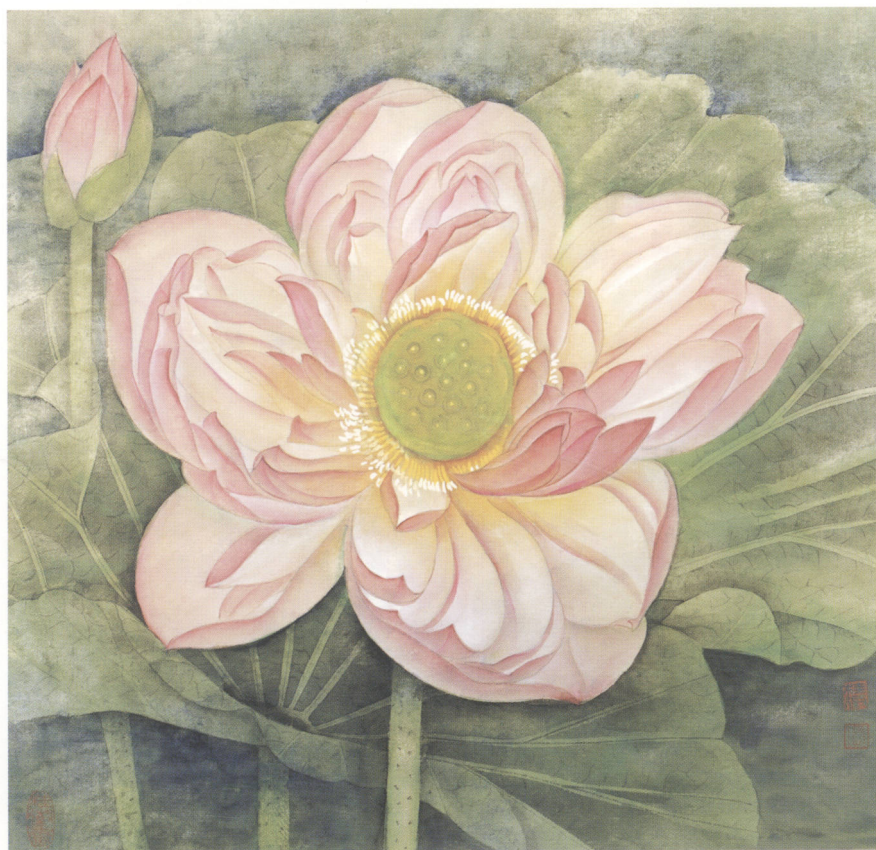
晓 2004年 (43cm × 40cm) Lotus in the Dawn