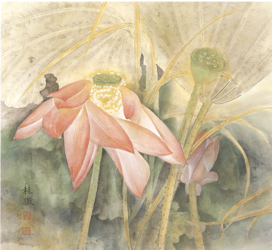
雨 2004年 (44cm × 43cm) Lotus in the Rain