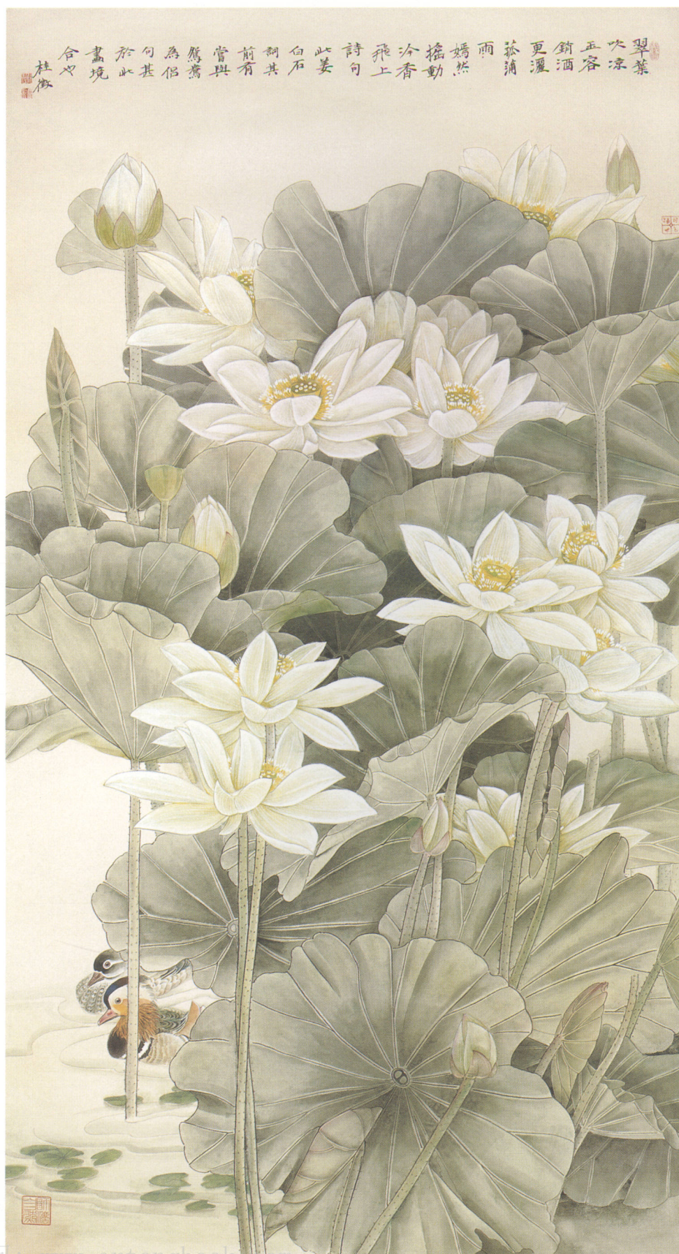
冷香 2004年 (90cm × 169cm) Cool Fragrance