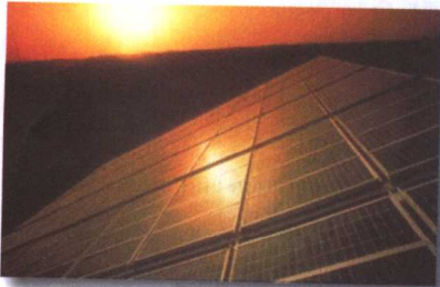
Solar Energy Is Clean ...