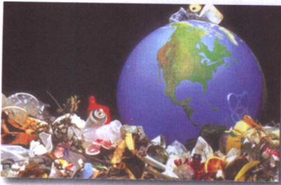
Mixed Garbage Overflowing...