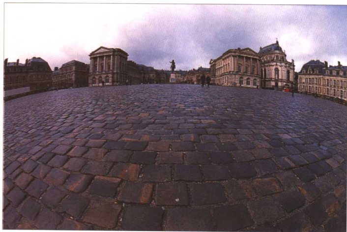
巴黎 凡尔赛宫 Paris Versailles Palace