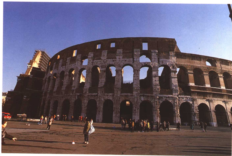
罗马 科洛赛奥斗兽场 Rome Koroseo Beast-fighting Arena