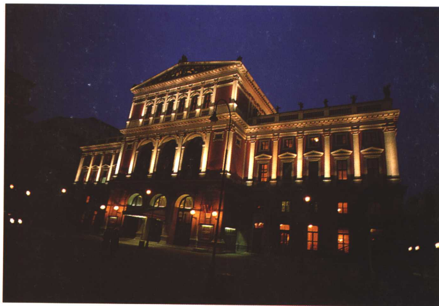
维也纳 金色大厅 Vienna Golden Color Hall