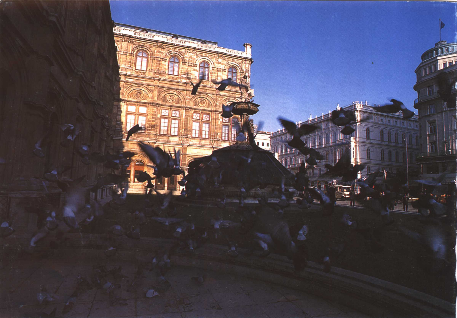
维也纳 国家歌剧院 Vienna National Opera House