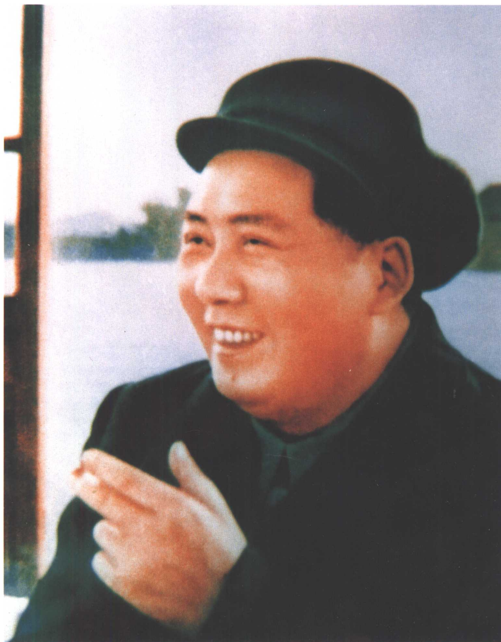
1952年毛泽东主席在大明湖公园。 Chairman Mao Zedong at Lake Da Ming Hu (1952).

Attention from state, provincial and municipal leaders over the years has spurred the cadres and workers in the line and boosted reconstruction and development in the city's landscape architecture.