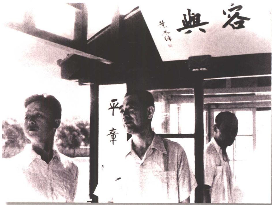
1957年周恩来总理在大明湖公园。 Premier Zhou Enlai at Lake Da Ming Hu (1957).