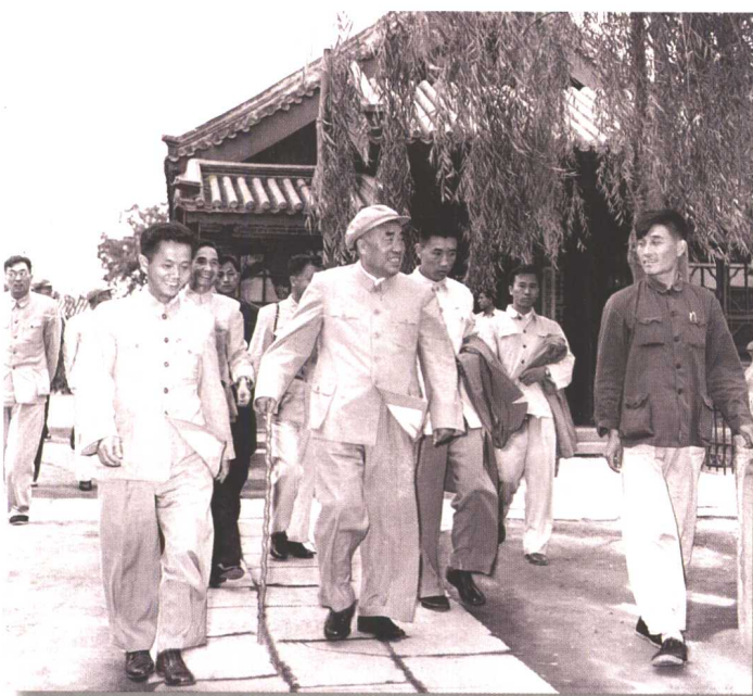
1960年朱德委员长在趵突泉公园。 NPC chairman Zhu De at Bao Tu Spring (1960).