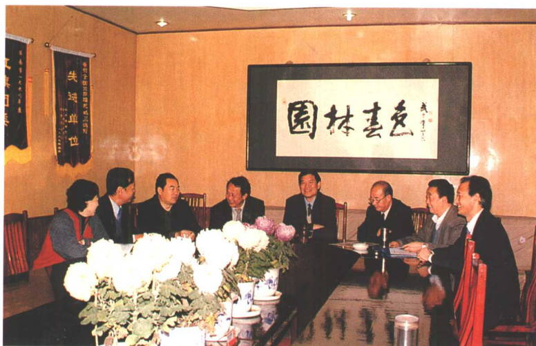
济南市园林管理局领导班子在研究工作 Leaders at work.

But before Liberation in 1949 the old urban area had no street flanked with trees. Having only two parks in the city area, per capita public green space amounted to no more than 0.3 square meters.