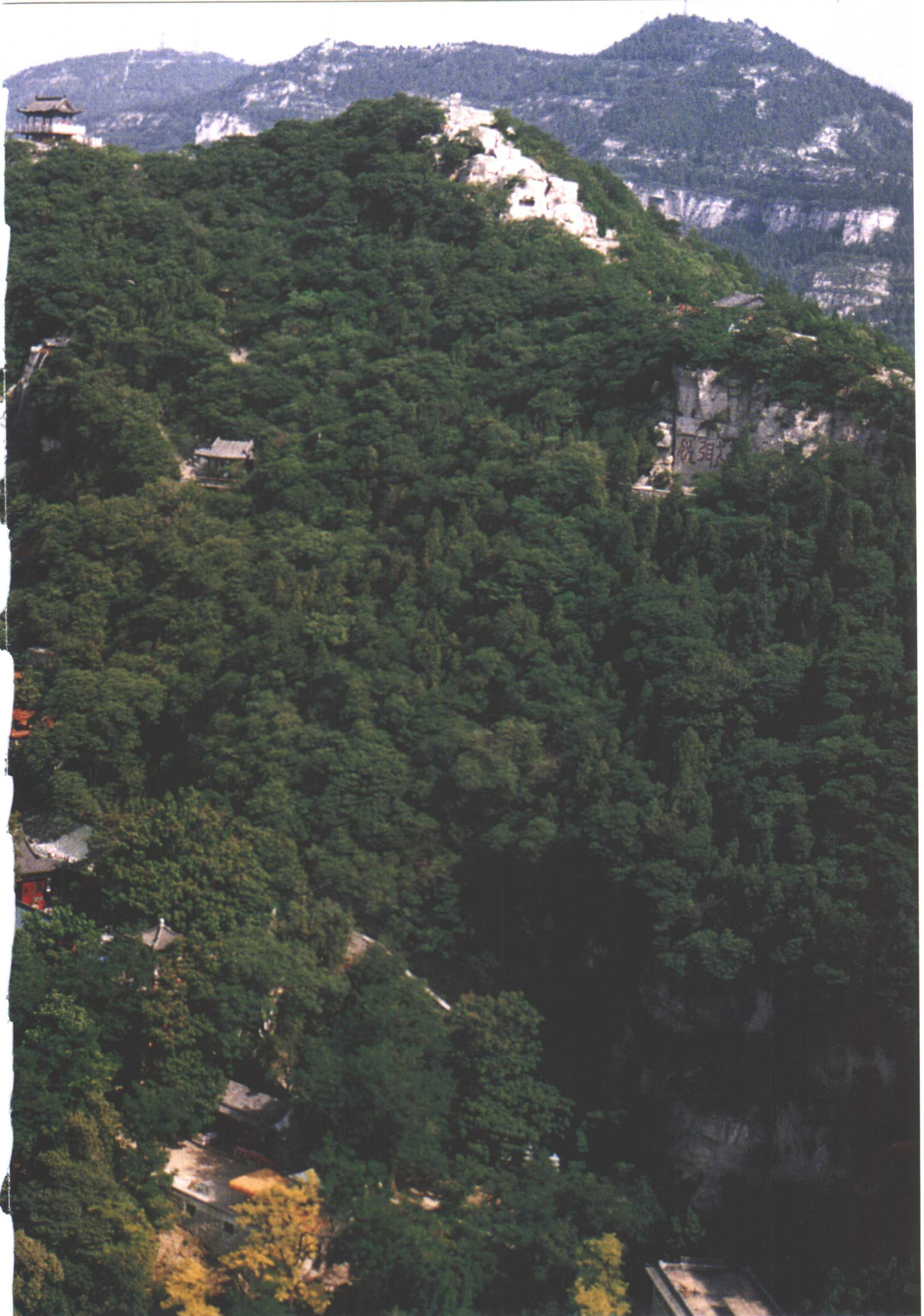
千佛山 Qian Fo Mountain