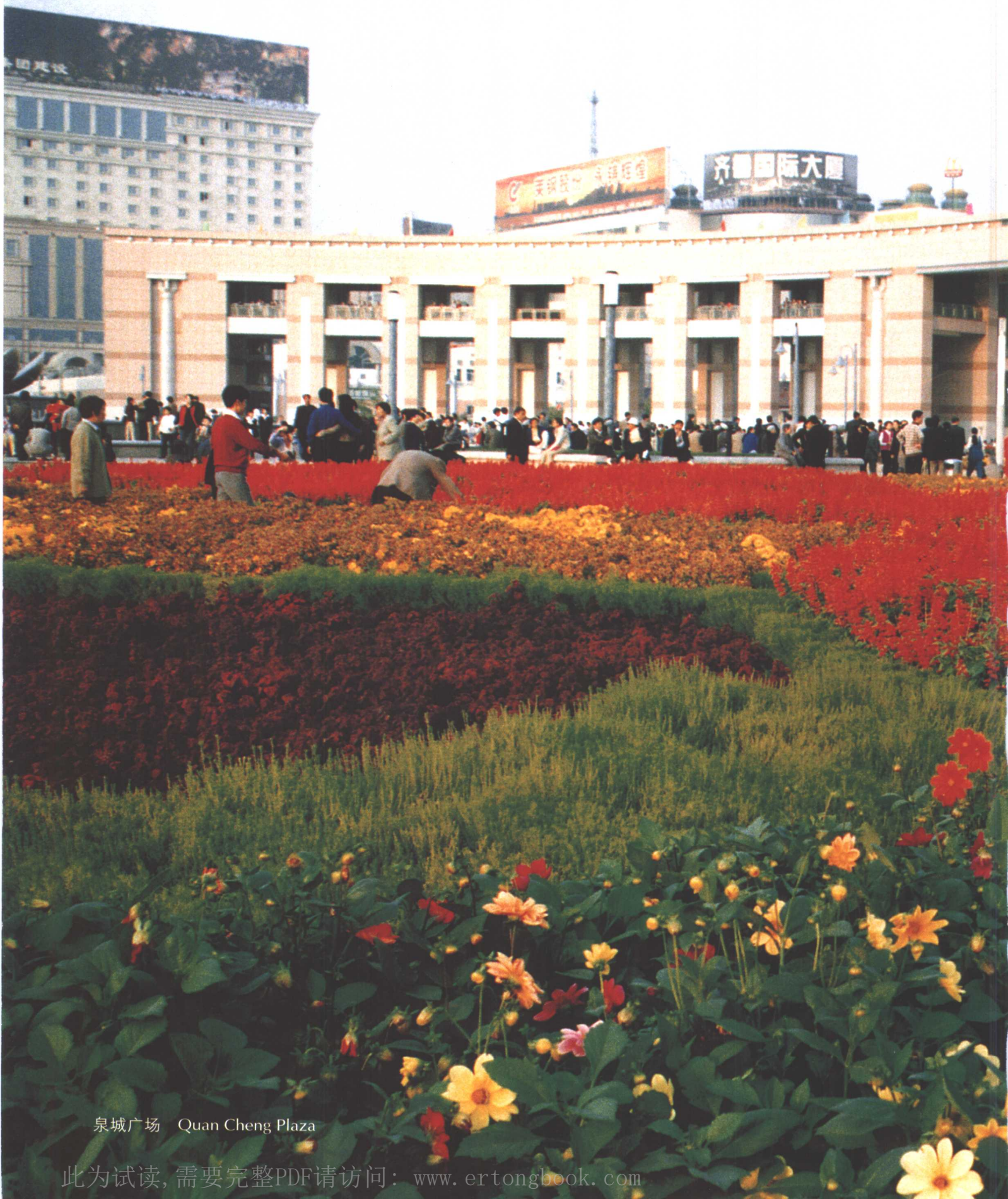
泉城广场 Quan Cheng Plaza