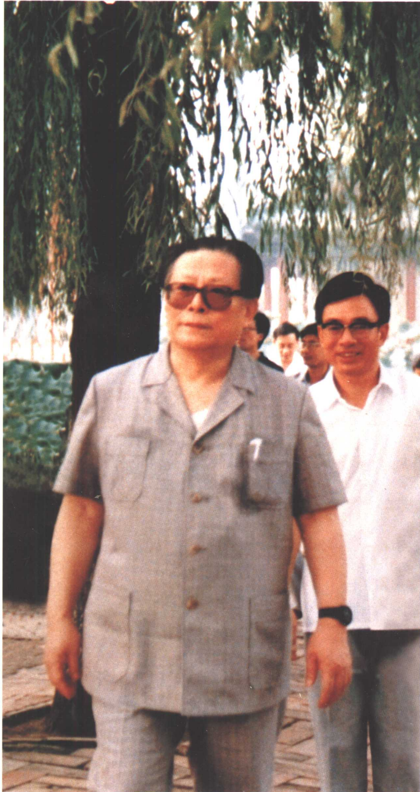
1989年江泽民总书记 在大明湖公园。 General Secretary Jiang Zemin at Lake Da Ming Hu (1989).