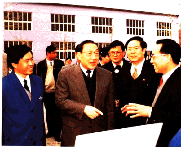
李岚清在诸城外贸公司考察 Li Lanqing inspects the Zhucheng Foreign Trade Corporation.