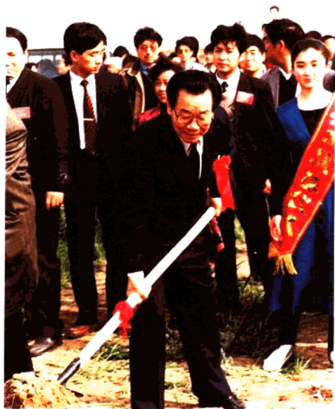
李瑞环为潍坊高新技术产业开发区开工奠基 Li Ruihuan laying the foundation stone for the construction of the Weifang High Tech Industrial Development Zone.