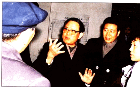
宋健在潍坊企业考察 Song Jian inspects an enterprise in Weifang.