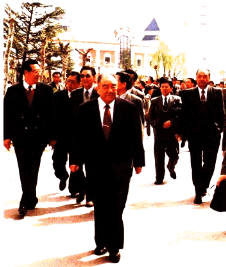
布赫在潍坊考察 Bu He makes an investigation in Weifang.