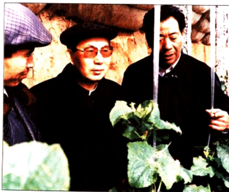
陈俊生在寿光考察蔬菜种植 Chen Junsheng inspects vegetable cultivation in Shouguang.