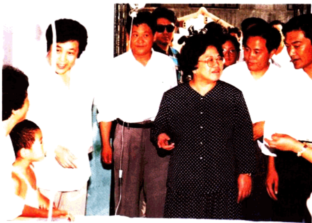
彭佩云在安丘考察妇幼保健工作 Peng Peiyun inspects the work of maternity and child care in Anqiu.