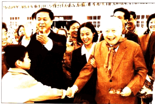
钱伟长在潍城区考察教育工作 Qian Weichang inspects the educational work in the city proper of Weifang.