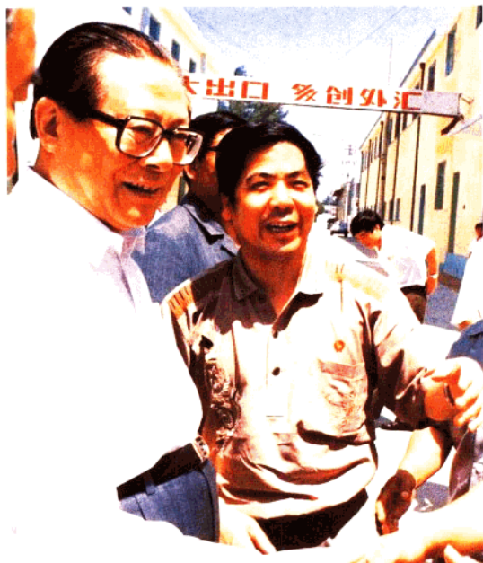
江泽民在诸城考察外贸工作 Jiang Zemin inspects the work of foreign trade in Zhucheng.