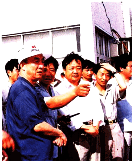
邹家华在寿光蔬菜批发市场考察 Zou Jiahua inspects the Shouguang Vegetables Wholesale Market.