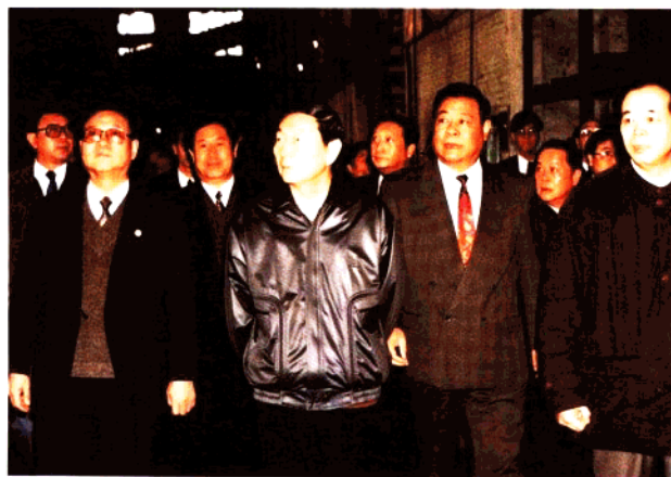
朱镕基在潍坊同心集团公司考察 Zhu Rongji inspects the Weifang Tongxin Group Corporation.