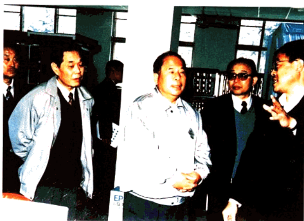
尉健行在华光集团公司考察 Wei Jianxing inspects the Huaguang Group Corporation.