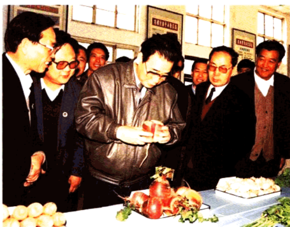
李鹏在潍坊考察农副产品加工生产 Li Peng inspects the processing and production of agricultural and sideline products in Weifang.