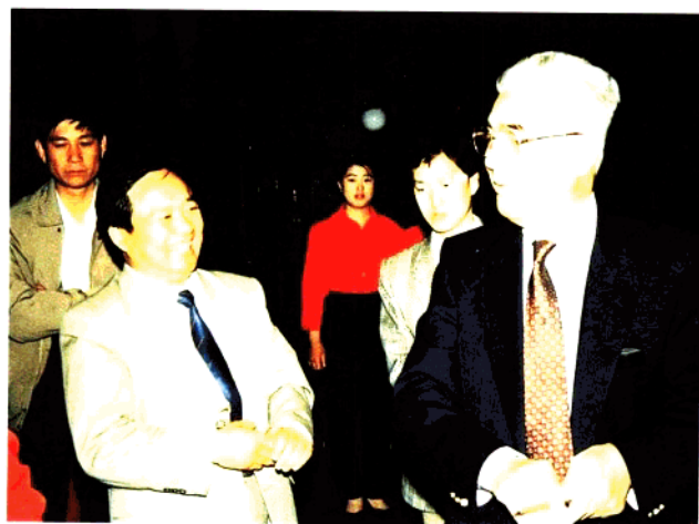
荣毅仁在寿光考察 Rong Yiren making an inspection tour in Shouguang.