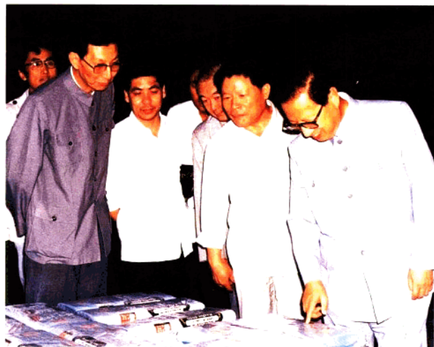
乔石在潍坊第二印染厂考察 Qiao Shi inspects the No.2 Weifang Printing and Dyeing Mill.