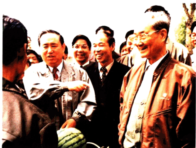
宋平与昌乐瓜农在一起 Song Ping, with watermelon growers in Changle.