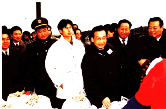
温家宝与寿光菜农交谈 Wen Jiabao talking with a vegetable grower in Shouguang.