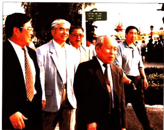
杨汝岱在潍坊考察 Yang Rudai makes an investigation in Weifang.