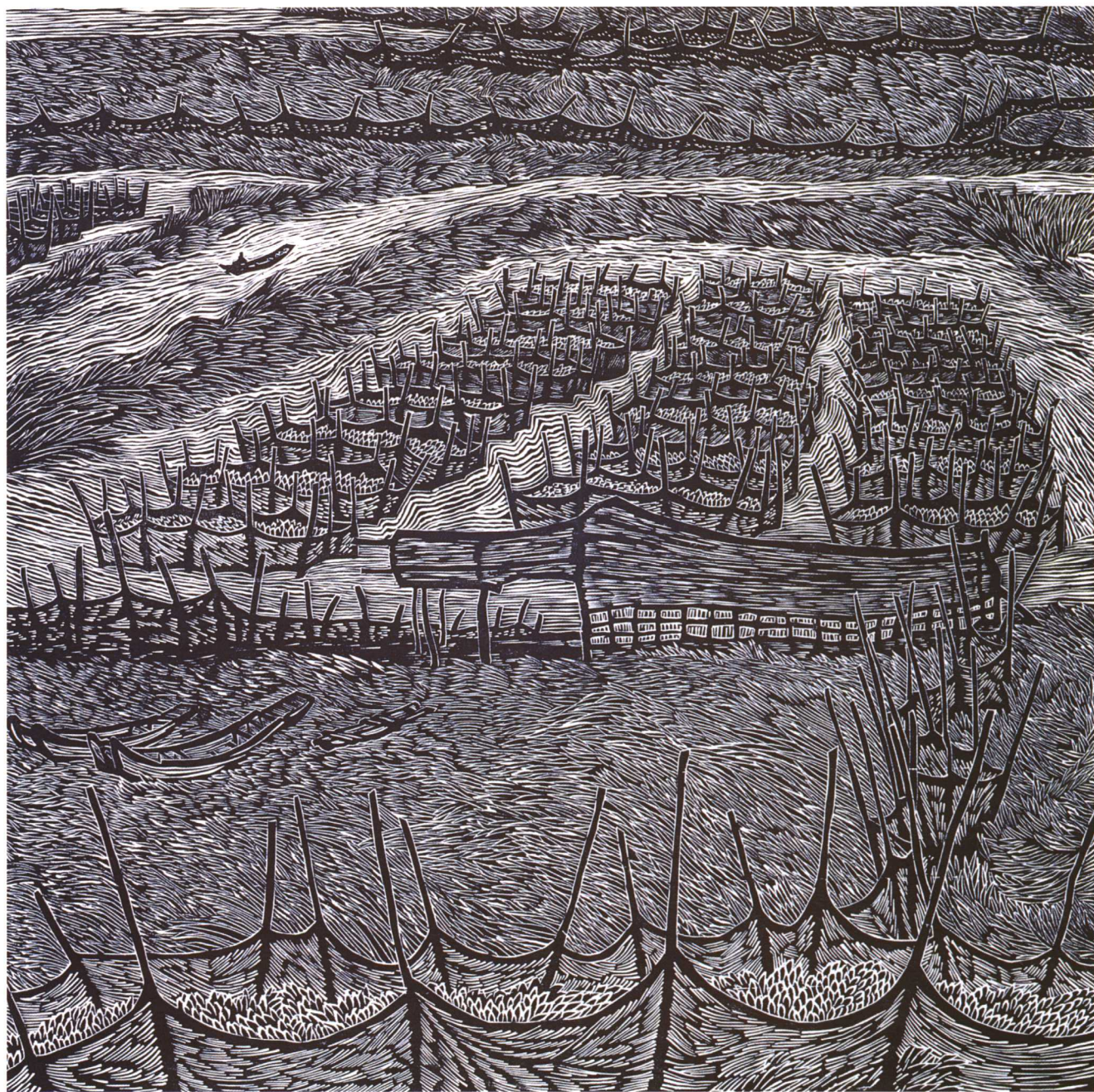
冯汉江 / 湖乡行 / 版画