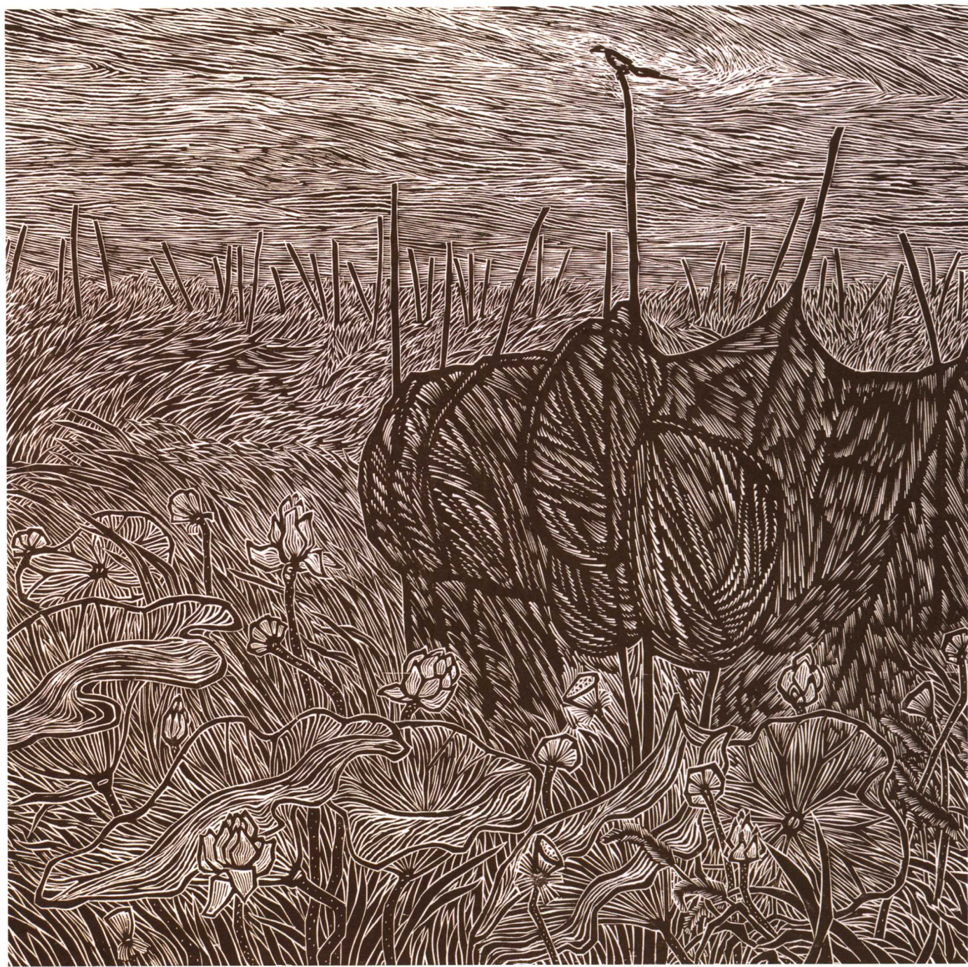
冯汉江 / 远瞻 / 版画