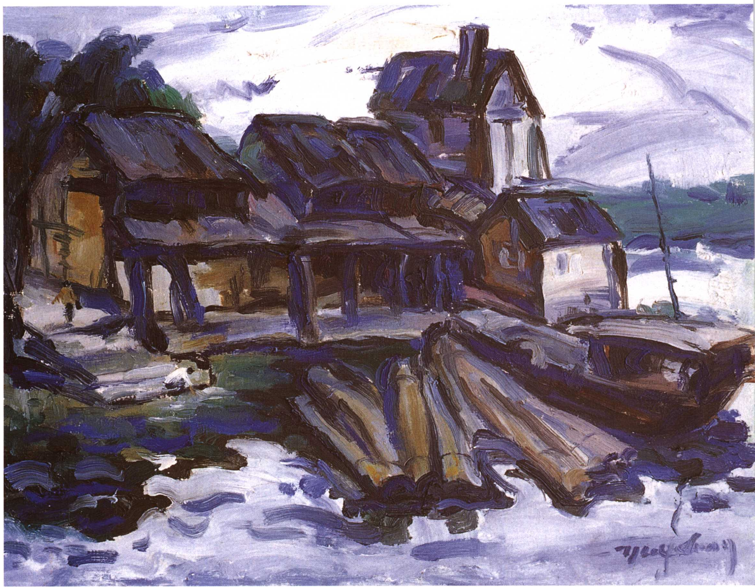
徐跃东 / 水乡风景 / 油画