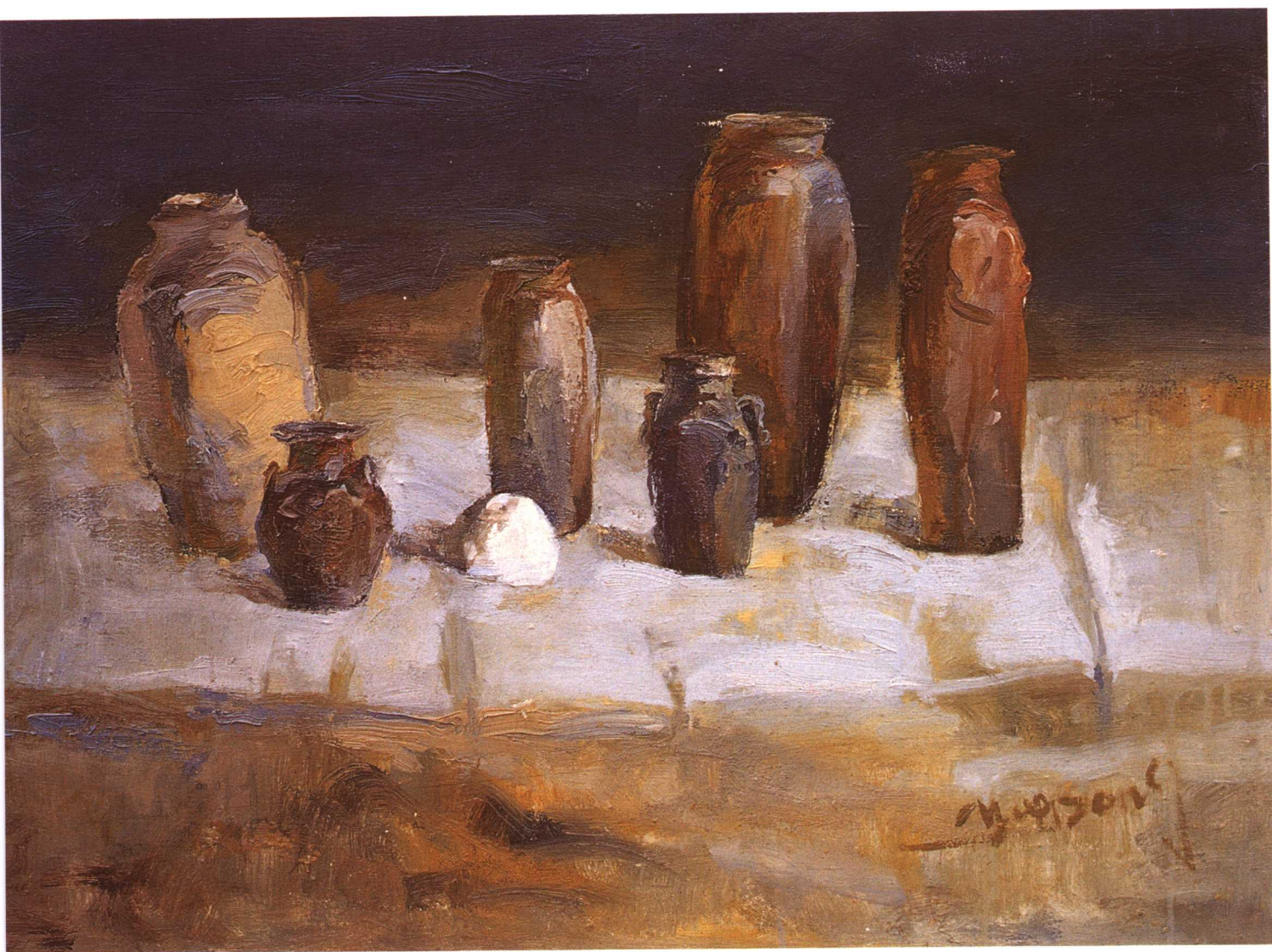
徐跃东 / 古战场上的陶罐 / 油画