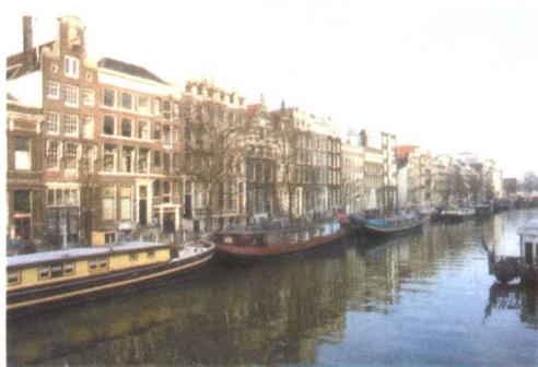
Amsterdam is the capital of Holland.