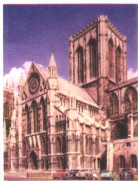
York is a town in England.

Native / 'neɪtv / 美洲本地的 Dutch / dʌtʃ / 荷兰的, 荷兰人 settle / 'setl / 移居, 定居 Amsterdam / 'æmstədæm / 阿姆斯特丹 take over 接收, 接管