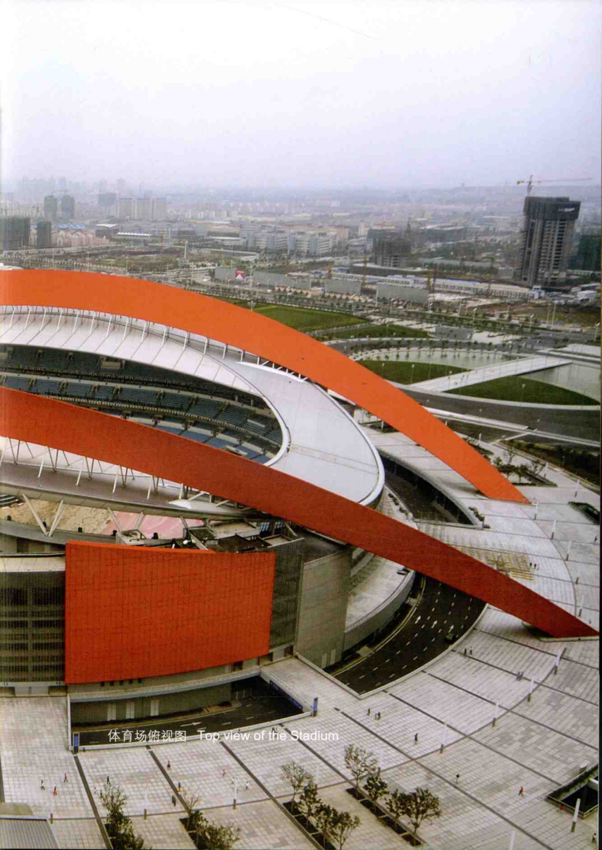
体育场俯视图 Top view of the Stadium