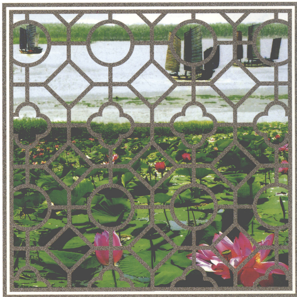
Green Land of Water