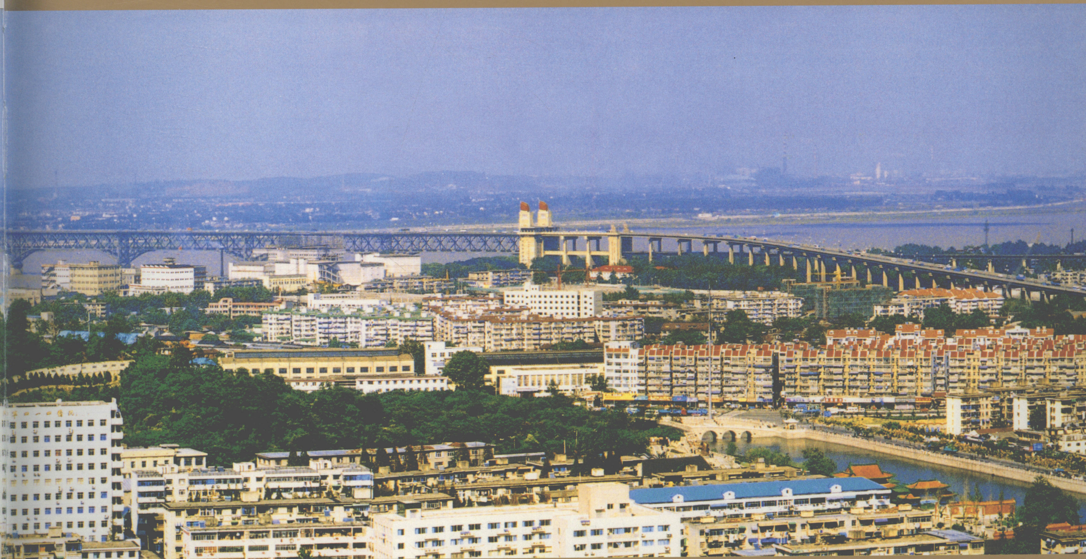
▲ Yuejiang Tower • Nanjing Yangtze River Bridge

Jiangsu has a vast fertile land which is densely covered by rivers. There are more than 2900 rivers, over 290 lakes and nearly 1170 reservoirs of all sizes in Jiangsu. The total water area is 17,360 square kilometers, which ranks first in the country, therefore, enjoys the reputation of “the Chinese land of water”.