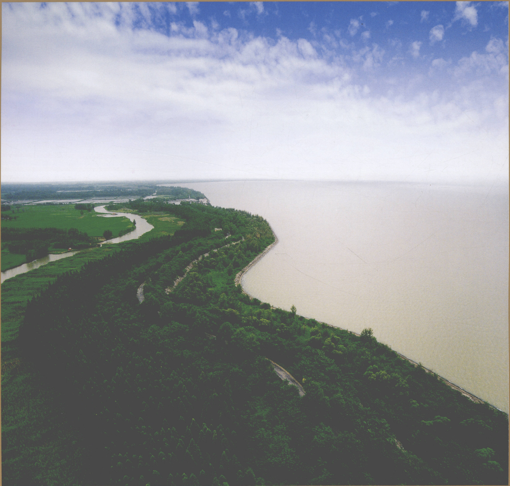
▲ Poplar Forest along the North Jiangsu Main Irrigation Canal