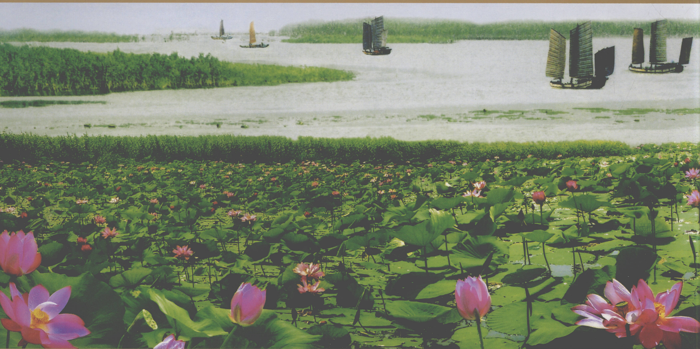
▲ Summer lotus flower in the Taihu Lake

The coastal line of about 1000 kilometers provides Jiangsu with abundant sea resources and fishery resources. Haizhou Bay, Lvsi, Taisha and Changjiangkou Estuary are regarded as the four great sea fisheries of Jiangsu.