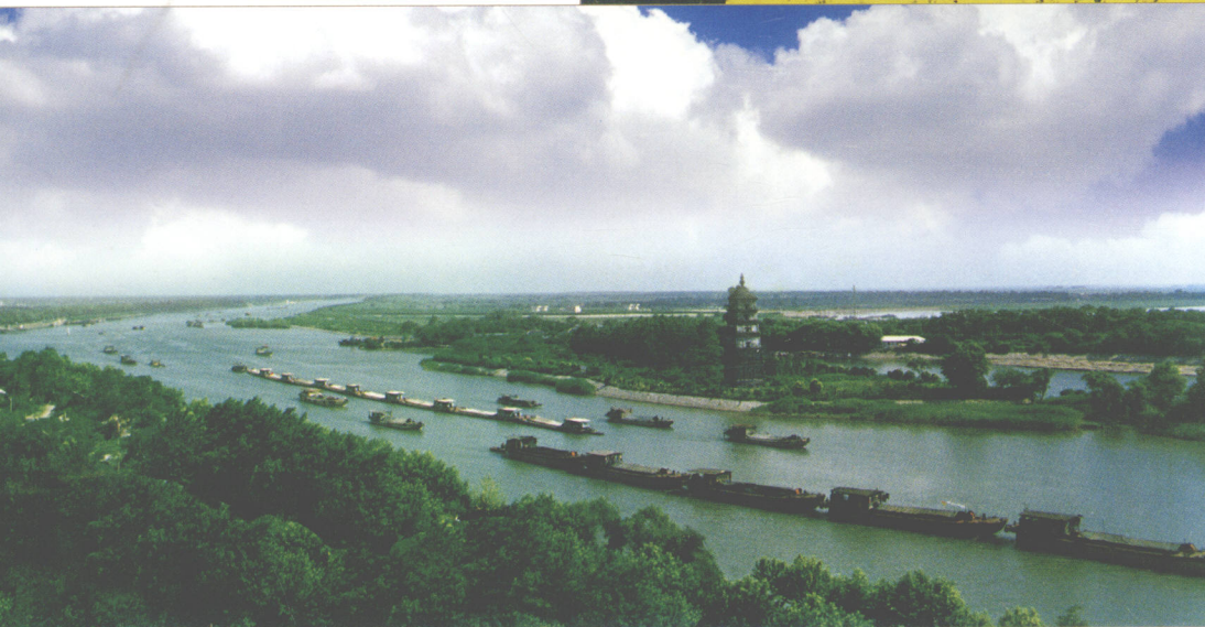
◀ Ancient charm of the Canal