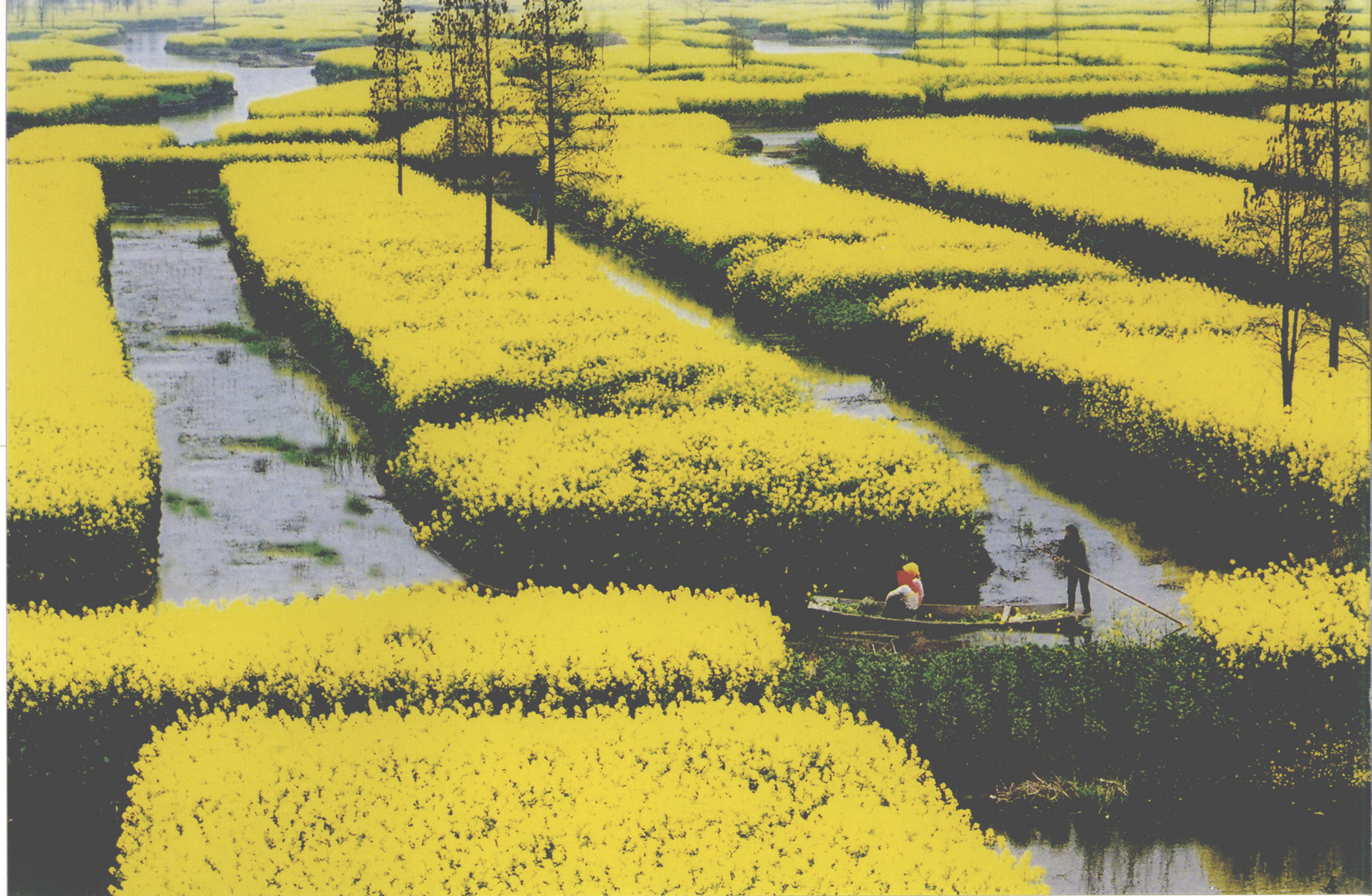
Taizhou • The paddy field in Xinghua ▶