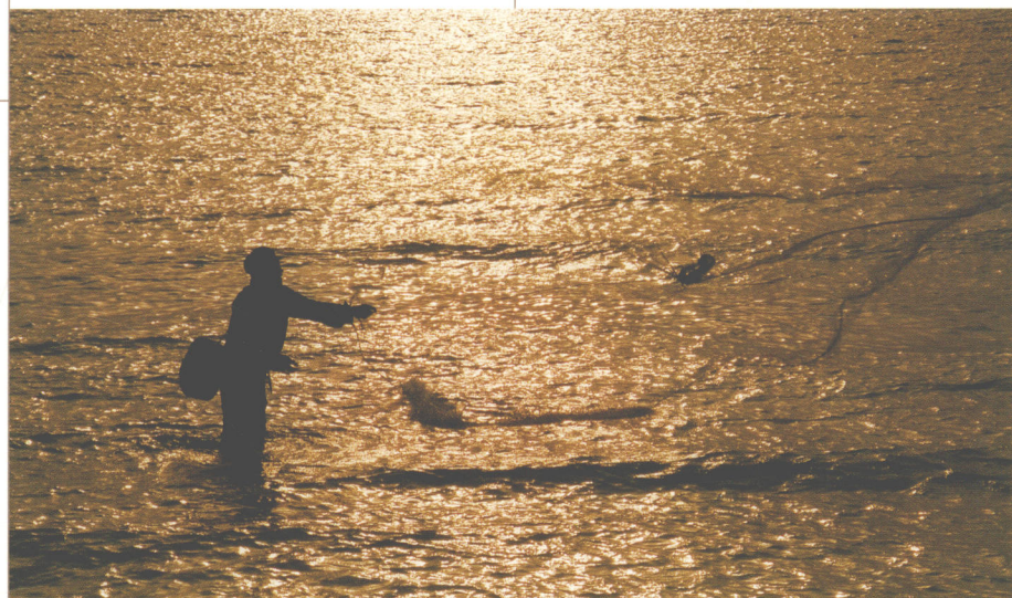
▲ The Hongze Lake