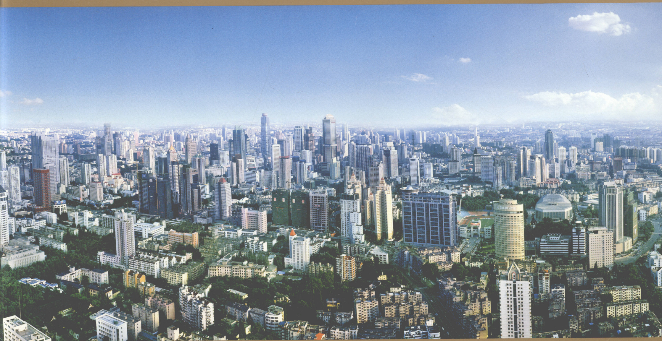
▲ Nanjing • New look of the ancient metropolis

Jiangsu has a long history. About 500,000 years ago, just the same period when Peking Man lived, there lived Nanjing Man here. Further, Jiangsu has a recorded history of civilization of over 6000 years. As early as in the Six Dynasties Period(C3rd–C6th), Jiangsu was the economic and cultural center in the southeast area of China. After the Sui and Tang Dynasties, especially with the ditching of the Jinghang Grand Canal, Jiangsu had become one of the economic and cultural centers of the whole country. In modern times, Jiangsu has increasingly become one of the provinces with the most developed economy and culture.