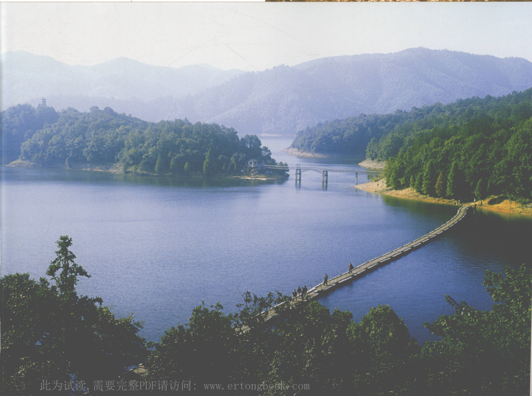
◀ Changzhou • The Tianmu Lake