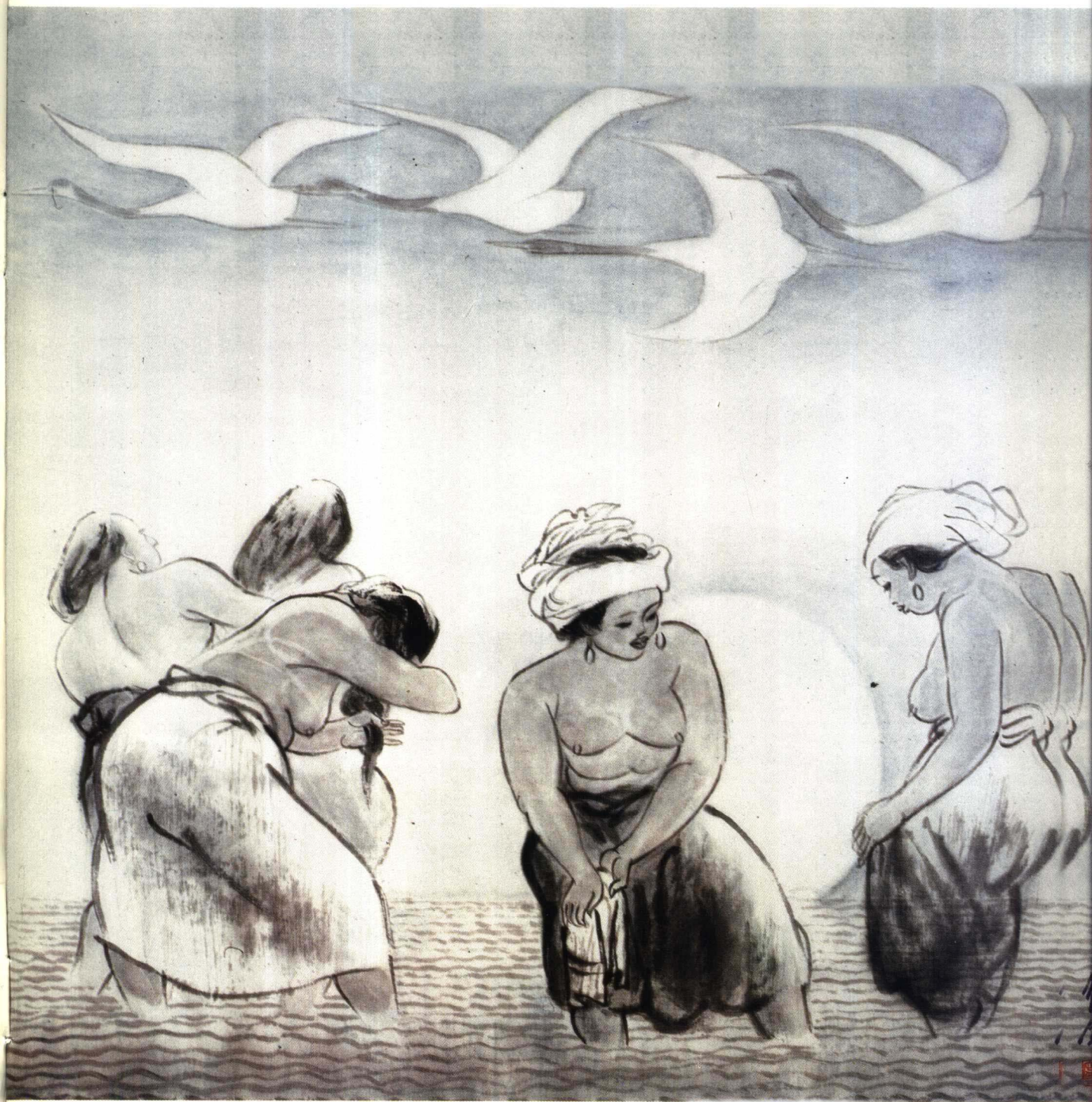
晚風 (70×70cm) 1985年 Evening Breeze.