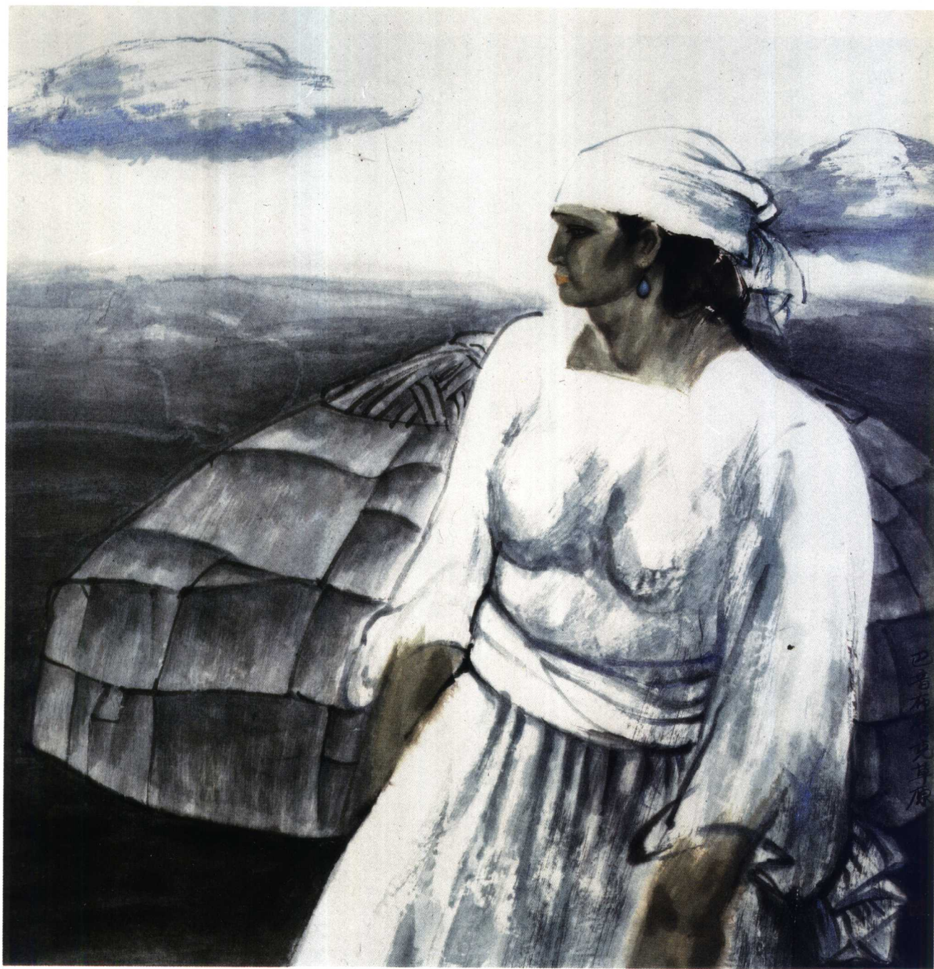
巴音布魯克草原 (70×70cm) 1989年 On the Bayanbruk Grasslands.