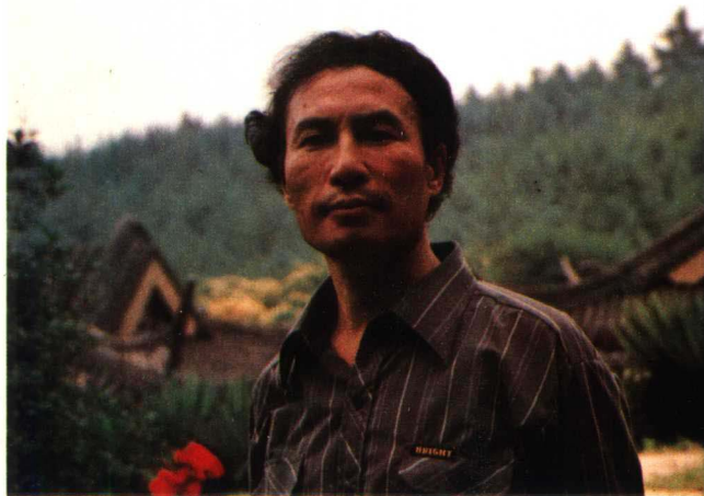
畫家像 Xu Ning