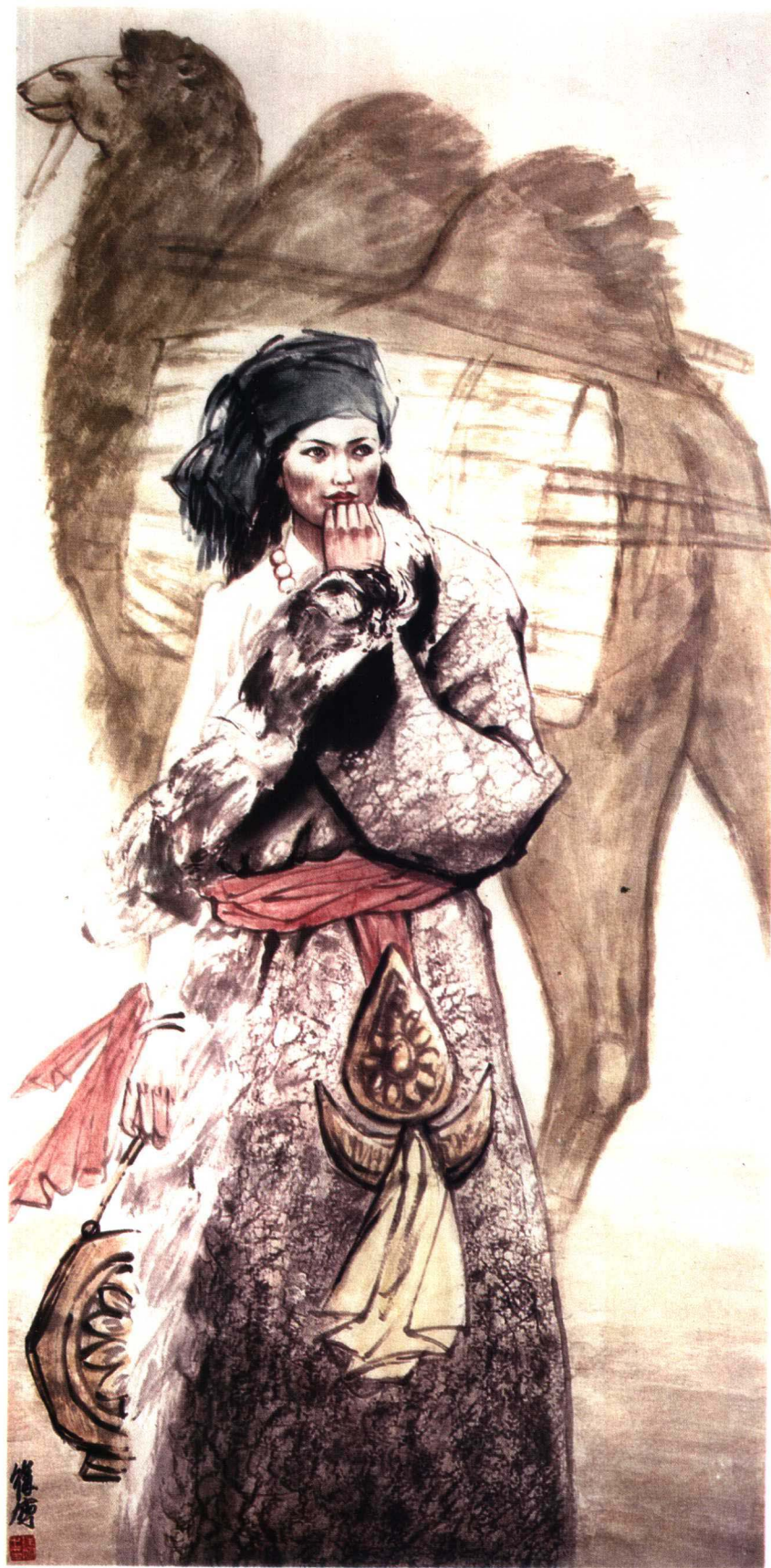
大漠行旅 (140×70cm) 1979年 A Caravan on the Desert.