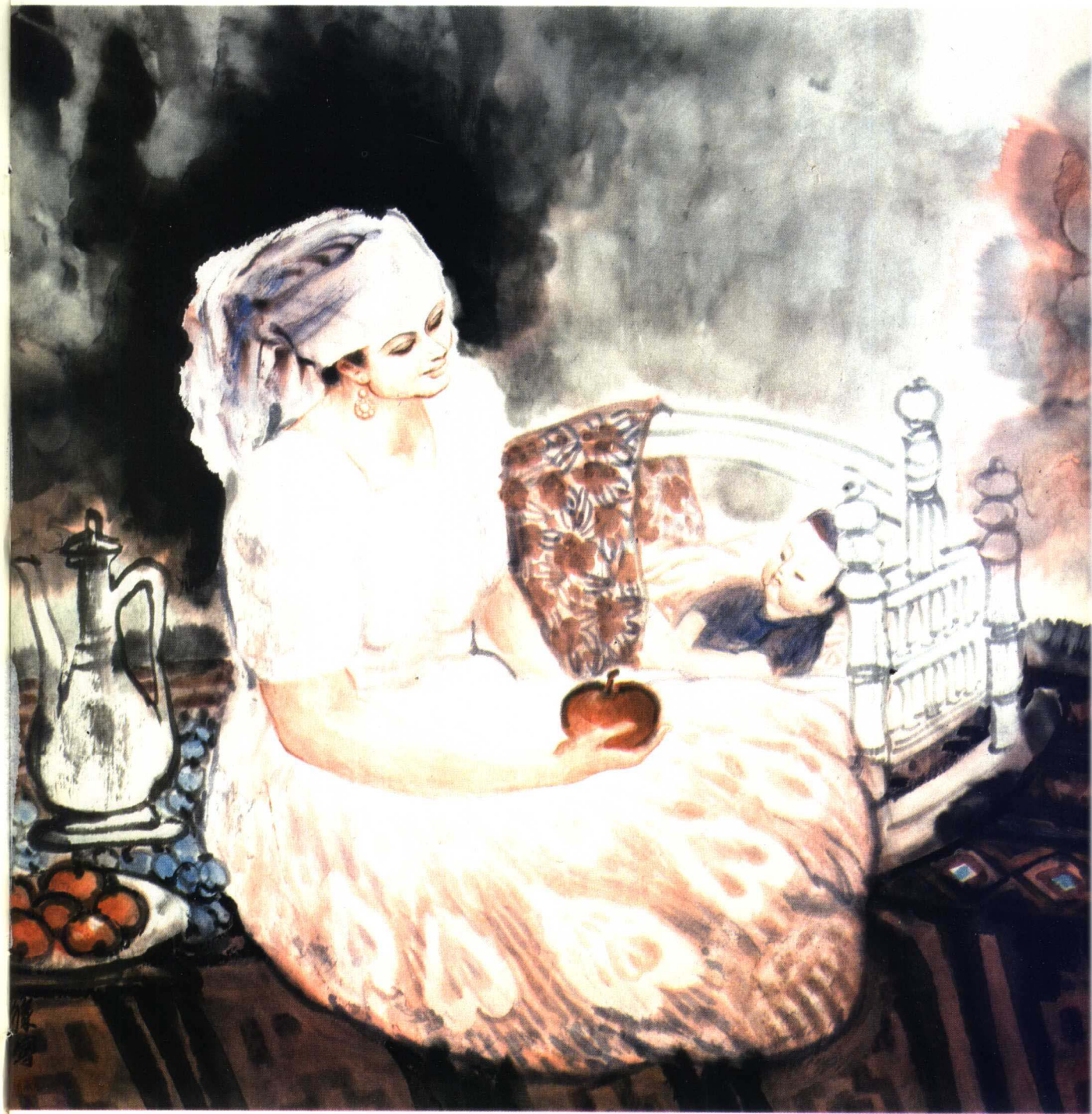
蘋果 (70×70cm) 1989年