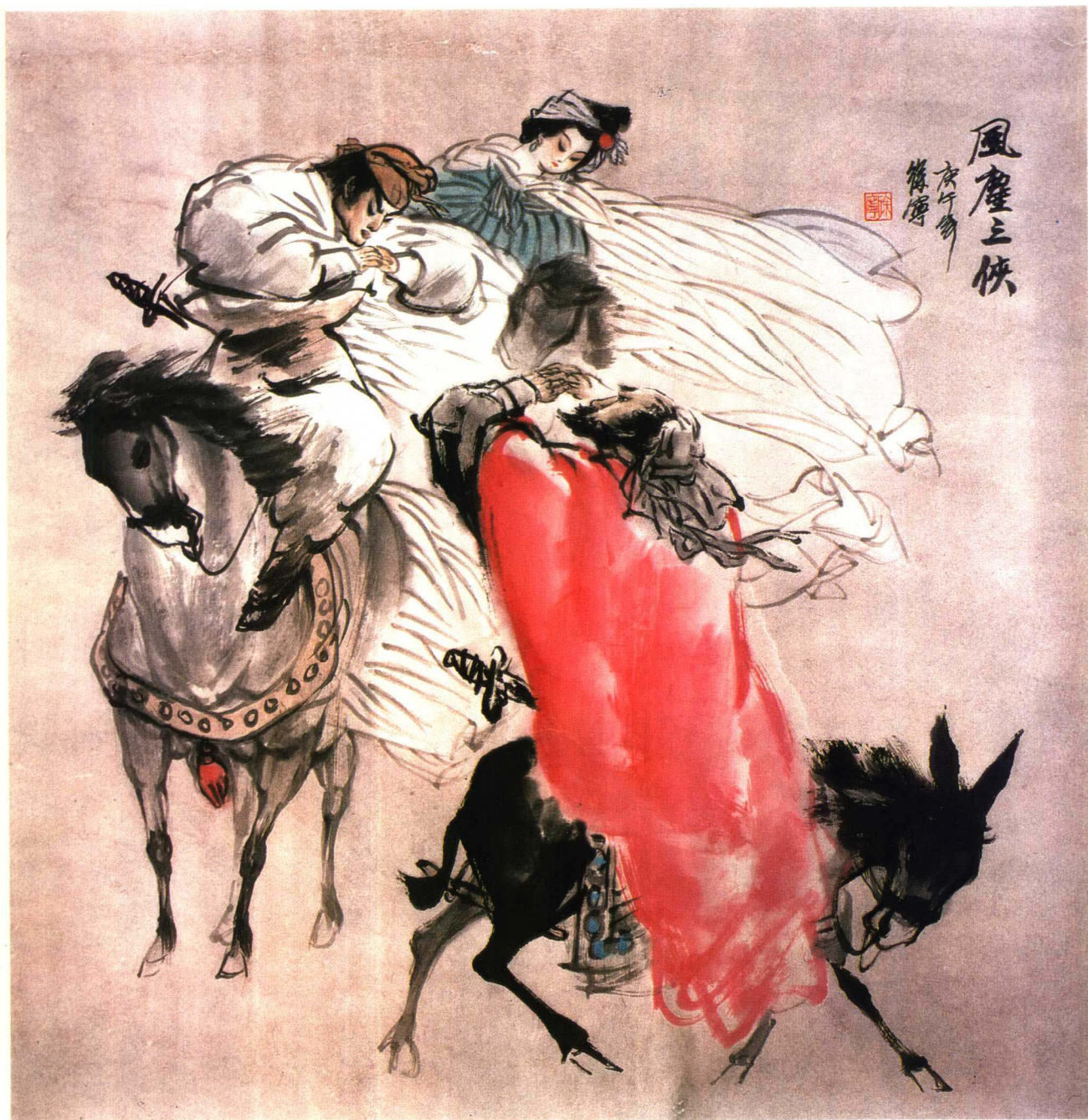
風塵三俠 Three Chevaliers.