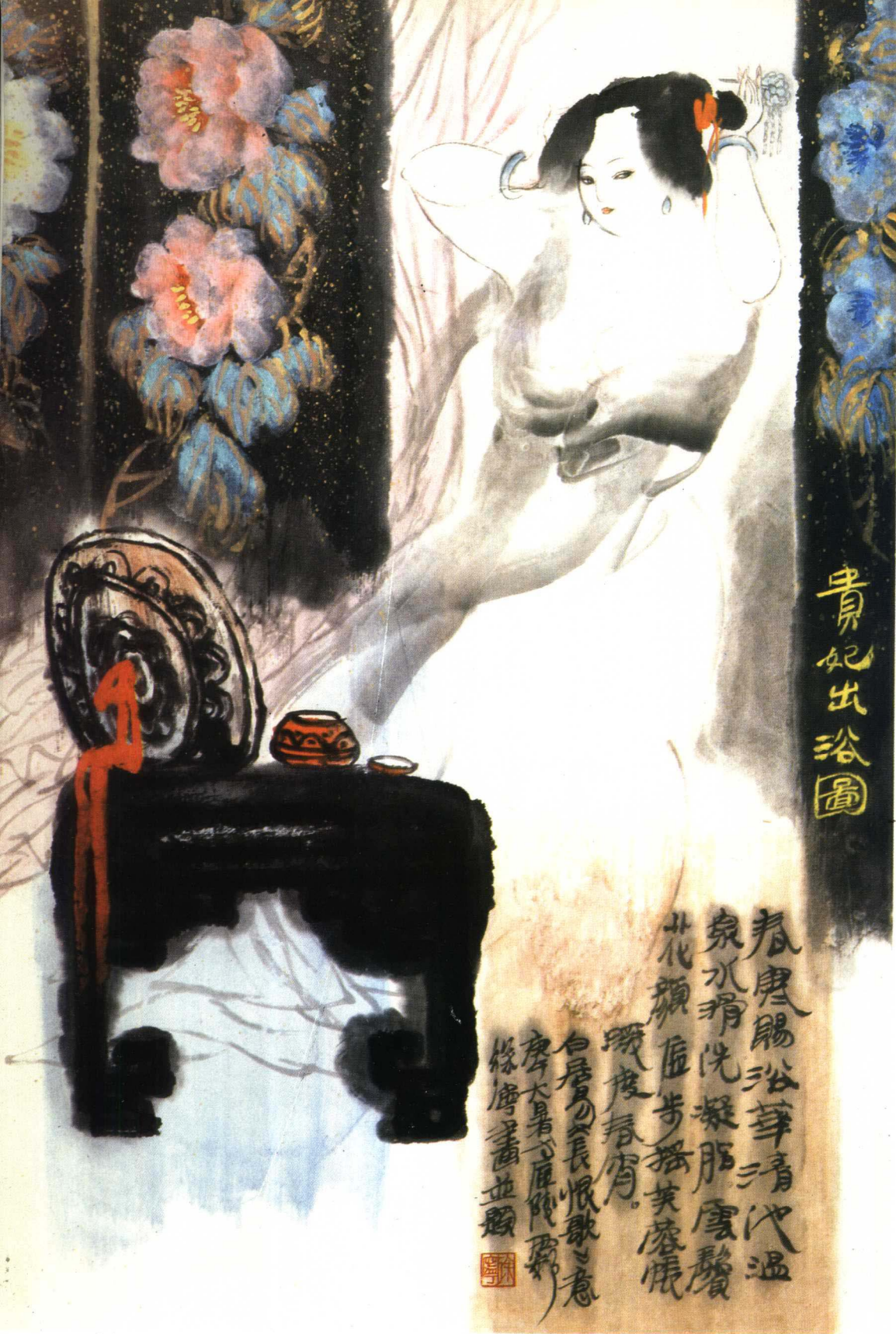
貴妃出浴圖 (69×46cm) 1990年 After a Bath.