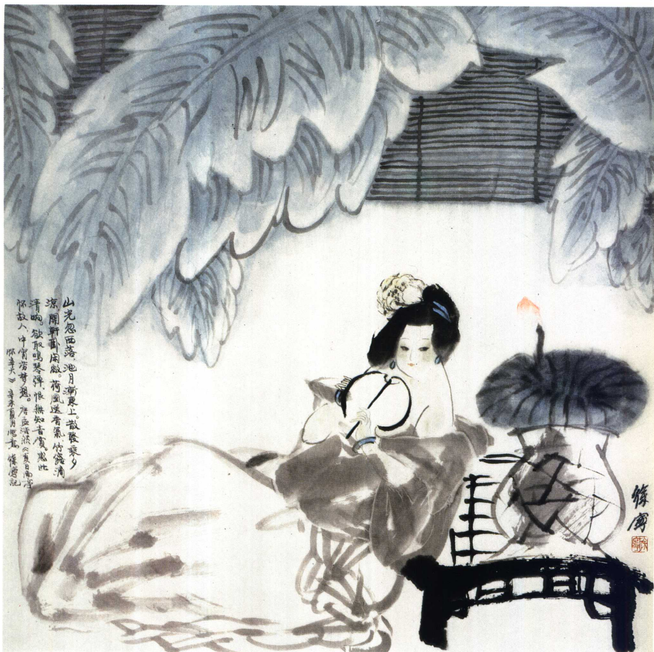
風荷送香氣竹露滴清響 1991年 Lotus in the Wind.