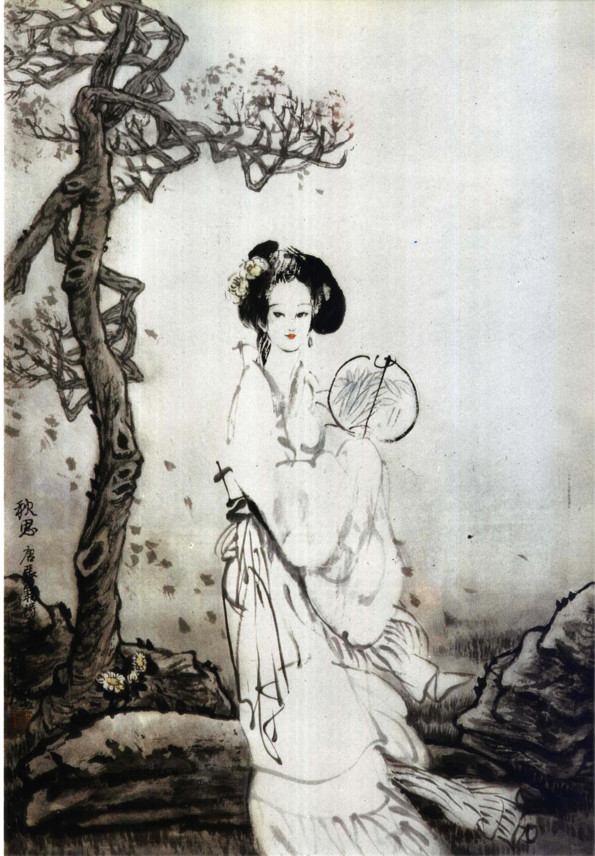
獵歸圖 (46×52cm) 1985年 Above: Hunting Back.