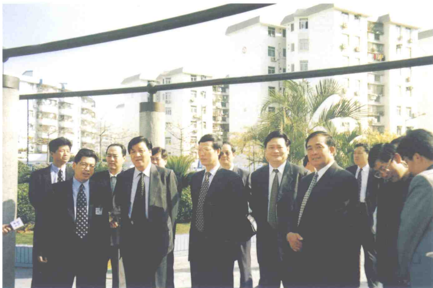
中共中央宣传部常务副部长刘云山同志（左四）来我区指导工作 Comrade Liu Yunshan, managing vice-minister of the Propaganda Department of the CPC Central Committee, (four of left) comes to our district to guide the work.