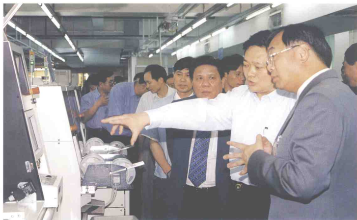
● 省委常委、市委副书记、市长于幼军同志视察福田企业 Comrade Yu Youjun, member of the provincial standing committee of the CPC, deputy secretary of the Municipal Party Committee, mayor of Shenzhen, inspects the enterprise of Futian District.