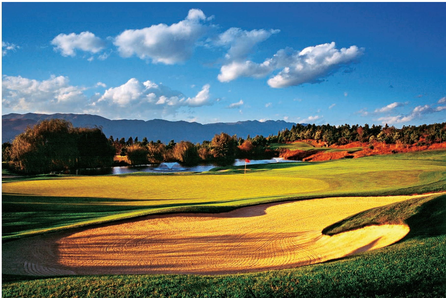
高尔夫球场 Golf Course