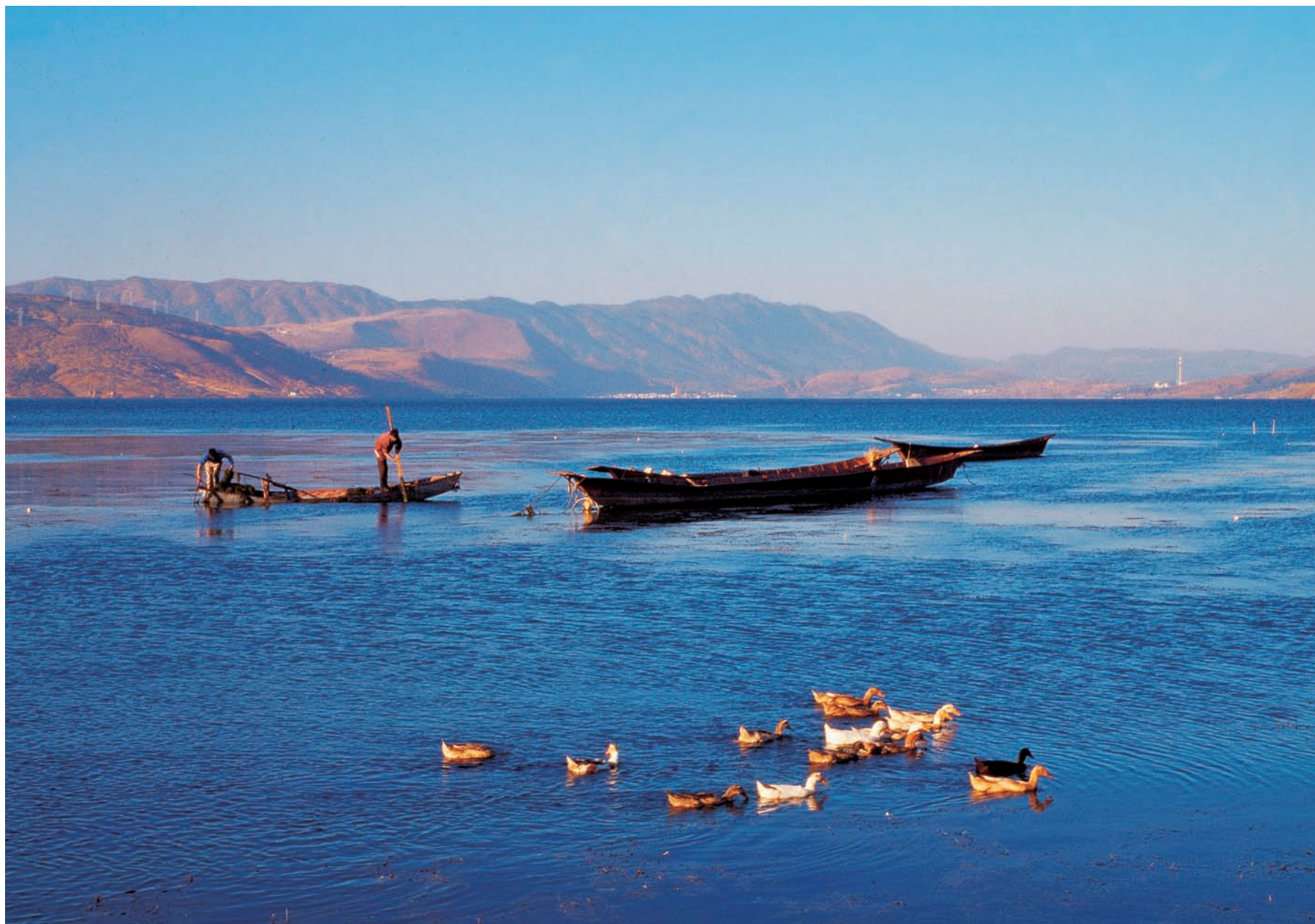
踏青波 Gooses Floating on Lake