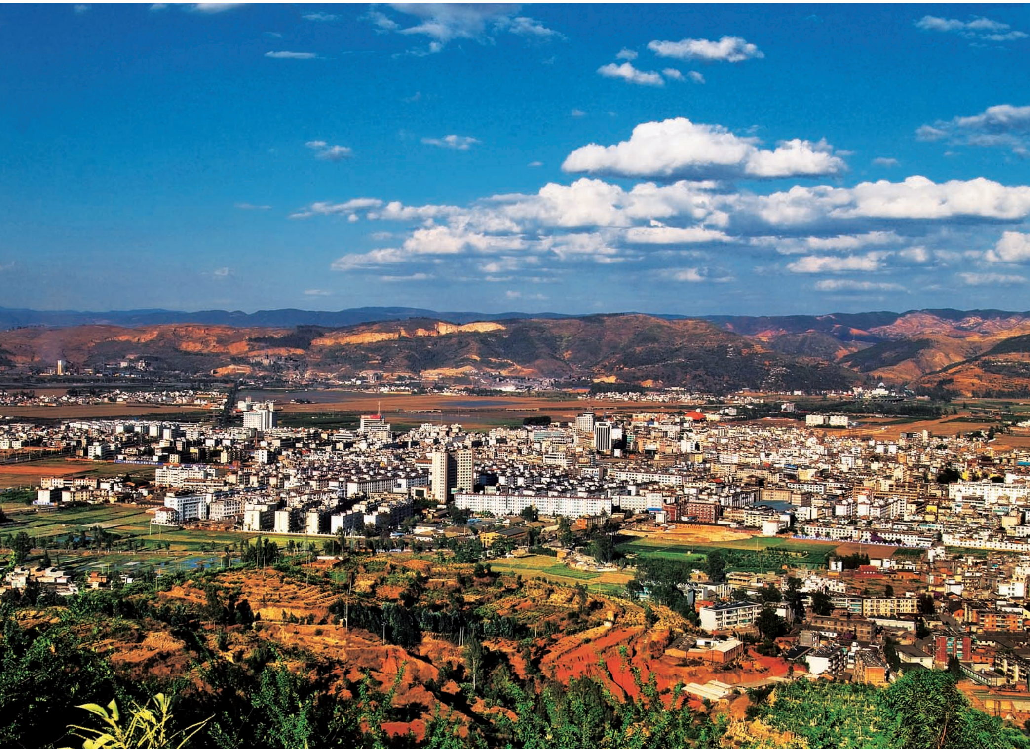
宜良城 Yiliang Town Seat