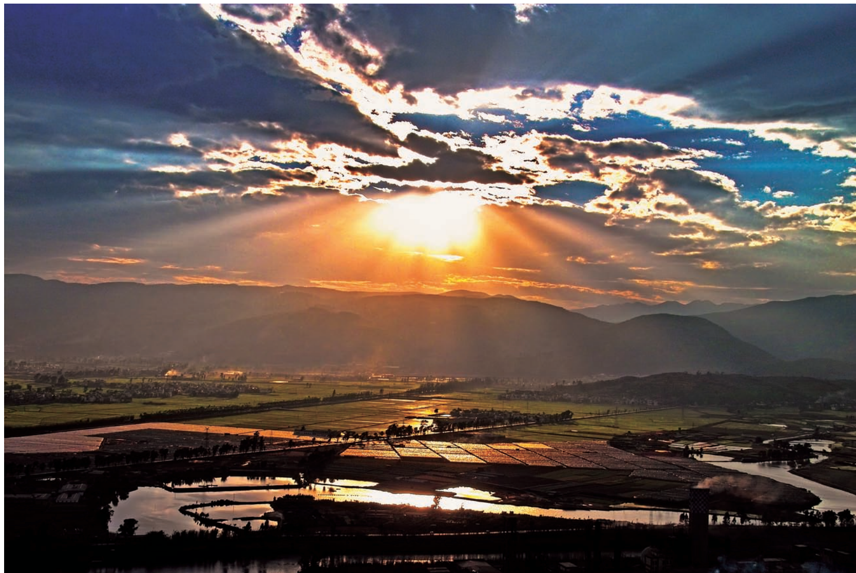
天光 The Rays of Sunlight