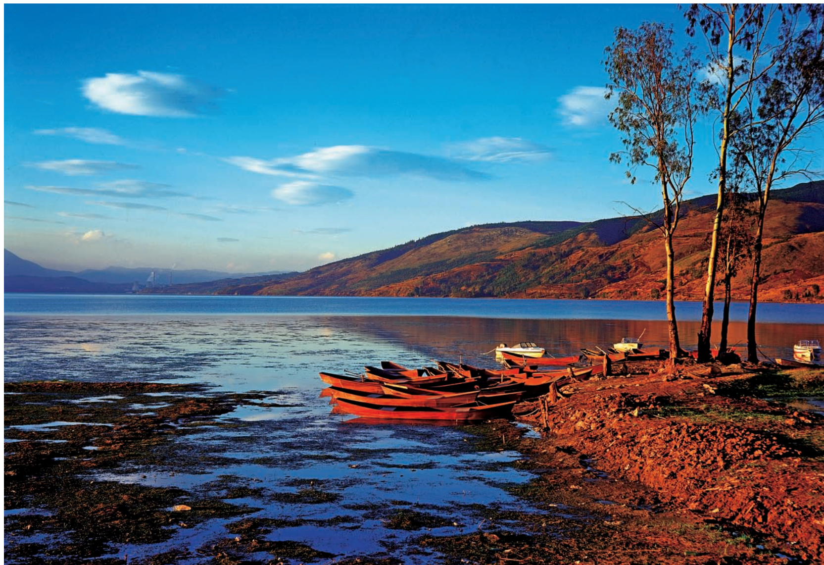
阳宗海小憩 a Cozy Corner at Yangzong Lake