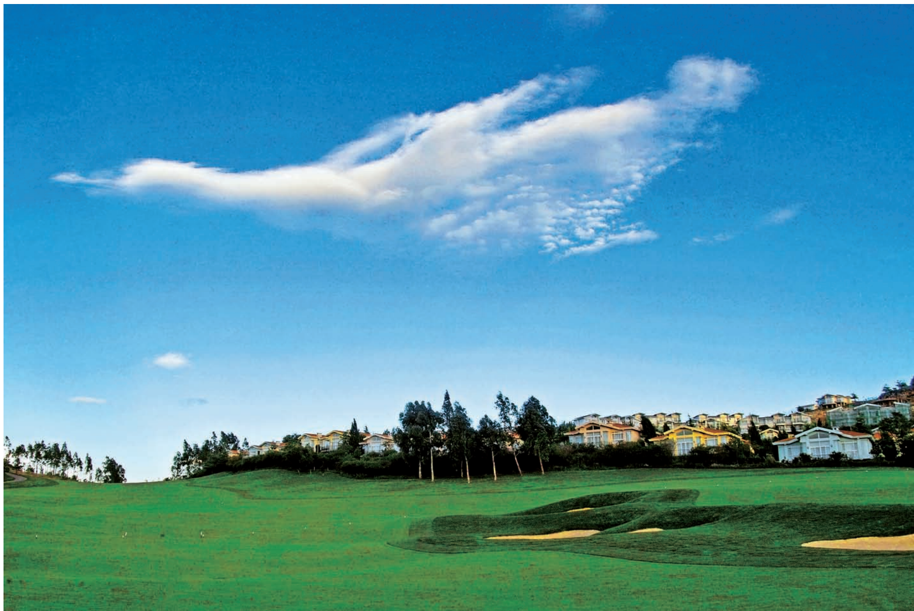
飞翔 Awing Swan