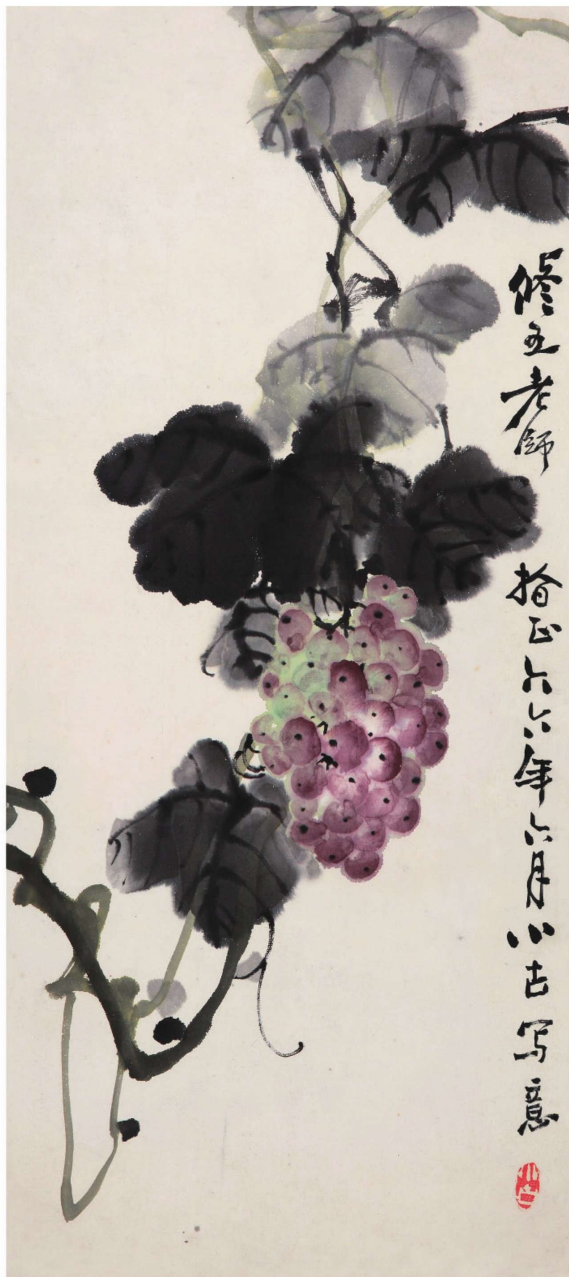
花鳥四條屏之葡萄 紙本設色 69cm × 32cm 1966 年