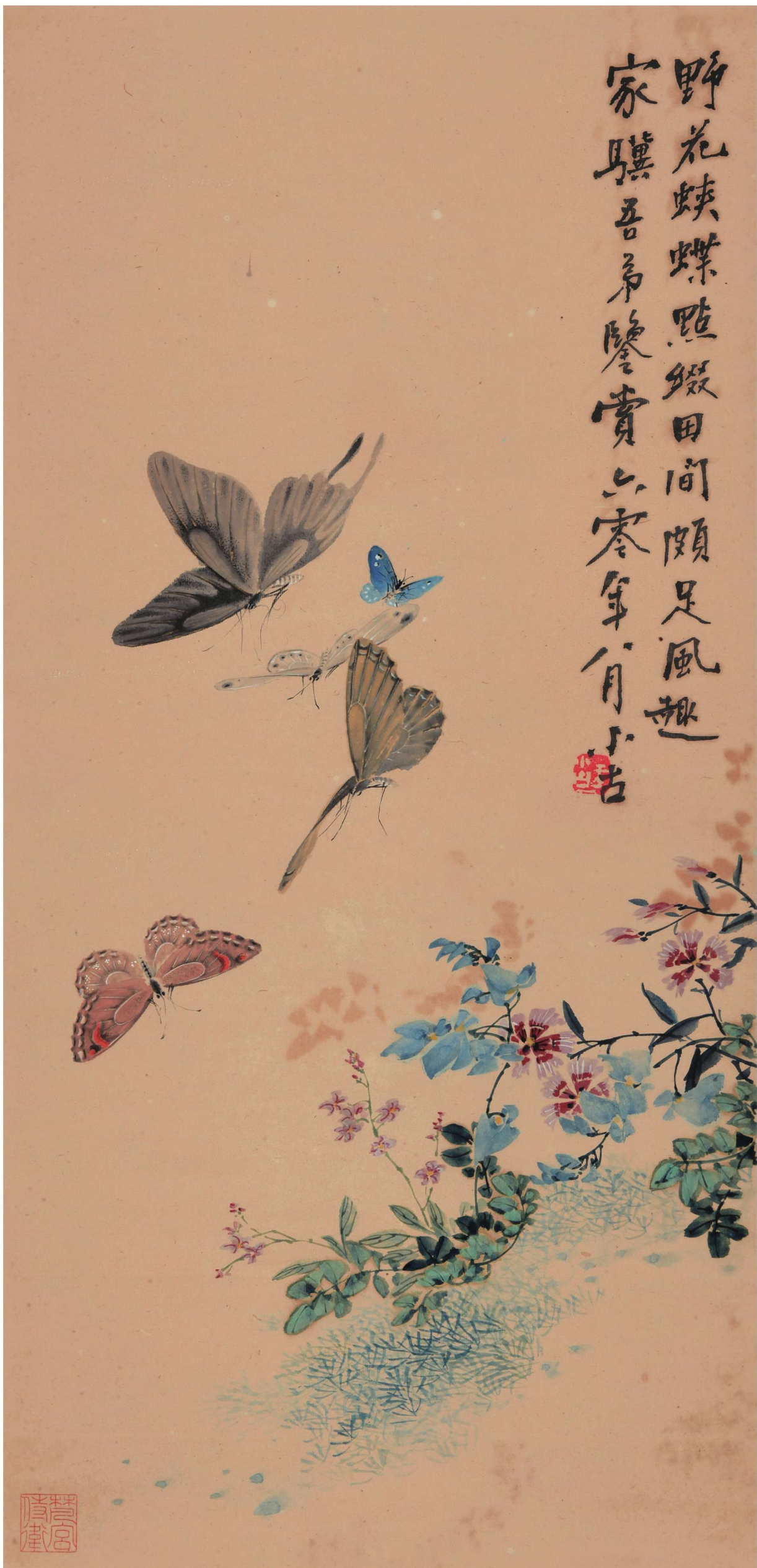
野花蛺蝶 紙本設色 66.5cm x 32cm 1960年