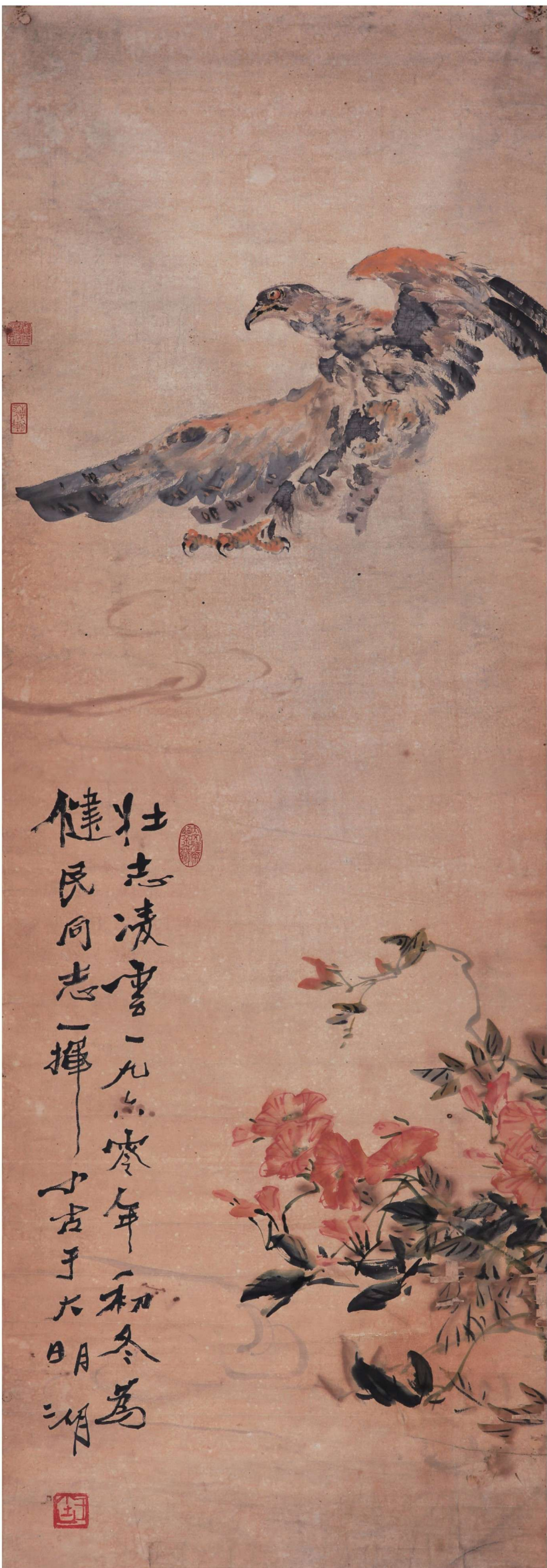
壯志凌雲 紙本設色 172.5cm x 60cm 1960年