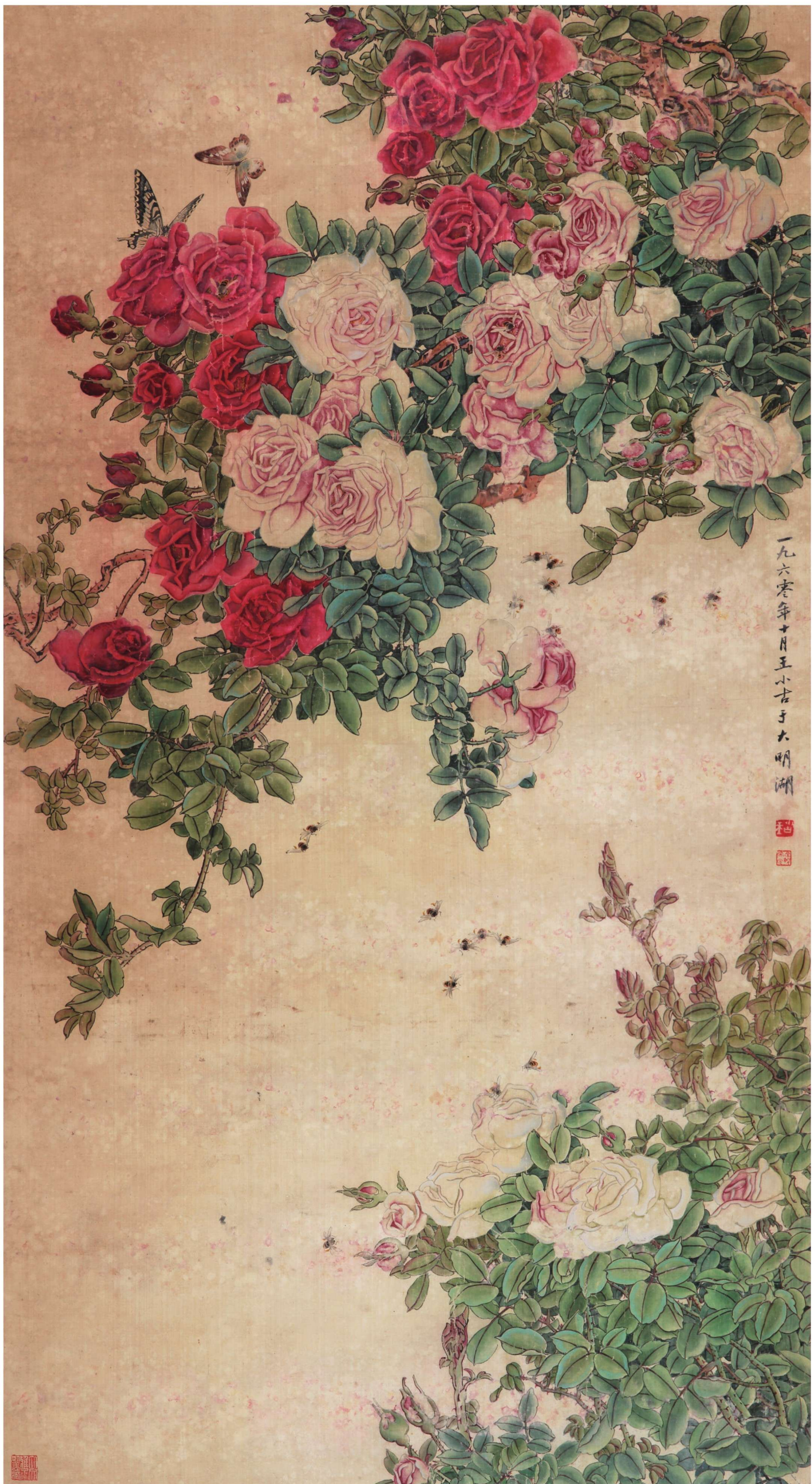
萬畝玫芳一角 絹本設色 133cm×72.5cm 1960年 (1962年山東出版社《山東國畫選》已出版)