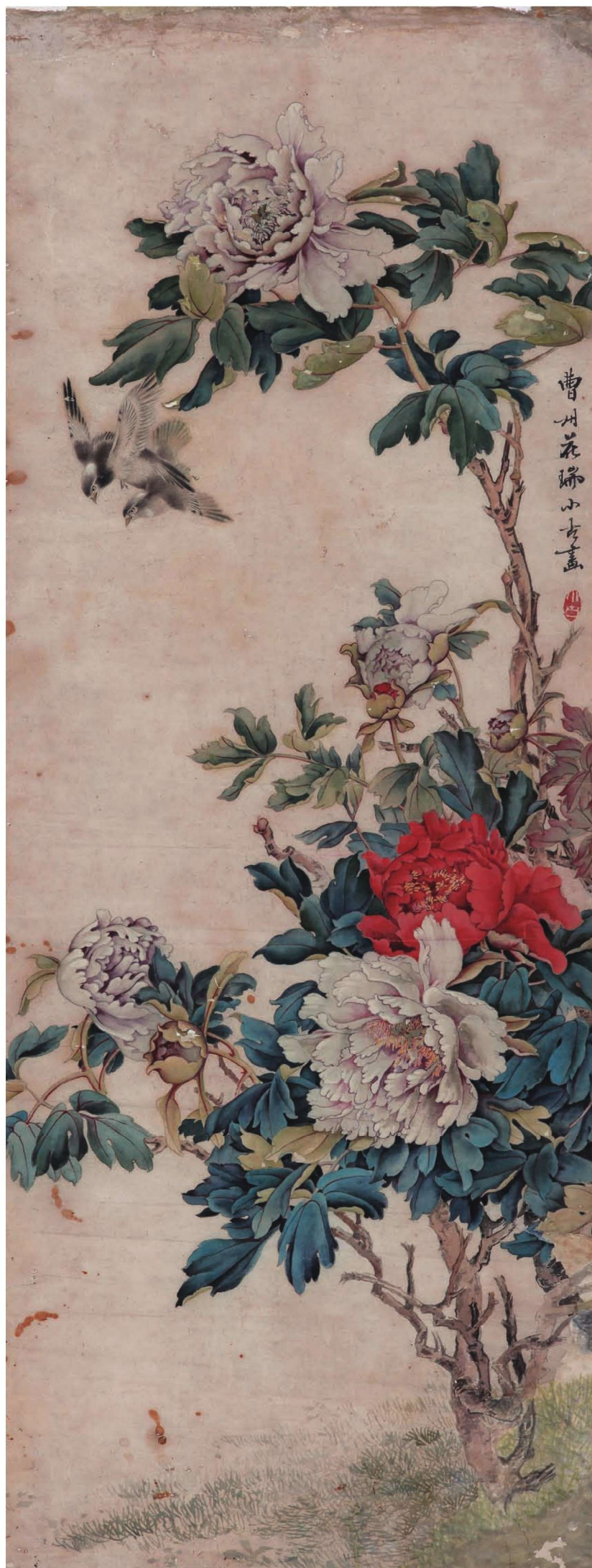
花鳥四條屏之曹州花瑞 紙本設色 127.5cm × 48cm 1962 年 (1962、1995 年山東美術出版社已出版)