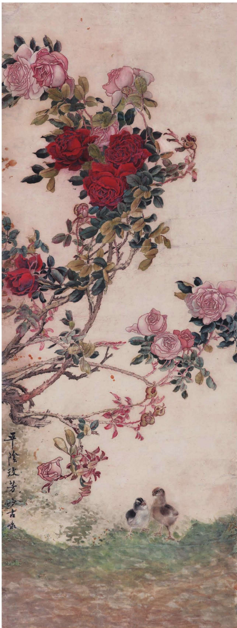
花鳥四條屏之平陰玫芳 紙本設色 127.5cm × 48cm 1962 年 (1962、1995 年山東美術出版社已出版)