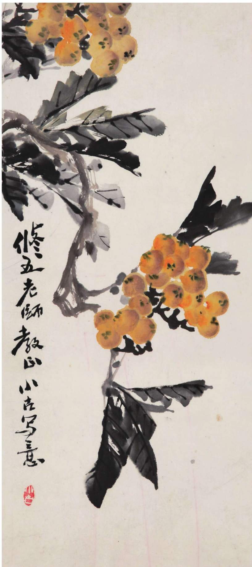
花鳥四條屏之枇杷 紙本設色 69cm × 32cm 1966 年