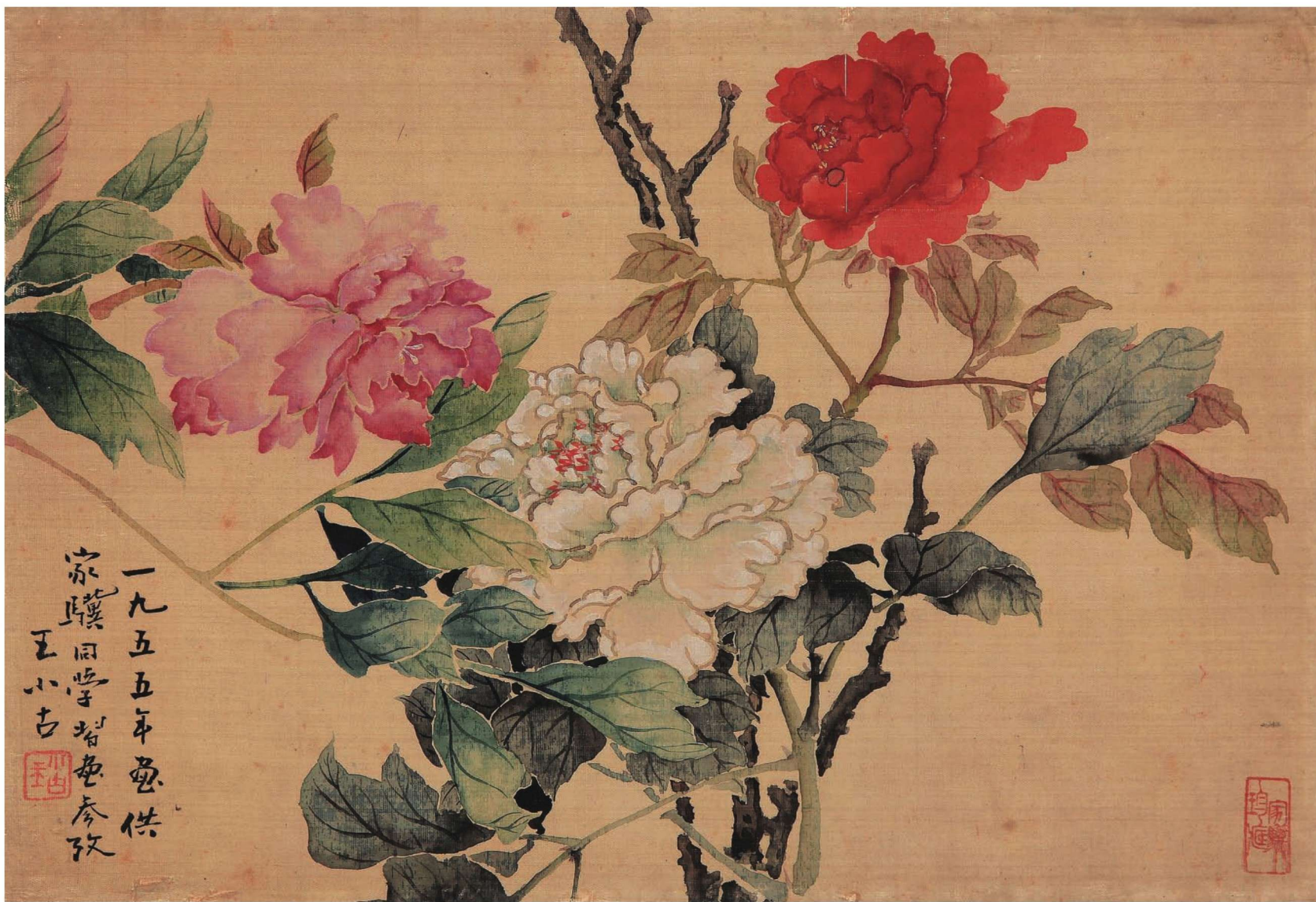
牡丹三種 絹本設色 34.5cm×23.5cm 1955年 (1995年山東美術出版社已出版)