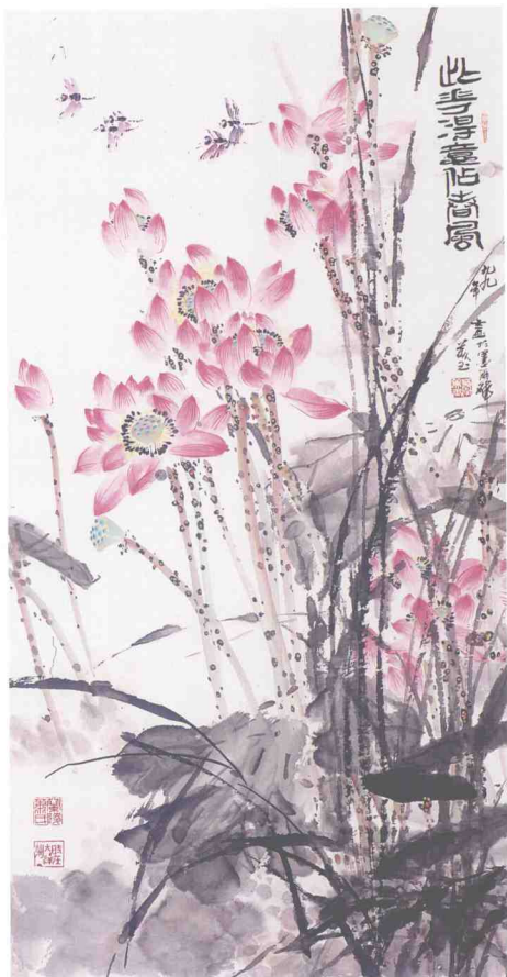
肖美玉 《此花得意占春风》 澳大利亚 Xiao Mei Yu Rhythm of Spring Australia