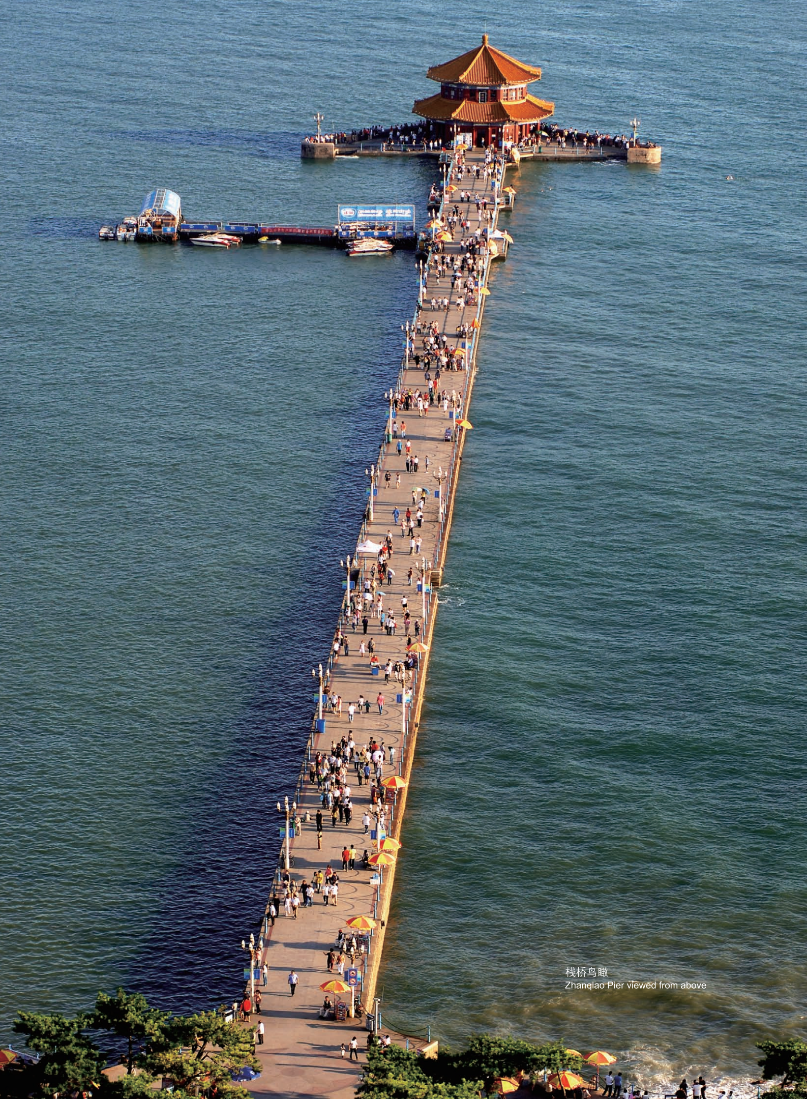
栈桥鸟瞰 Zhanqiao Pier viewed from above