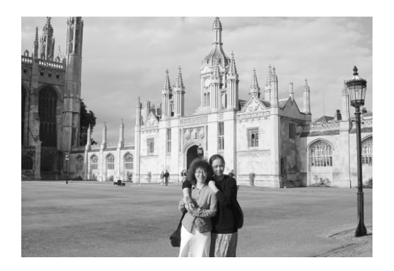
University of Cambridge