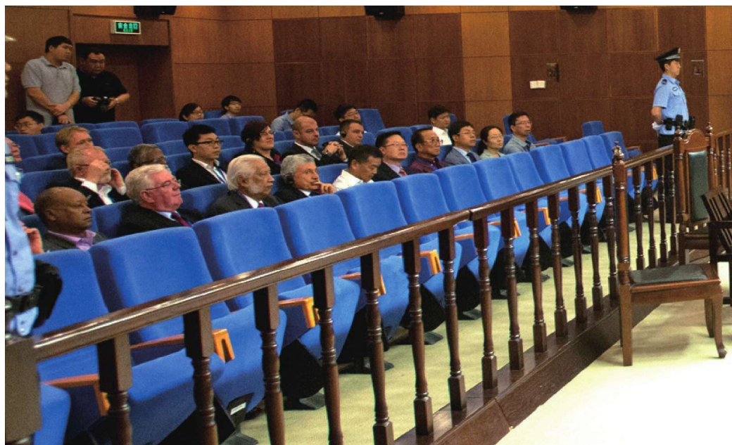
The Dialogue participants visit a court in Beijing.