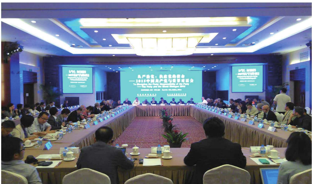
The Dialogue participants are making concluding remarks at the Closing Ceremony.