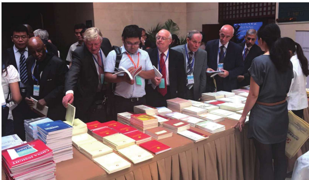
The Dialogue participants are taking books on China in a queue.