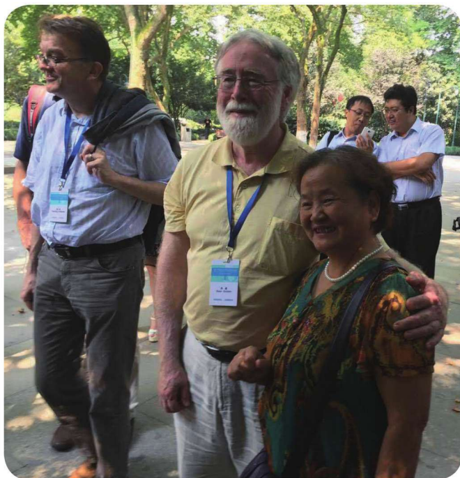
The local people volunteer to introduce the local scenic spots to the Dialogue participants.