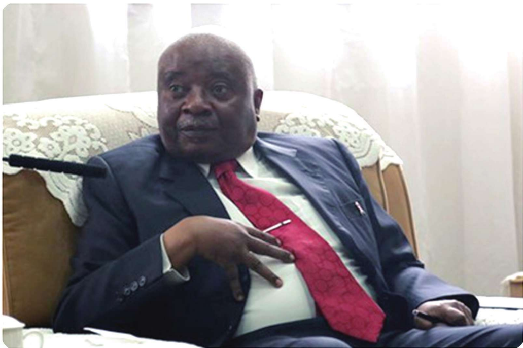
Mr. Armando Guebuza, former President of Mozambique, makes some concluding remarks.