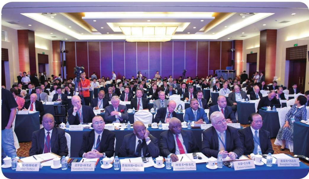
This is a glimpse of the conference hall for the Plenary Session of the Dialogue.