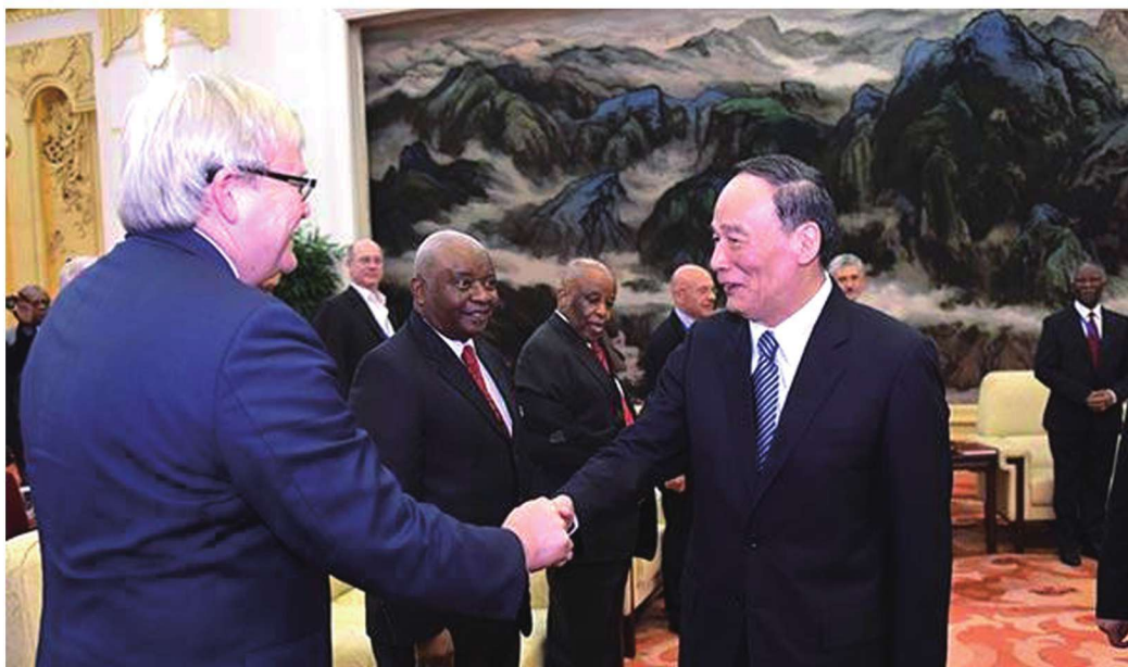
Mr. Wang Qishan, Member of the Standing Committee of the Political Bureau of the CPC Central Committee and Secretary of the CPC Central Commission for Discipline Inspection (CCDI), meets with the Dialogue participants.