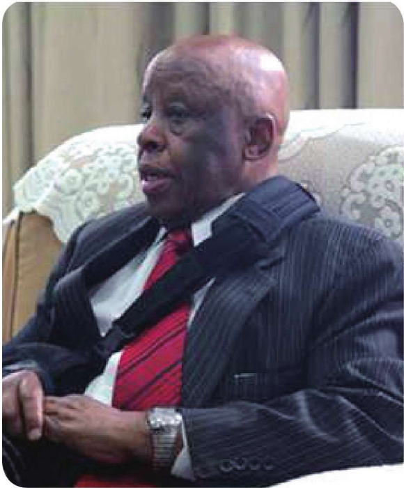
Mr. Festus Mogae, former President of Botswana, makes some concluding remarks.