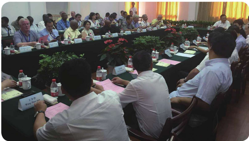
The Dialogue participants have discussions with the villagers from Wusi Village of Deqing County in Zhejiang Province.