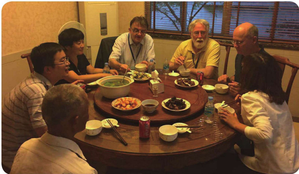
The Dialogue participants are having dinner in the rural Family at Wusi Village of Deqing County in Zhejiang Province.