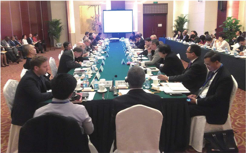
This is a glimpse of the meeting room for Panel discussions.