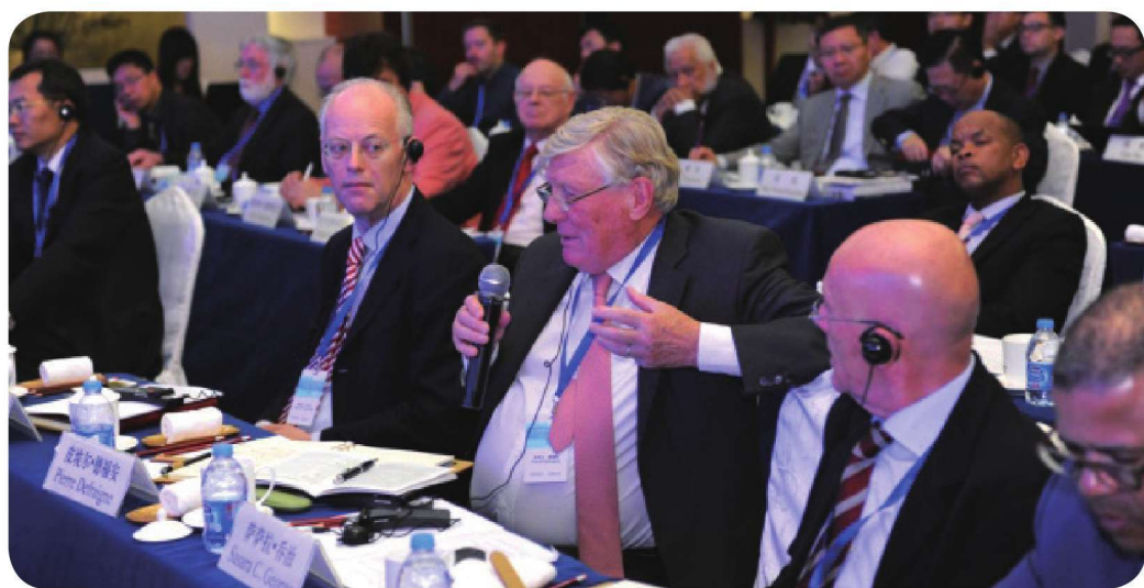
The Dialogue participants are actively making speeches at the Dialogue.