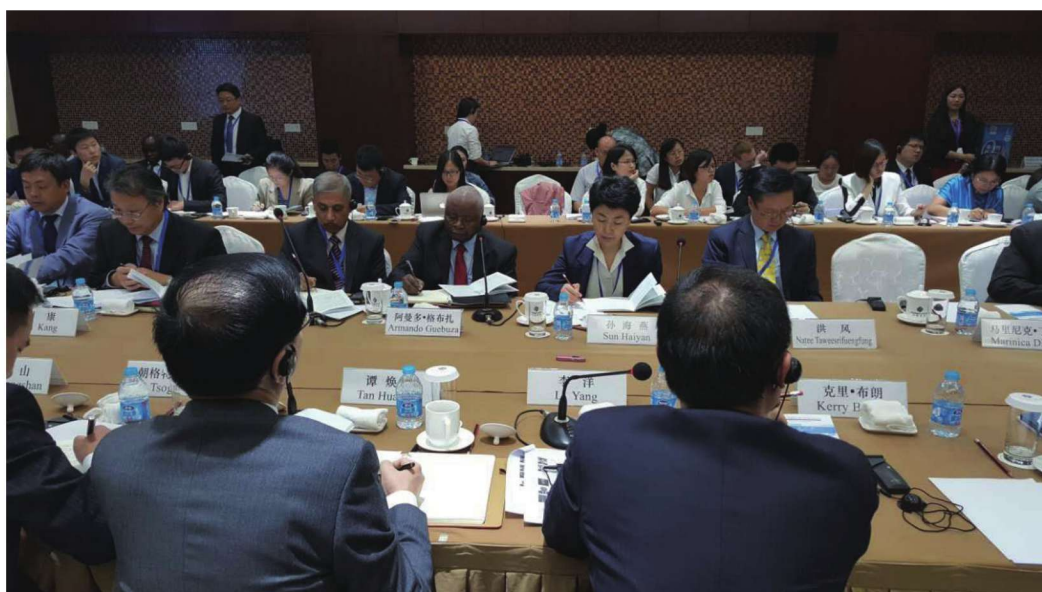
The Dialogue participants including Mr. Armando Guebuza, former President of Mozambique, are taking notes carefully in the Panel discussions.