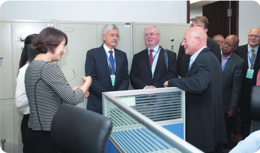
The Dialogue participants visit the website of Discipline Inspection Department of the Commission for Discipline Inspection of the CPC Central Committee.