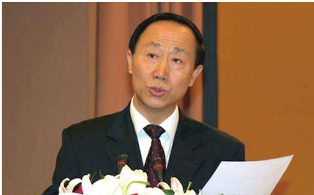
Mr. Wang Jiarui, Vice Chairman of the 12th National Committee of the Chinese People's Political Consultative Conference, Minister of International Department of CPC Central Committee, and Honorary Council Chairman of CCCWS, addresses the Dialogue.