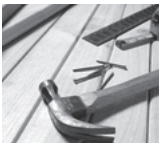
Maintenance and Repair Worker