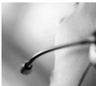
Customer Service Representative