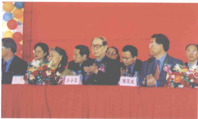
● 全国政协副主席孙孚凌同志(中) 参加我区联合办学新校落成典礼