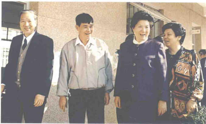
● 原全国人大副委员长陈慕华同志(右二) 视察我区学校