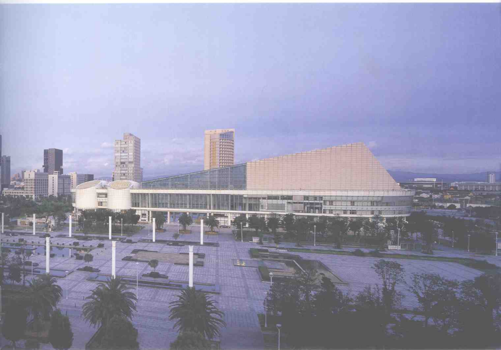
新城全景 (系列之三) Panorama of New City (Series III)