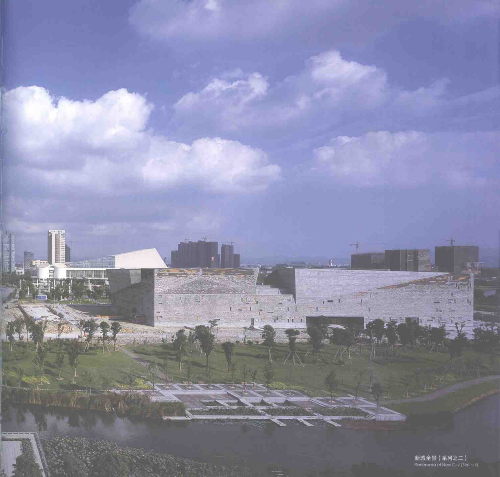
新城全景 (系列之二) Panorama of New City (Series II)