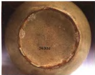
9 越窑青釉四繫壺 唐 公元618 - 907年 高15.5cm 口徑6.95cm 底徑7.2cm 上海博物館藏