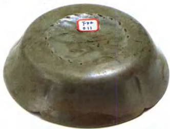
5 越窑秘色瓷花口盤 唐 公元618-907年 高6.2cm 口徑24.5cm 底徑9.5cm 1987年陝西扶風法門寺地宮出土 法門寺博物館藏