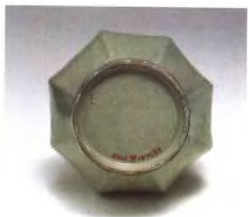
2 越窑秘色瓷八棱瓶 唐 公元618 - 907年 高22.5cm 口径1.7cm 足径7.2cm 故宫博物院藏