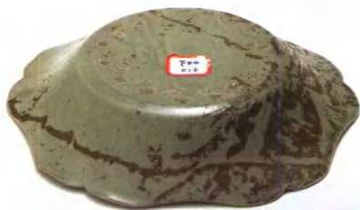
3 越窑秘色瓷花口盘 唐 公元618—907年 高4cm 口径25.3cm 底径14.5cm 1987年陕西扶风法门寺地宫出土 法门寺博物馆藏