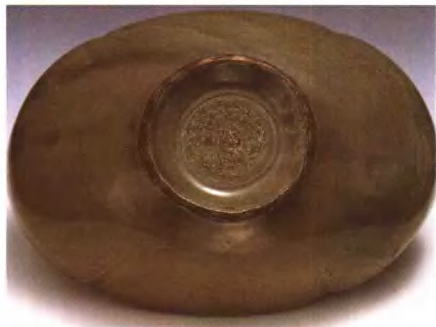
8 越宮青釉海棠式碗 唐 公元618—907年 高10.8cm 口縱23.3cm 口橫32.2cm 足徑11.4cm 上海博物館藏