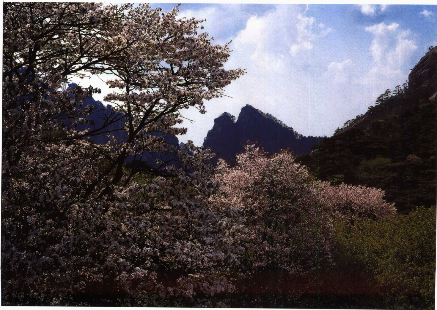
层峦叠翠 Verdant peaks