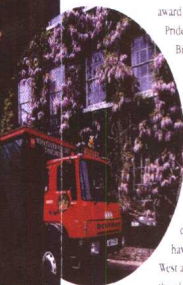
Fuller's Brewery House

Fuller, Smith & Turner's Griffin Brewery in Chiswick is London's oldest brewery. It nestles comfortably between the River Thames, and the busiest junction in Europe, the Hogarth Roundabout, named after the 18th century artist whose house stands nearby. History has it that a brewery has stood on this same Chiswick site since the time of Oliver Cromwell, perhaps that is why Hogarth built his house so close!