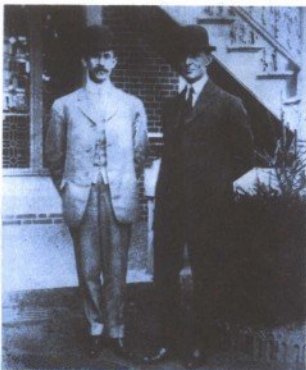
Wilbur Wright, 1867-1912; Orville Wright, 1871-1948