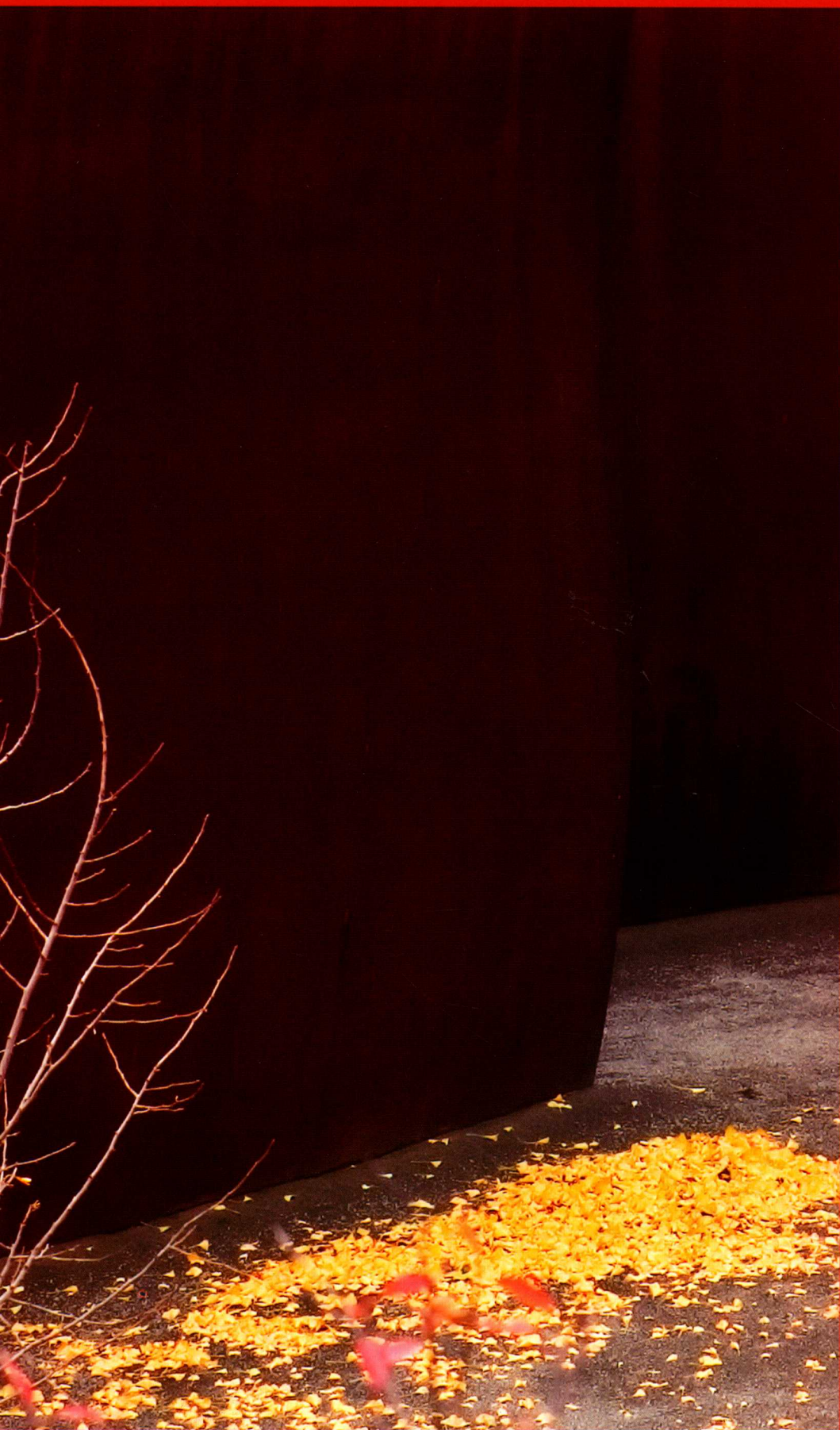
Wake 2004 , Richard Serra at The Gardens of the Olympic Sculpture Park 奥林匹克雕塑公园花园中的“觉醒”雕塑（2004年，理查德·塞纳作品）