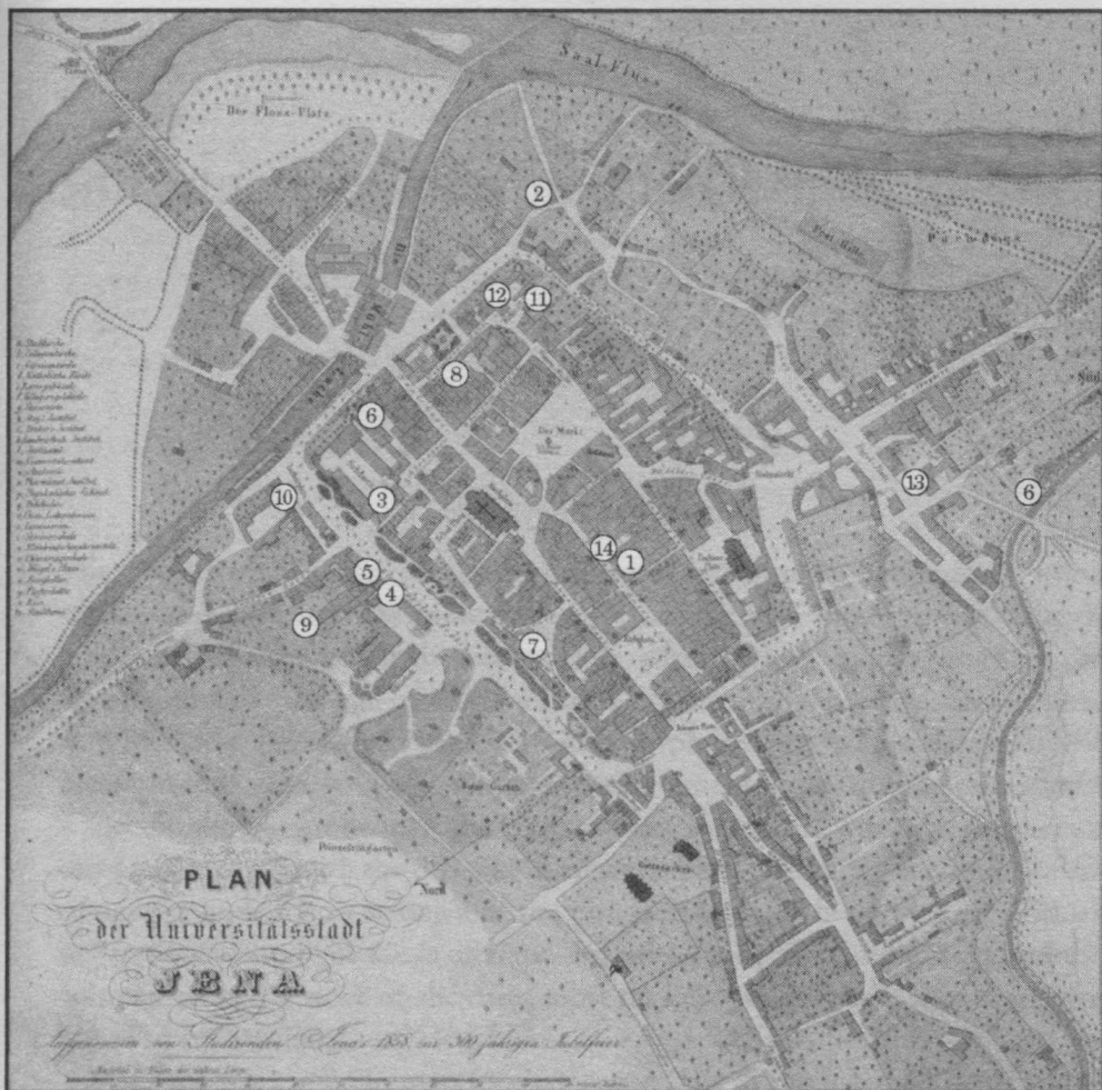
Plan of Jena, 1858, reproduced by permission of the St dtische Museen Jena. Guide to the Jena residences of philosophers and other notable figures in the early 1800s