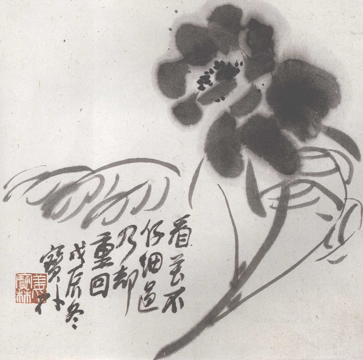
册頁 (34×34cm) 1988年 Untitled.