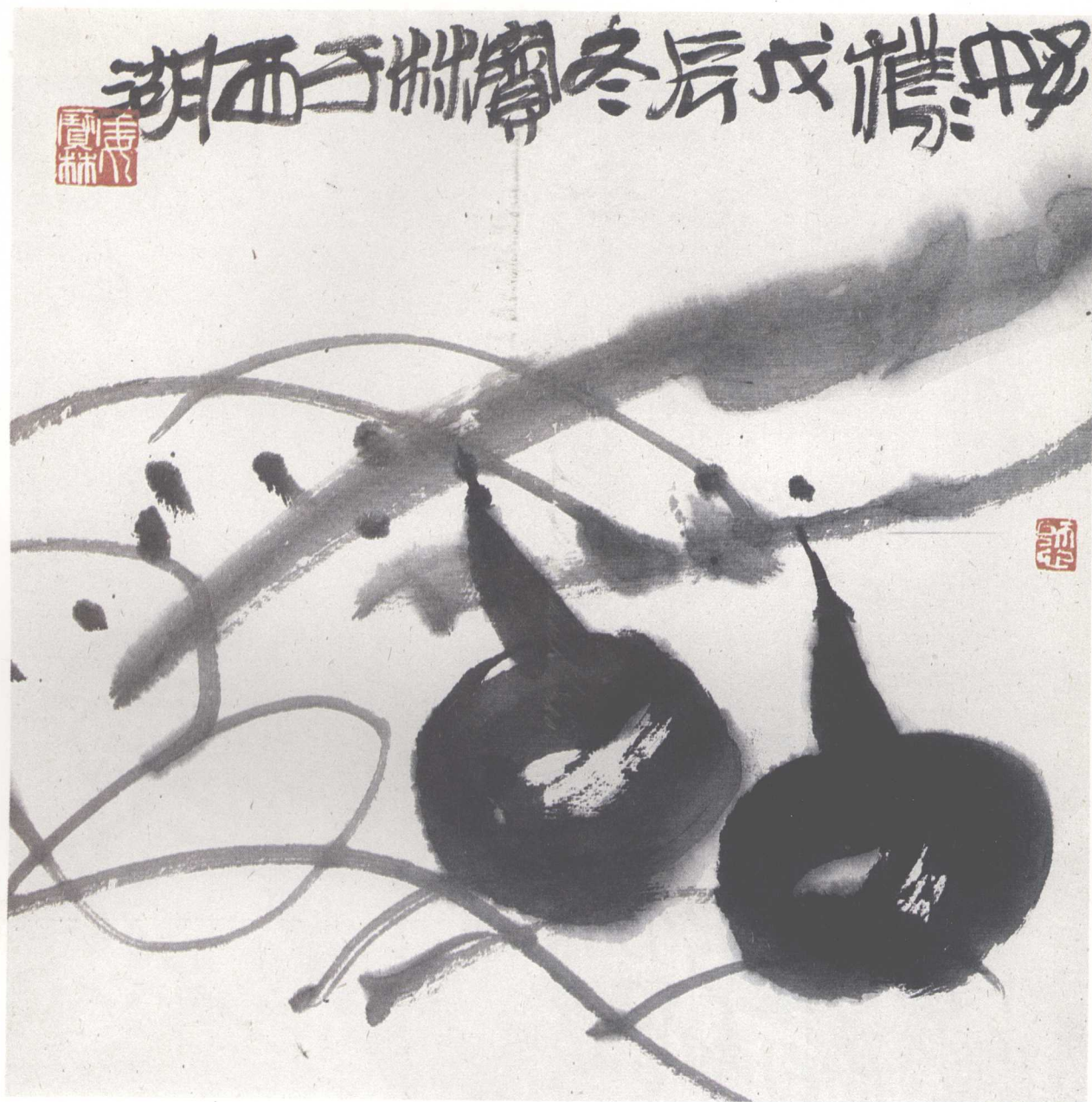
册頁 (34×34cm) 1988年 Untitled.