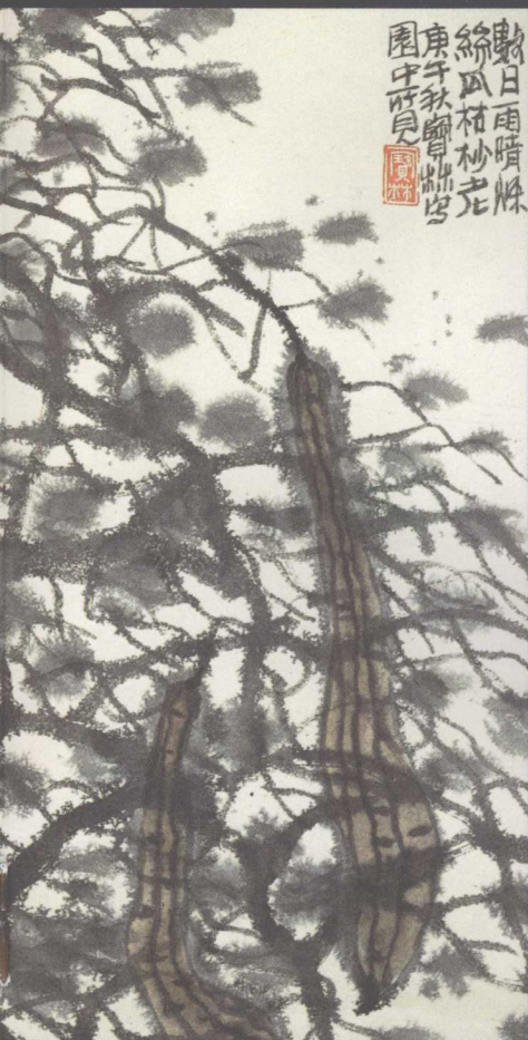
秋風 (68×136cm) 1990年 Autumn Wind.