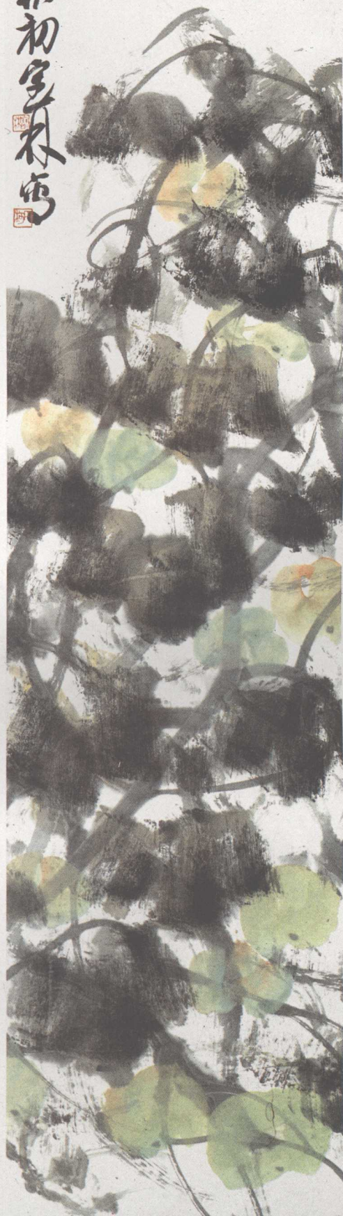
秋果 (34×36cm) 1990年 Autumn Fruit.