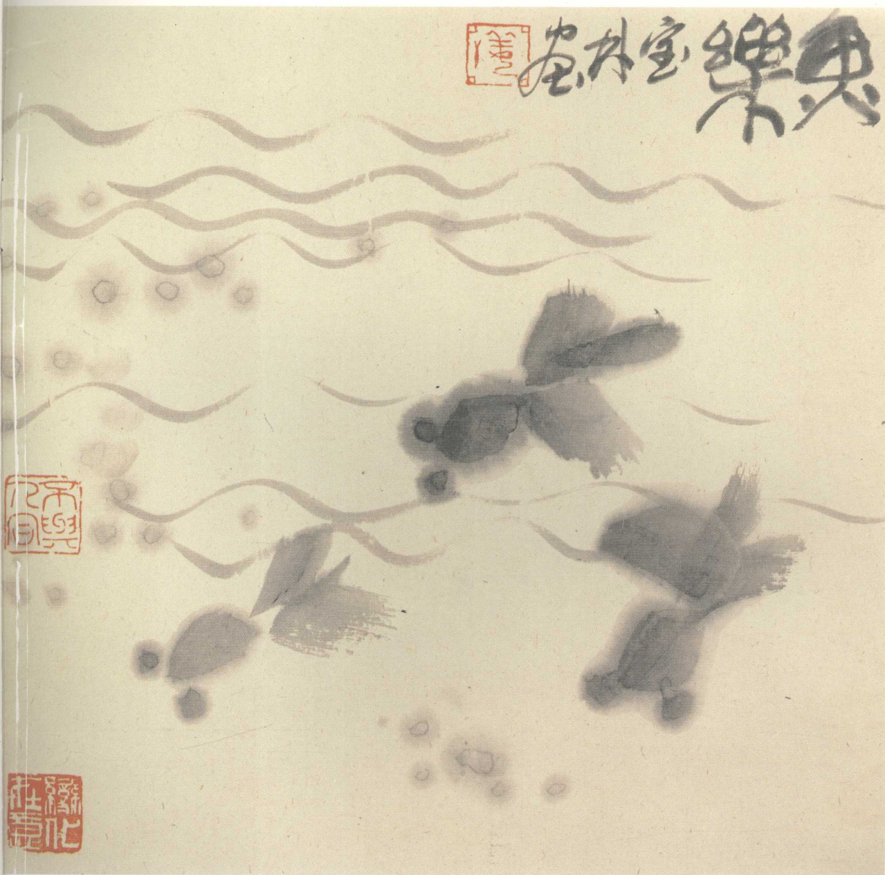
册頁 (34×34cm) 1988年 Untitled.