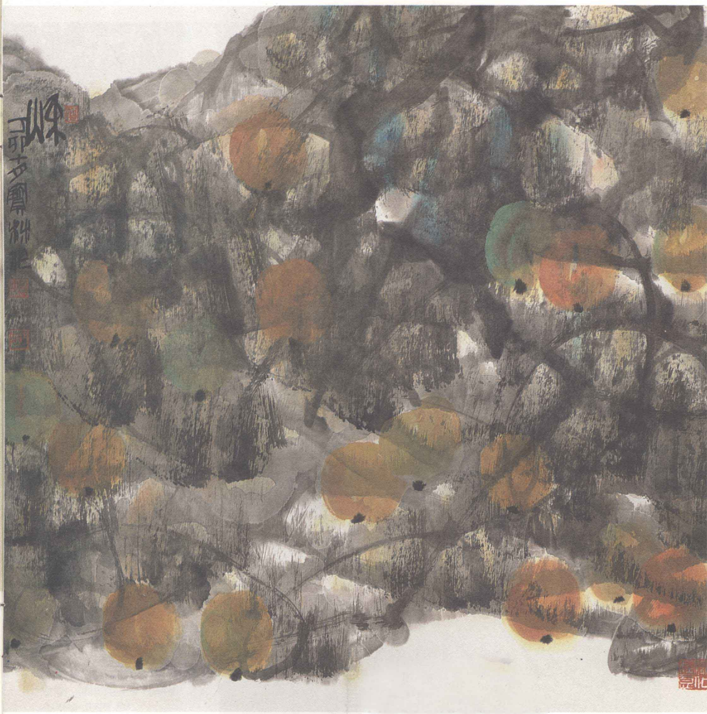
秋 (68×68cm) 1987年 Autumn.