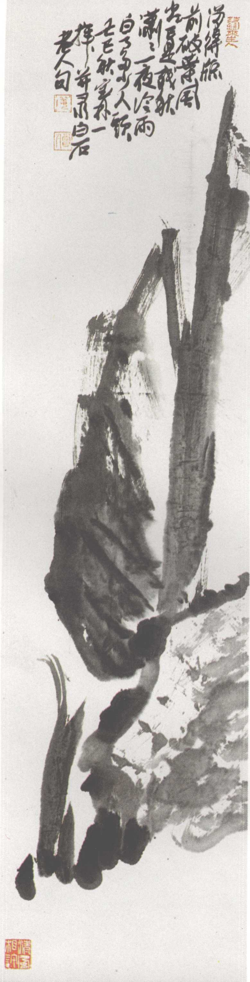
秋蕉 (34×136cm) 1989年 Banana in Autumn.