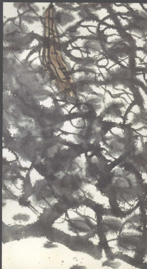
秋絲瓜 (68×68cm) 1990年 Towel Gourd.