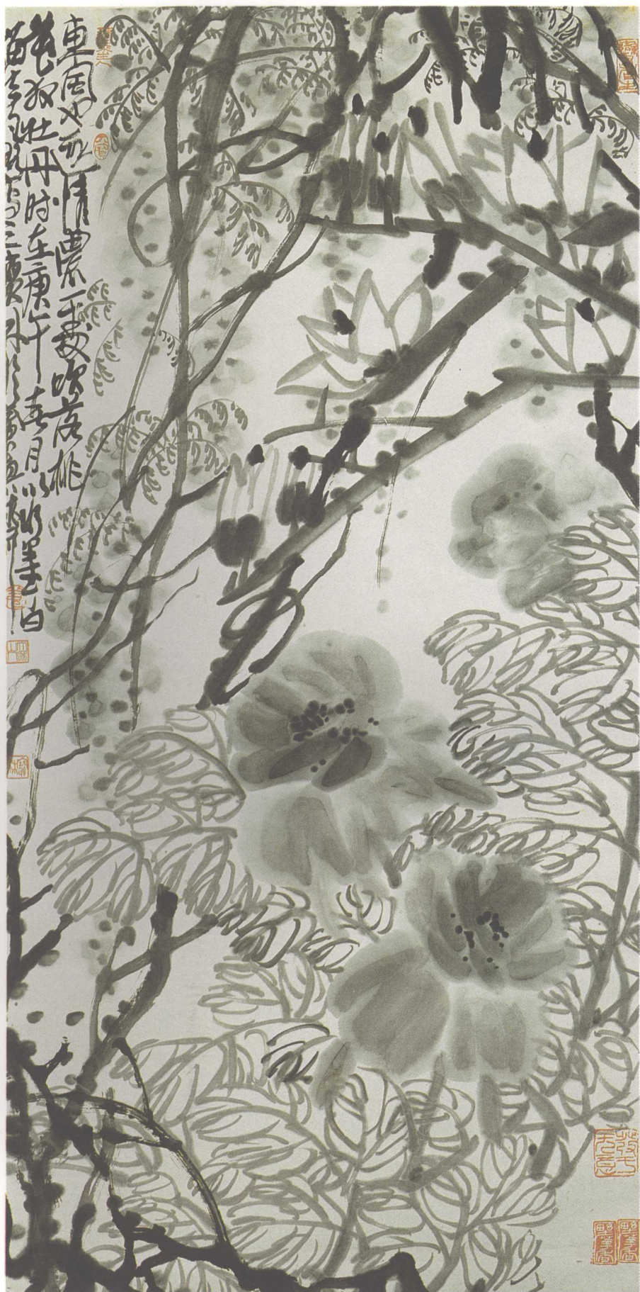
春酣 (68×136cm) 1990年 Spring in the Air.