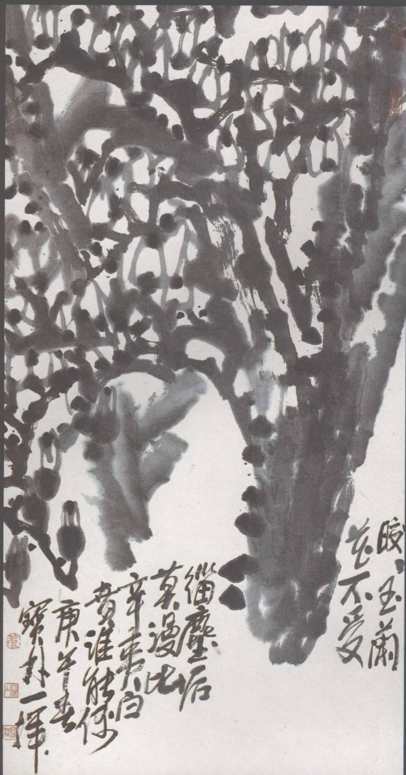
墨玉蘭 (68×136cm) 1990年 Yulan Magnolia.