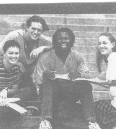
Reading to Develop Your Ideas