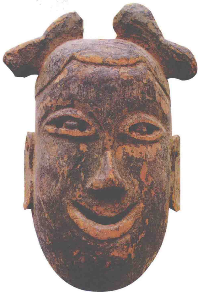
小僮 Little servant