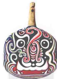
MASKS AND SHADOW PLAY OF CHINA

Masks with the most striking characteristics are those in Guizhou and Tibet of Southwest China. Guizhou mask is usually carved out of inflexible Chinese little-leaf box or clove and composed of three parts: the face, helmet and ears. The face and helmet are on the same timber, and the ears are made of offcuts, which are tied to the two sides of the mask. After being colorfully painted, it will be