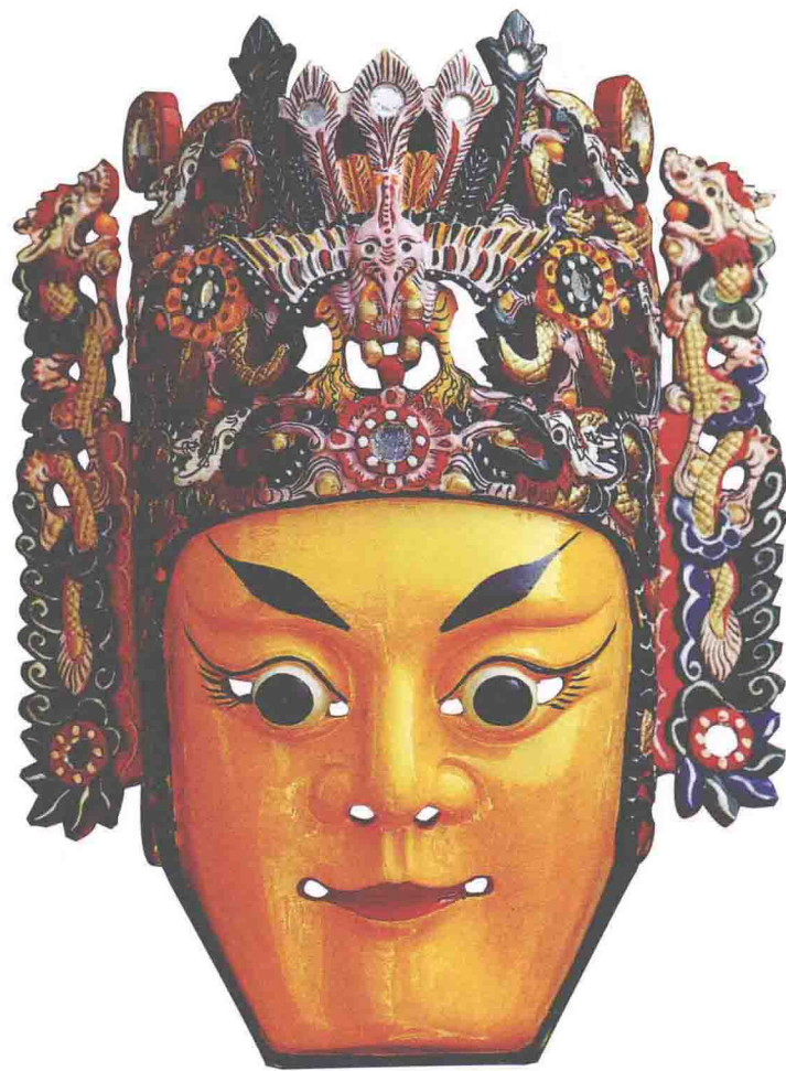
秦叔宝 Qin Shubao (a general in the Tang Dynasty)