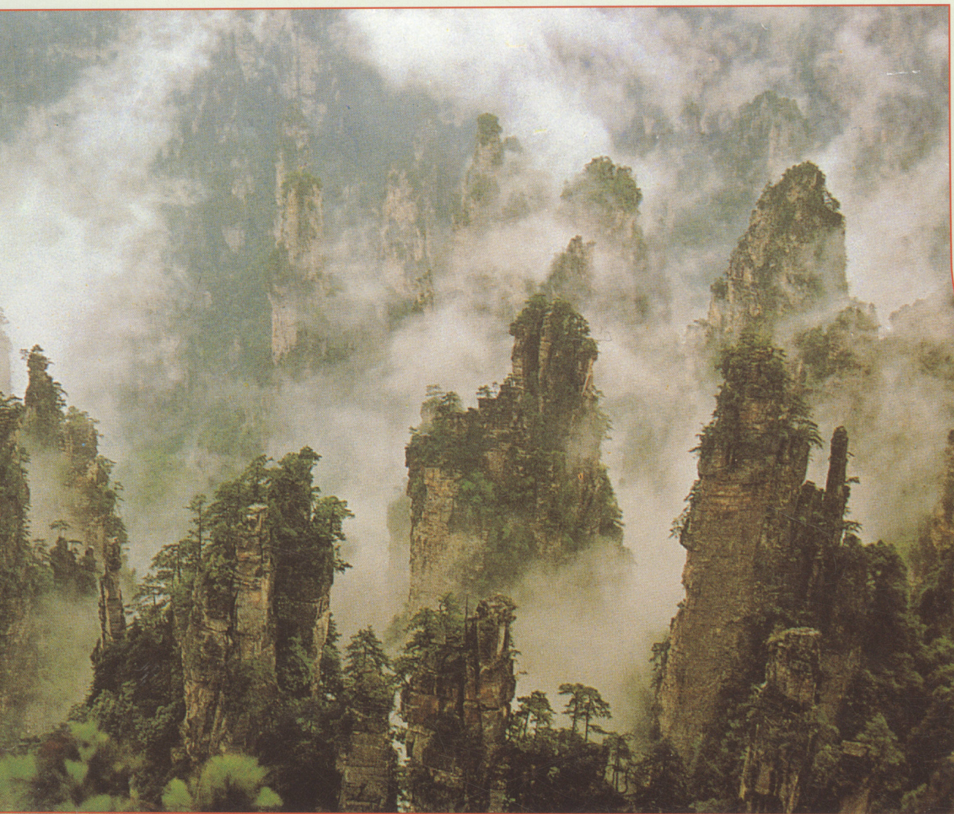
张家界 ZHANG JIA JIE