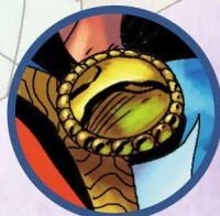
Eye of Agamotto