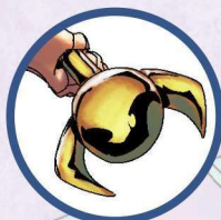
Wand of Watoomb