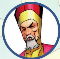
The Ancient One