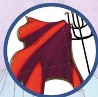
Cloak of Levitation