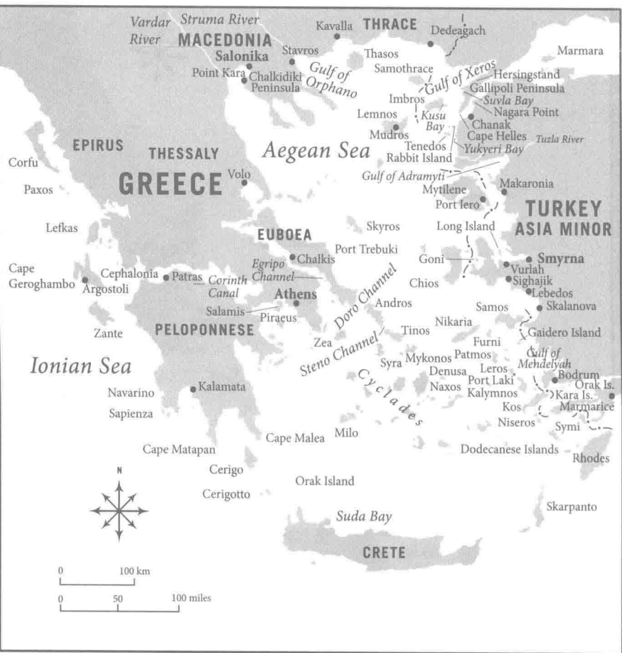
Map 2. The Mediterranean Sea