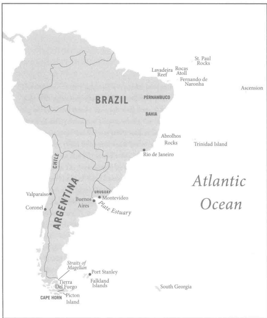
Map 3, South America