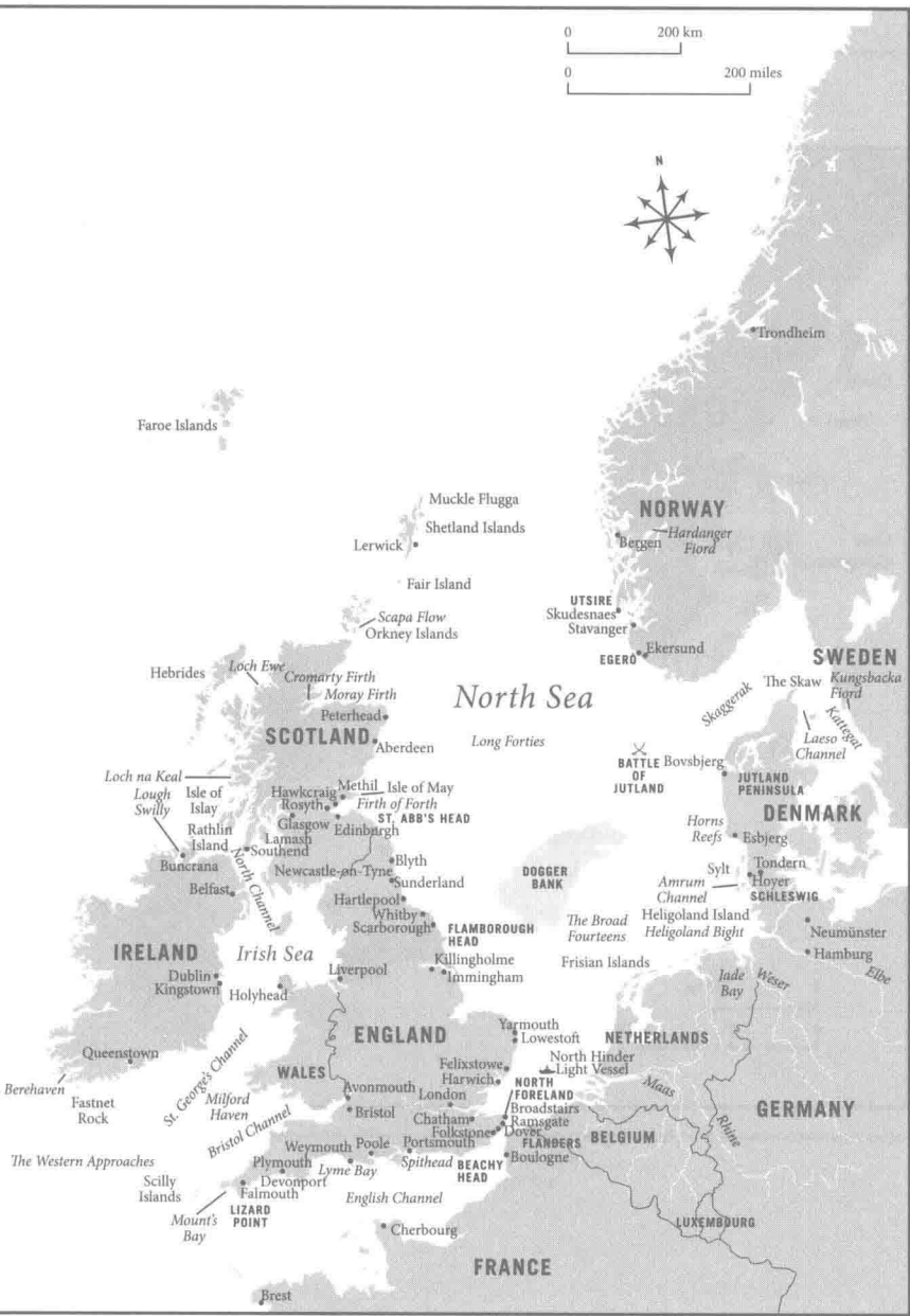
Map 1. The North Sea, including the Western Approaches