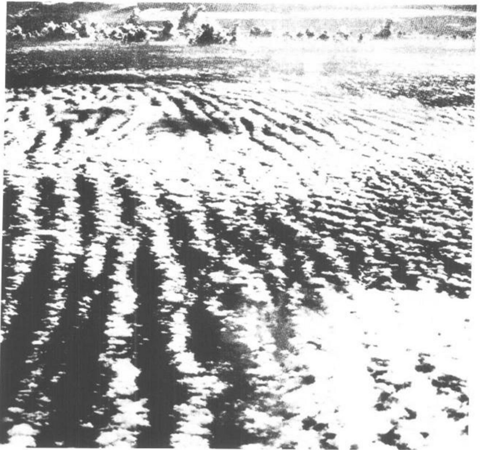
Figure 1.1 Two examples of herring-bone cloud formation. (After R. Scorer, Clouds of the world , Lothian, Melbourne (1972).)