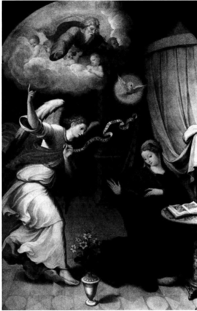
La Anunciación [The Annunciation], by Juan Correa de Vivar. The Virgin is depicted reading from the Book of Wisdom.

tion of Christ imagery, as religious experience centered increasingly on Christ's love and sacrifice for the individual. Julian of Norwich (1342–ca. 1423) systematically equates the power of God to fatherhood and the wisdom of God to motherhood: "God almighty is our loving Father, and God all wisdom is our loving Mother" (293). She describes God as a "wise mother" who guides and purifies us through his/her grace (301). True wisdom, for writers such as Julian, flows from the experiential knowledge of God, from the kindling of the flame within that produces what Saint John of the Cross will call, a century and a half later, "este saber no sabiendo." By associating God's Wisdom with motherhood, Julian is drawing on a centuries-old Sophianic tradition. Teresa de Jesús will likewise avail herself of maternal images of God to communicate the incommunicable outflow of love that is the essence of the mystical union.