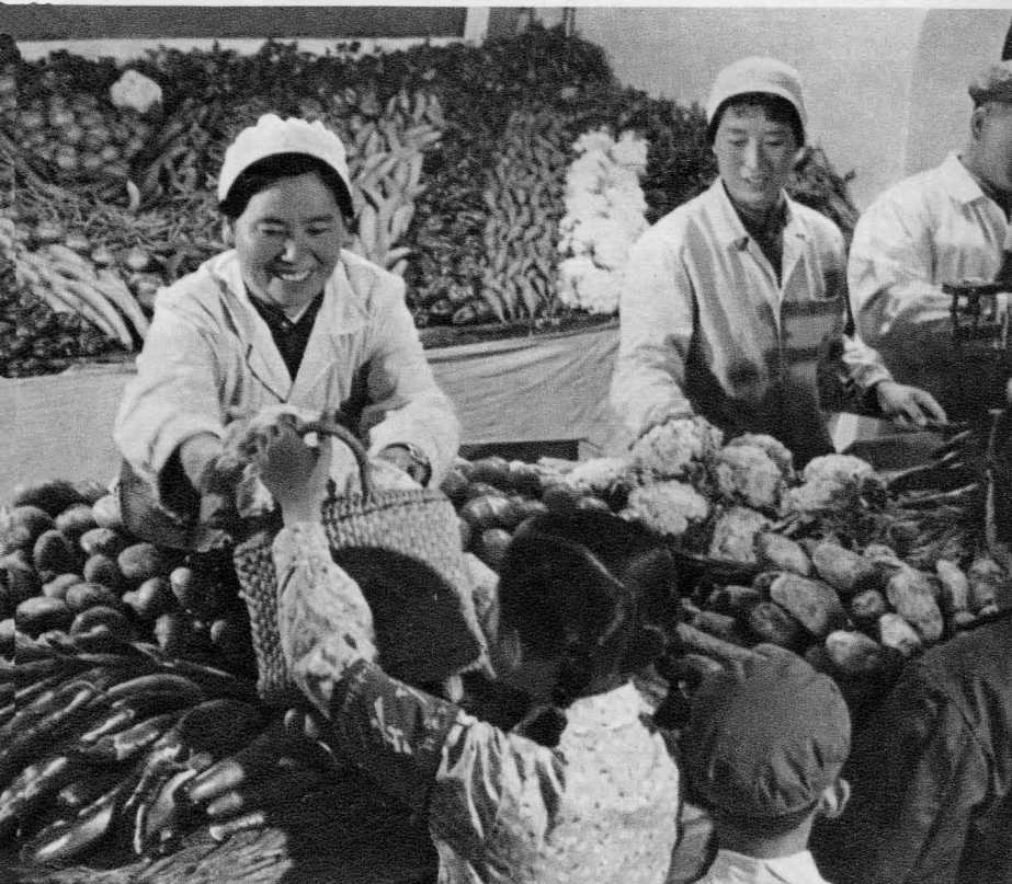
Formerly a clerk in a Shenyang city food market, Li Su-wen ( left ) serves as a Vice-Chairman of the Standing Committee of the Fourth National People's Congress.