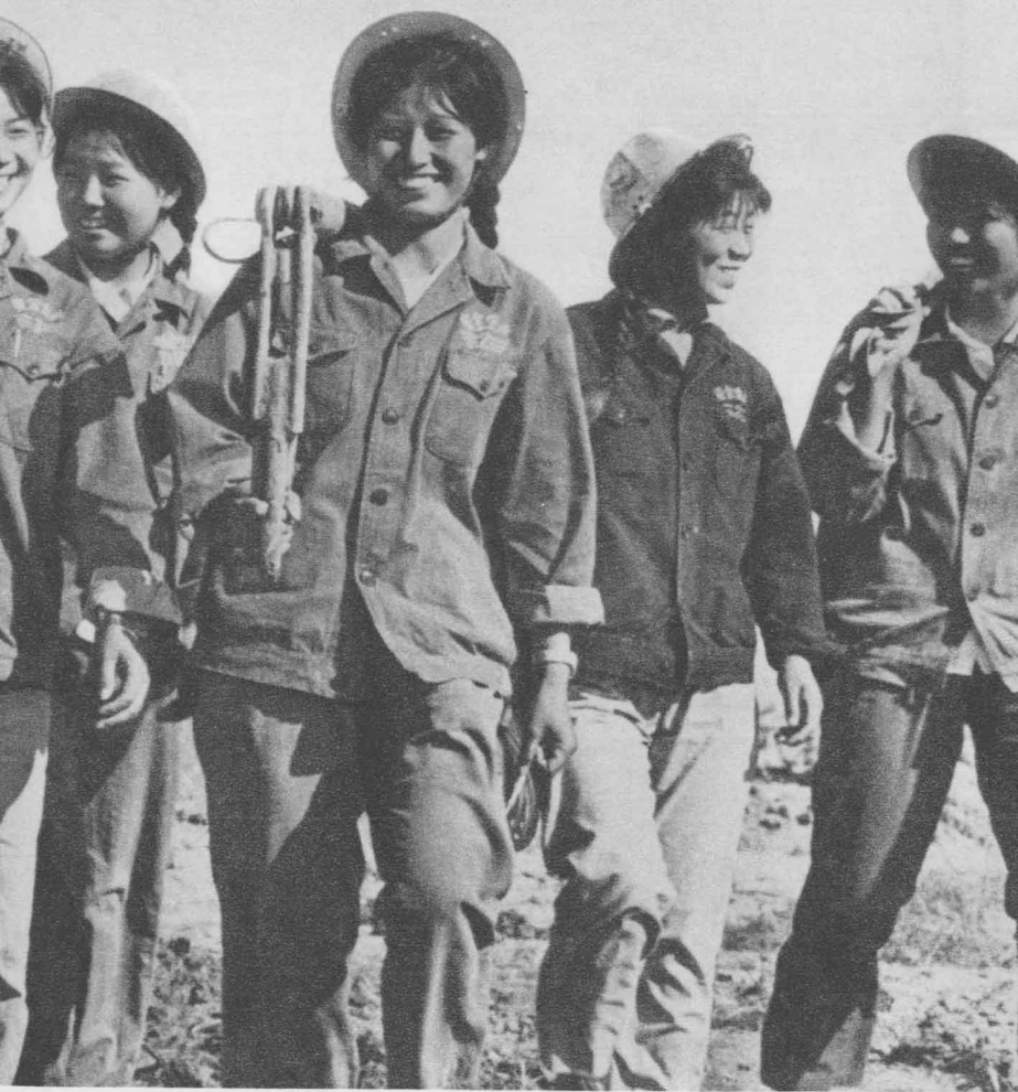
The women's perforating team of the Taching Oilfield.