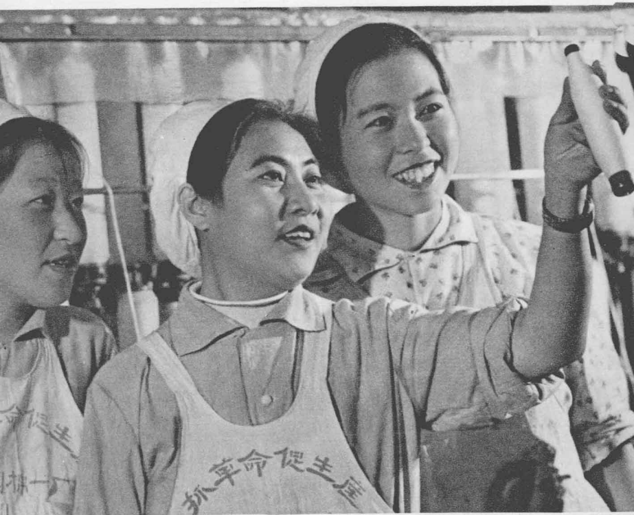
Wu Kuei-hsien ( centre ), who was a worker of the Northwest No. 1 State Cotton Mill, is now a Vice-Premier of the State Council of the People's Republic of China.