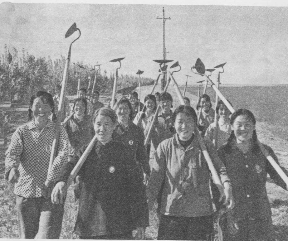
The families of the Taching Oilfield workers and staff members are active in agricultural production.