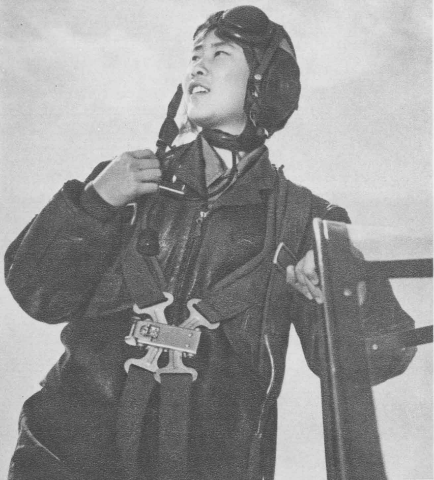
A spirited and daring woman flier.