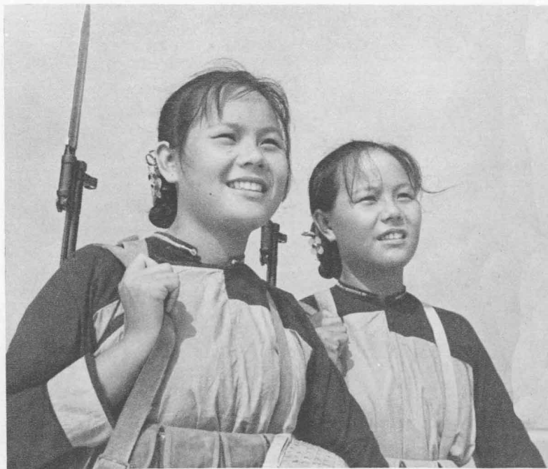
Militia women on the South China Sea.