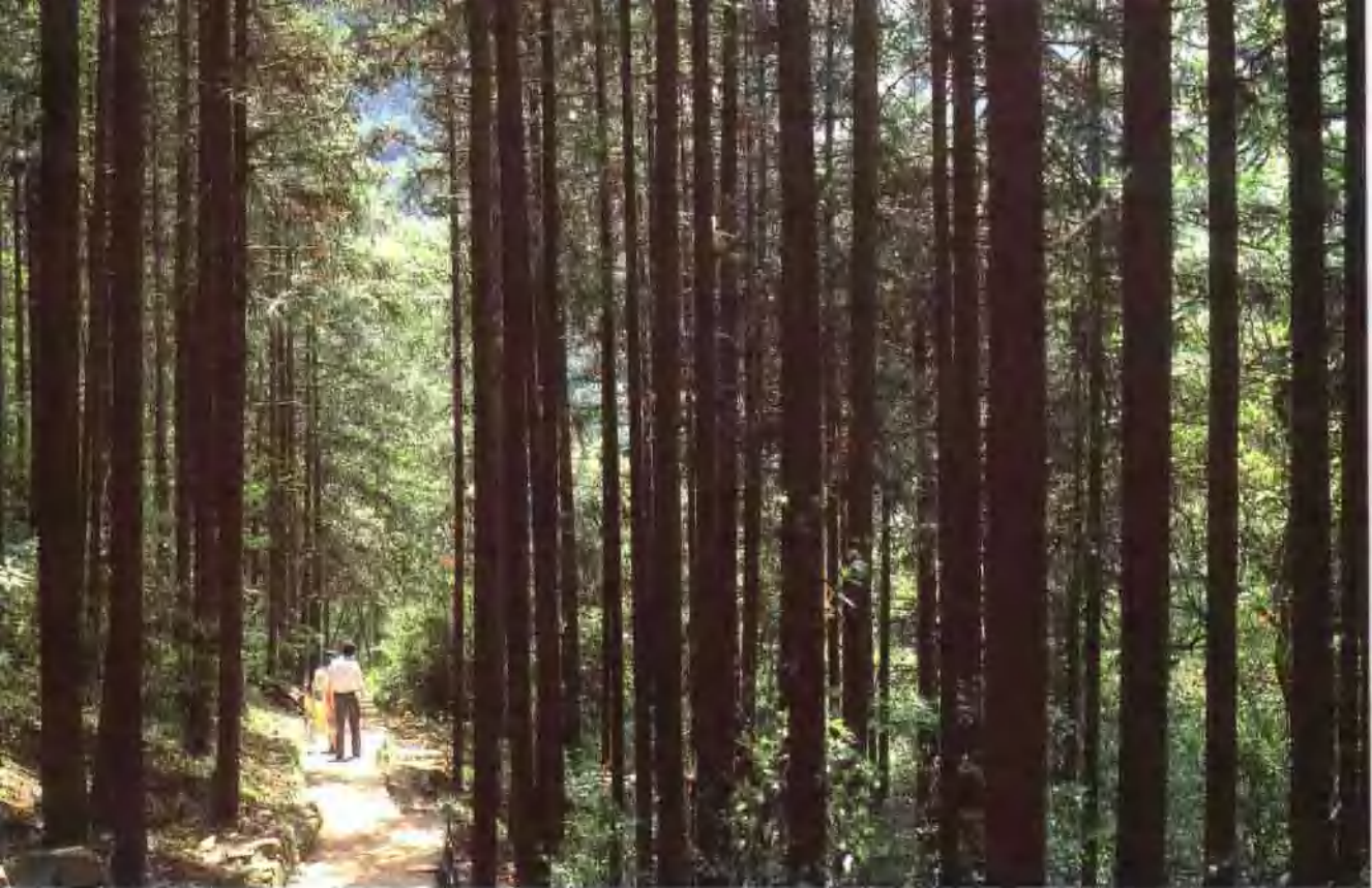
Man-made China fir forest in Dayong County, Hunan Province