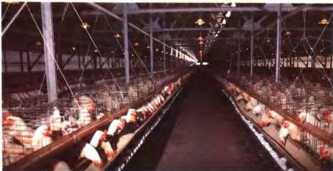
a corner of the chicken farm in a State farm of Beijing