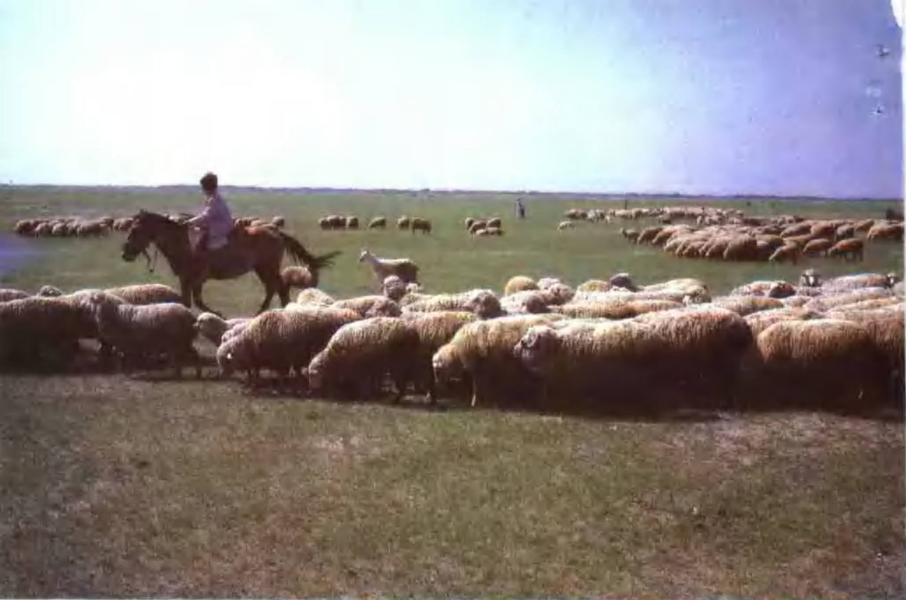
The Northeast Fine-wool Sheep of Chaganhua Breeding Flock Farm, Mongolian Autonomous County of Qian - Gorlos, Jilin Province