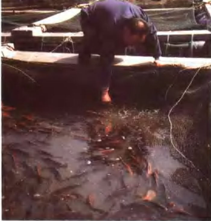
Breeding grouper in net cages