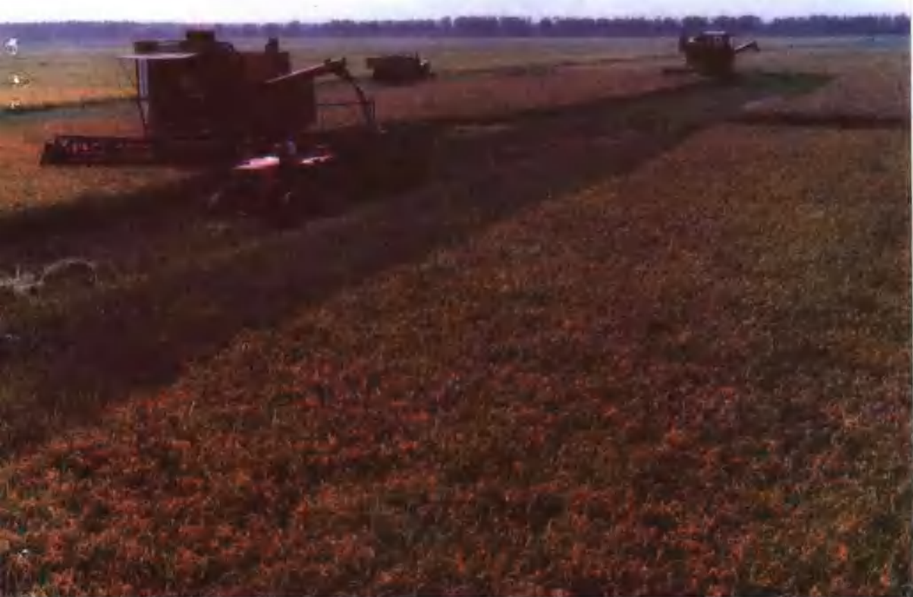
Harvesting paddy in Sanhe Farm, Jiangsu Province