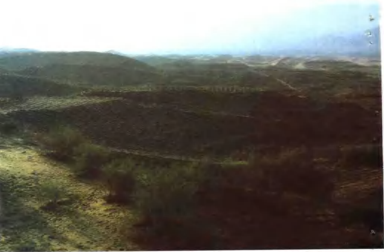
Fixing sand with checks in a section of drift sand in the south edge of the Tengger Desert