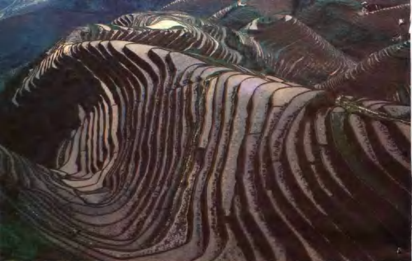
Terraced fields in Longsheng County, Guangxi Zhuang Autonomous Region