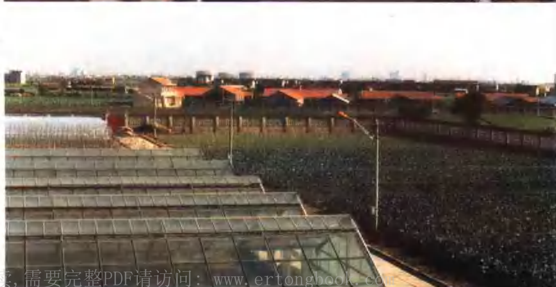
experimental station for modernized vegetable-growing facilities in Shanghai