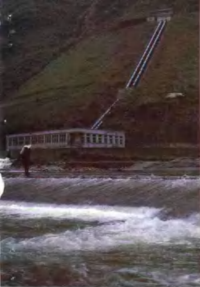
Jechaohe Small Hydropower Station, Jianyang County, Hubei Province