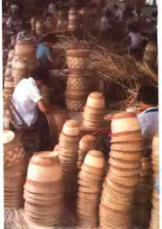
Bamboo Arts and Crafts Factory of Dongfeng Land Reclamation Farm, Jiangxi Province