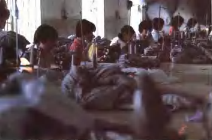
Yaya Brand eider down-padded articles produced by Gongching Eider Down Factory attached to a State Farm in Jiangxi Province