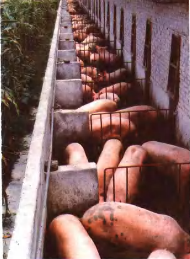
Lean-type pigs raised by specialized household in Dongfeng Township in the suburb of Guiyang City