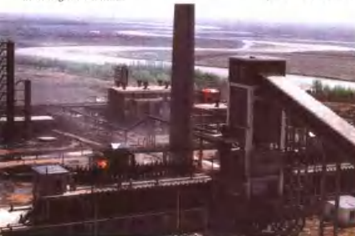
The newly-built 100 000-ton Coking Factory on Farm No. 5810, Heilongjiang Province