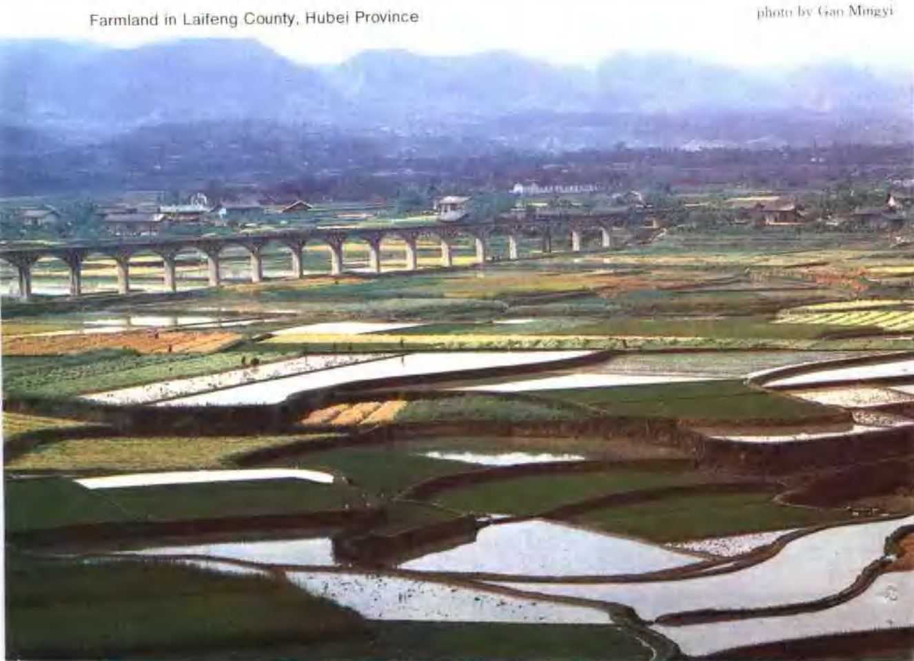
Farmland in Laifeng County, Hubei Province