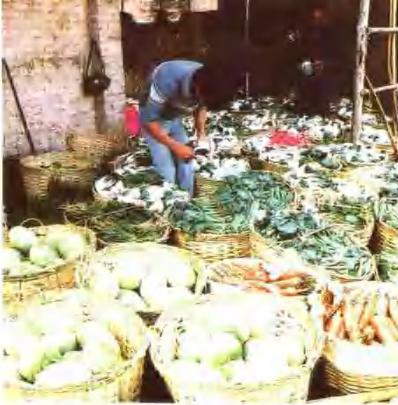
Preparing vegetables for sale