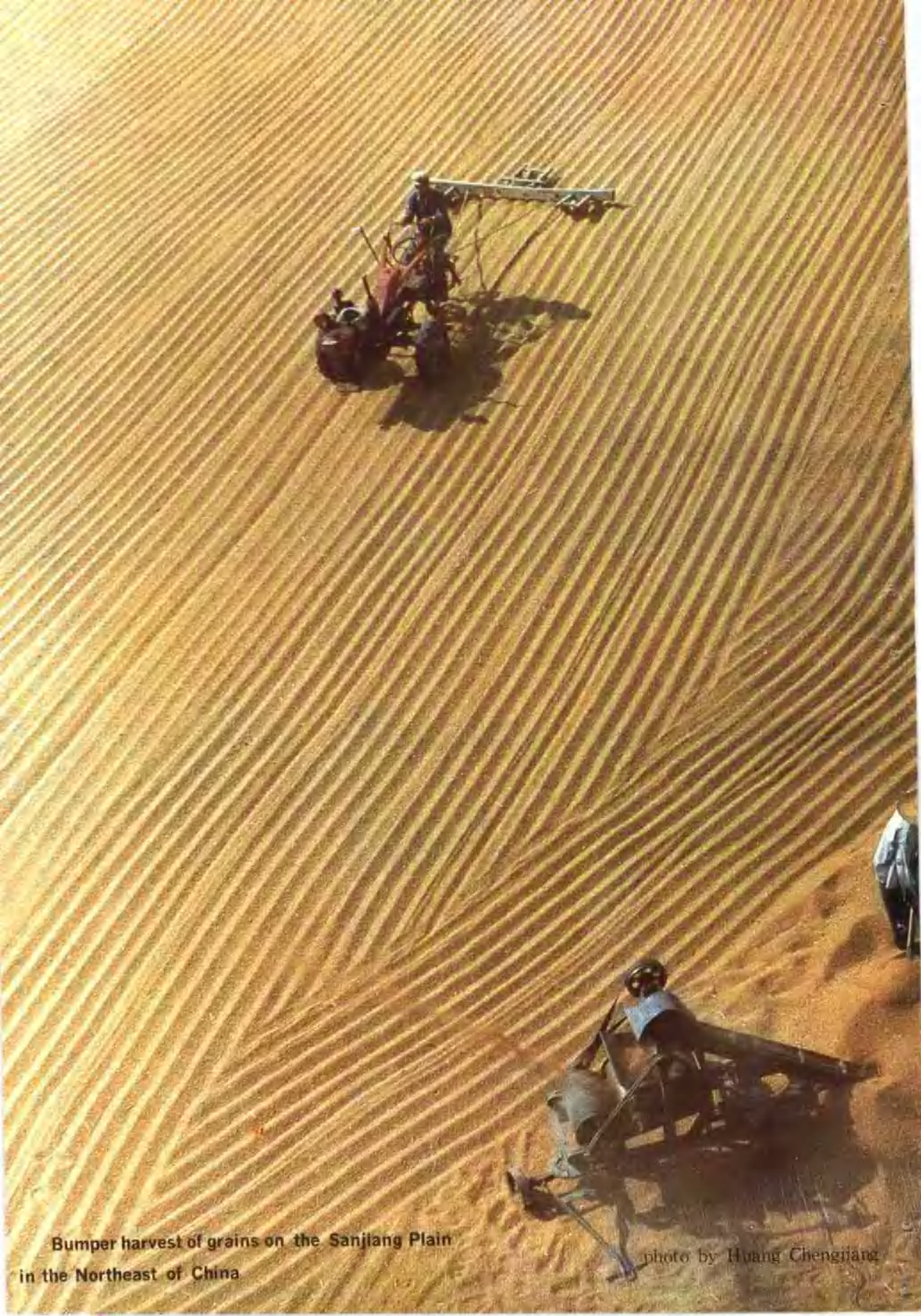
Bumper harvest of grains on the Sanjiang Plain in the Northeast of China