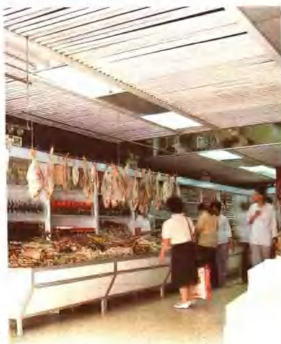
Aquatic product store, Shenzhen City, Guangdong Province