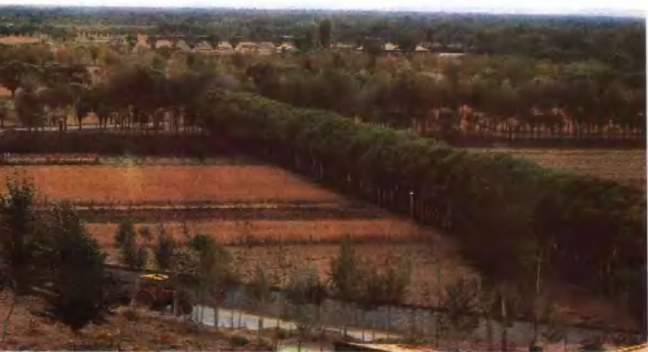
Shelter belt of farmland, Jingbian County, Shaanxi Province