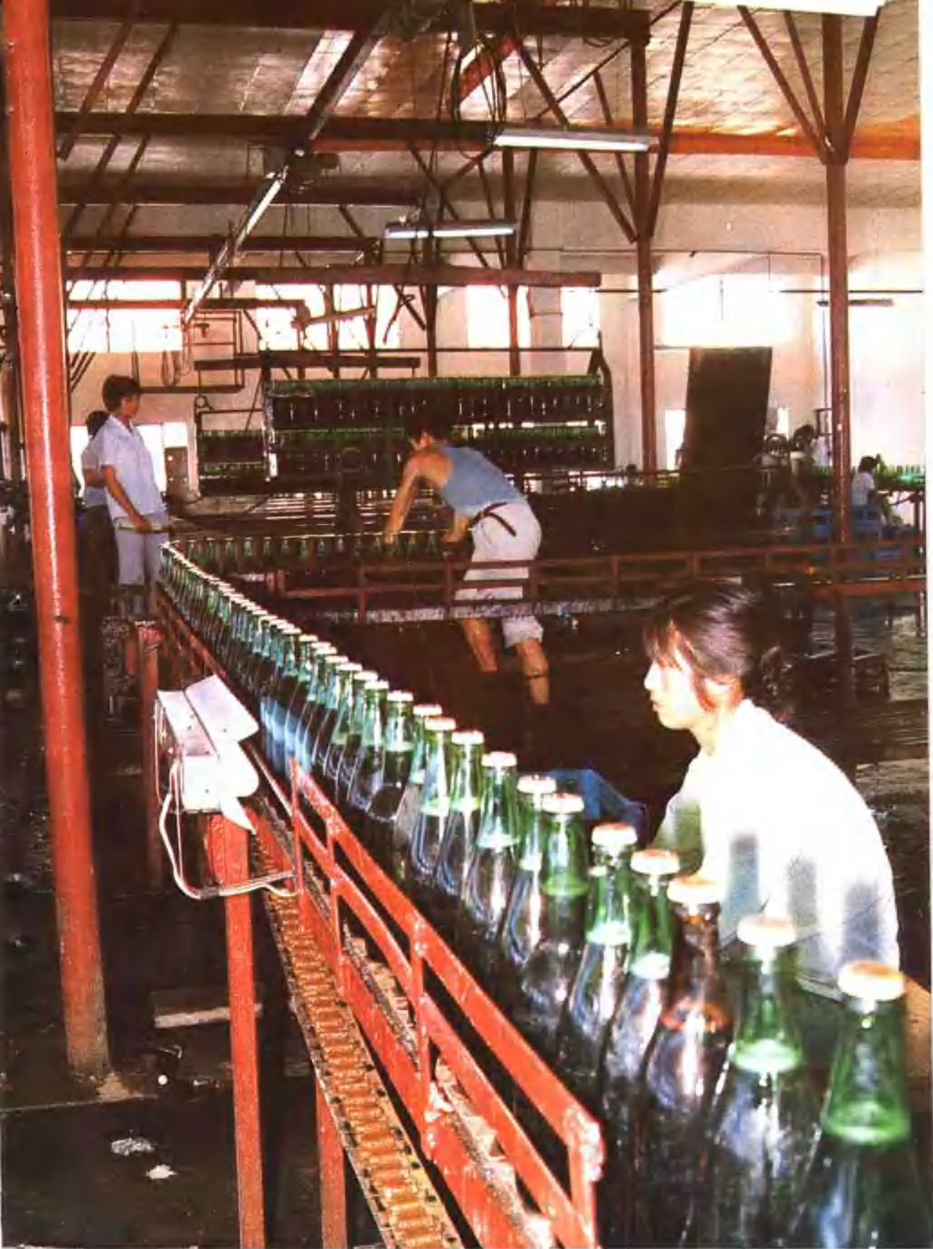
Donghai Beer Brewery, Jinshan County, Shanghai