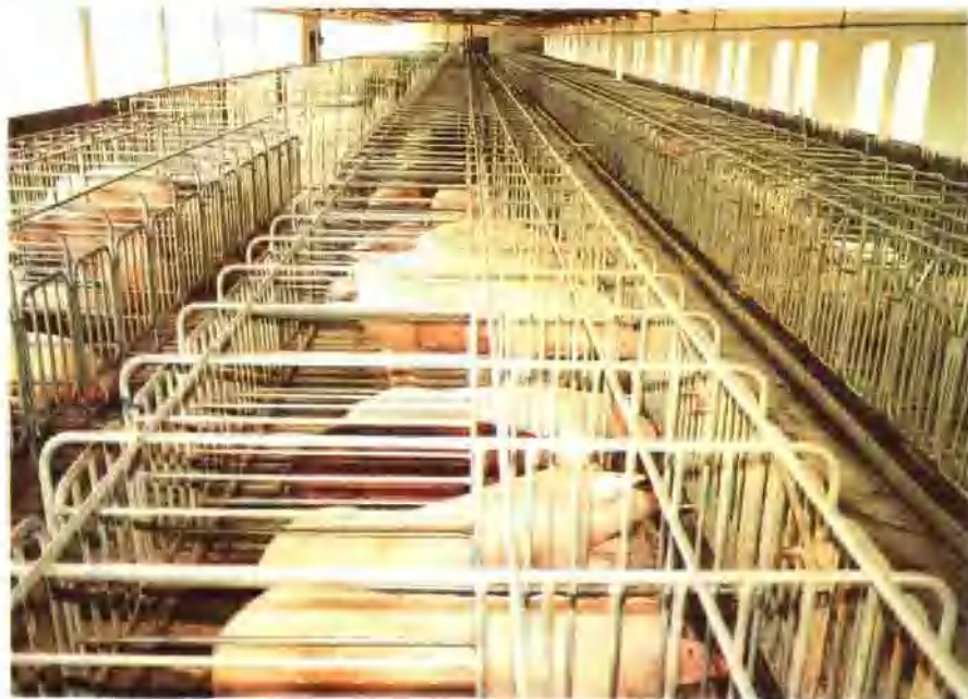
A pig farm