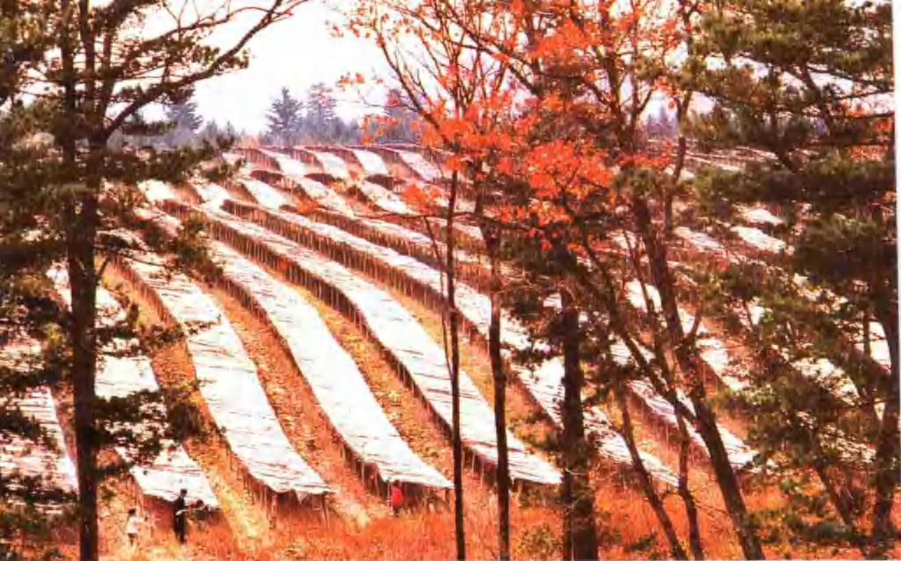
Ginseng plantation, Jilin Province