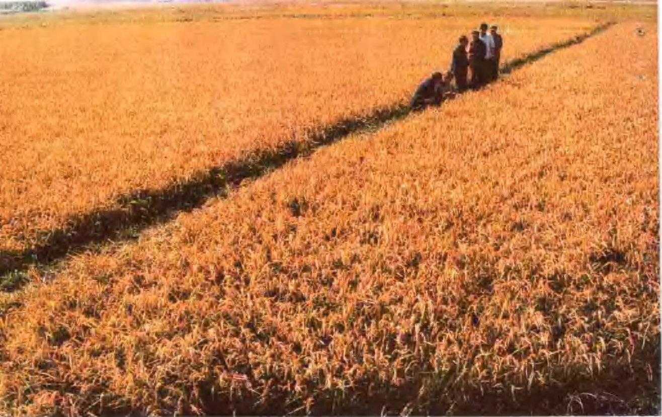
Paddy fields from reclaimed swampland, Bao Qing County, Heilongjiang Province