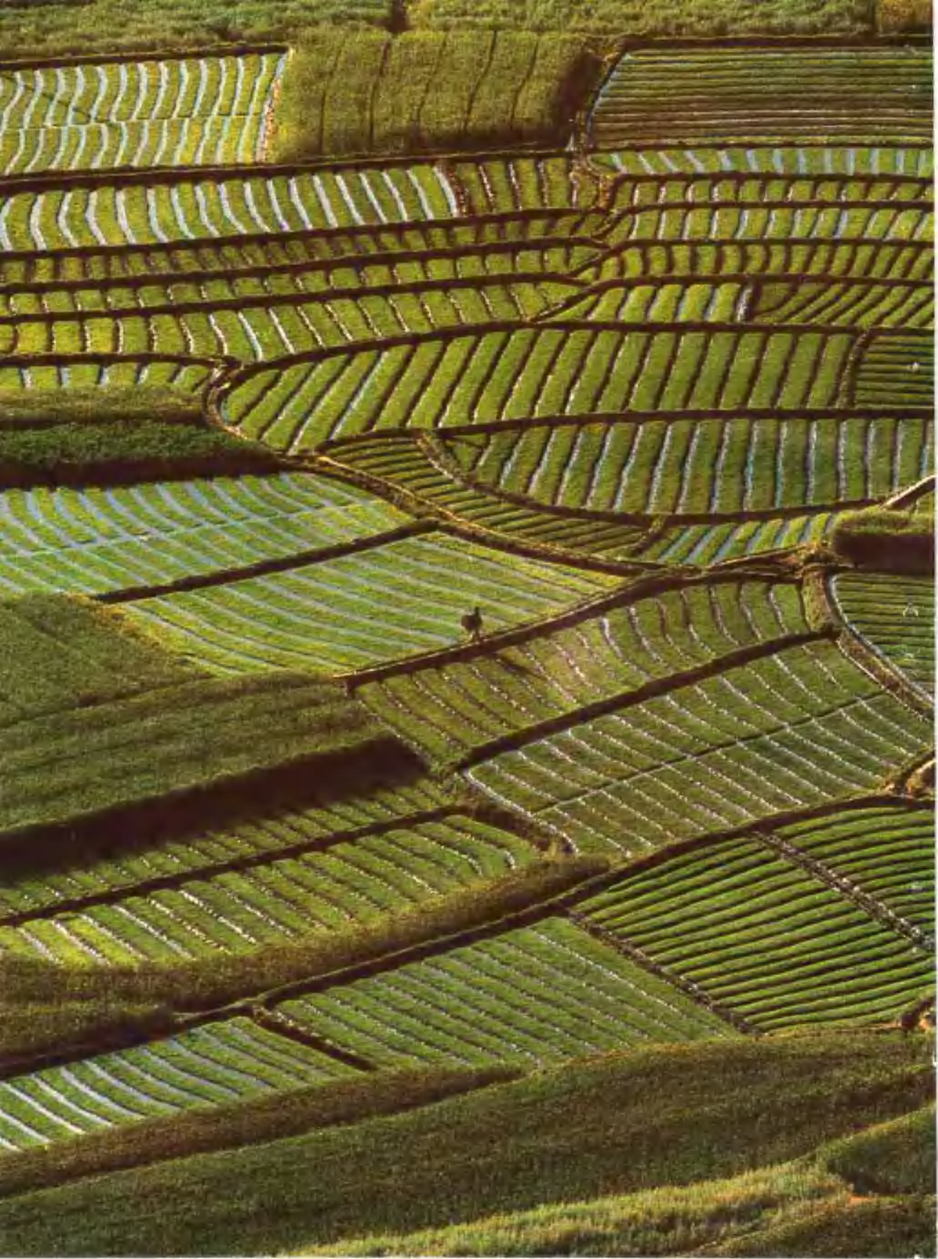
Farmland in Lijiang Prefecture, Yunnan Province