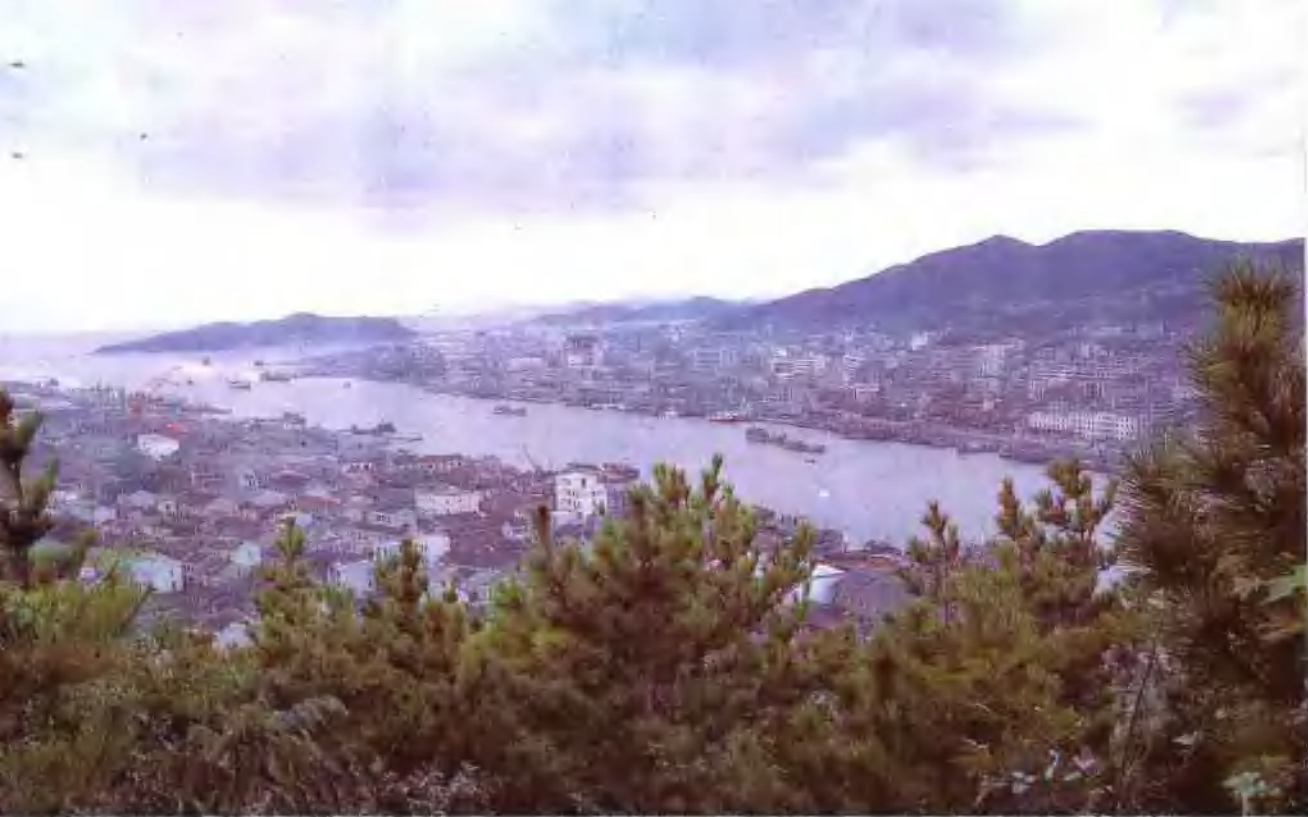
Shenjiamen fishing port of Zhoushan City, Zhejiang Province