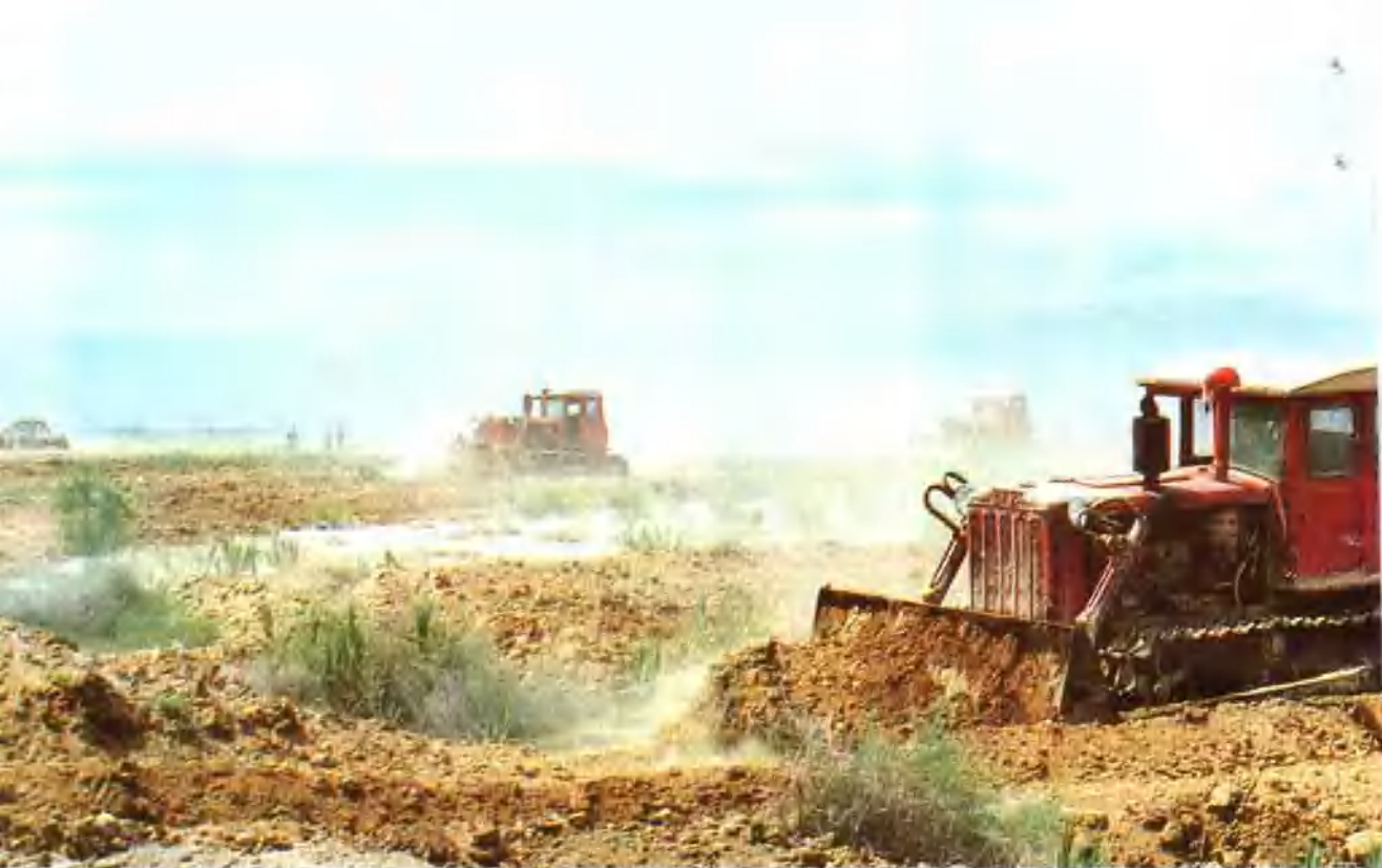
Reclaiming wasteland by the Xinjiang Production and Construction Corps