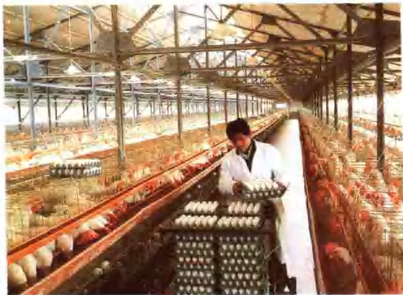
Poultry farm in Dongbeiwang Township, Haidian District, Beijing