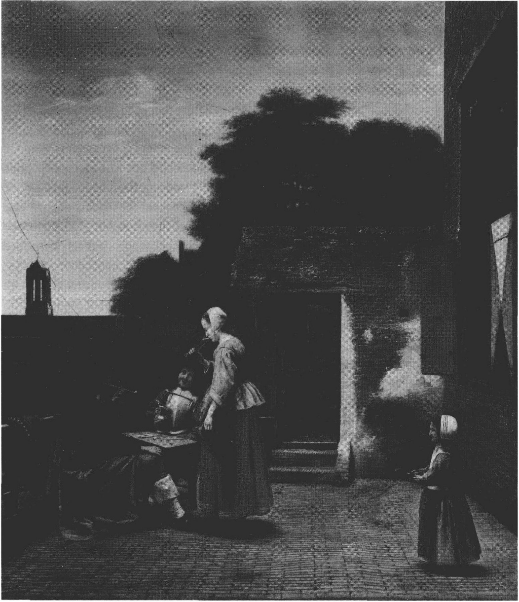
Figure 1 Pieter De Hooch, A Dutch Courtyard (1658/1660).

At the heart of this self-ironic “ars ekphrasis” is a triangular set of social relations: between the speaker/poet and the figures depicted in De Hooch’s seventeenth-century Dutch genre scene (Fig. 1); between the speaker/poet and De Hooch, whose painting seems to invite the viewer in with its ordinary domestic scene of people talking and laughing and its perspective lines opening the space of the picture into ours (see how the floor extends