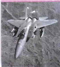
F-15 Tactical Fighter F-15 战术战斗机

Many al-Qaida fighters have been captured by U. S. forces and their Afghan allies. A Saudi official said that a small number of Saudis were among detainees(被拘留者) transferred to a U. S. military base in Cuba.