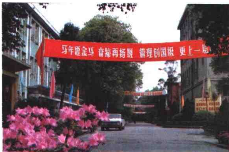
优美壮观的花园工厂 Beautiful garden plant

plant of the Post and Ministry (CDC) was set e than 30 years' experi- telecom cable. CDC is ed manufacturer of