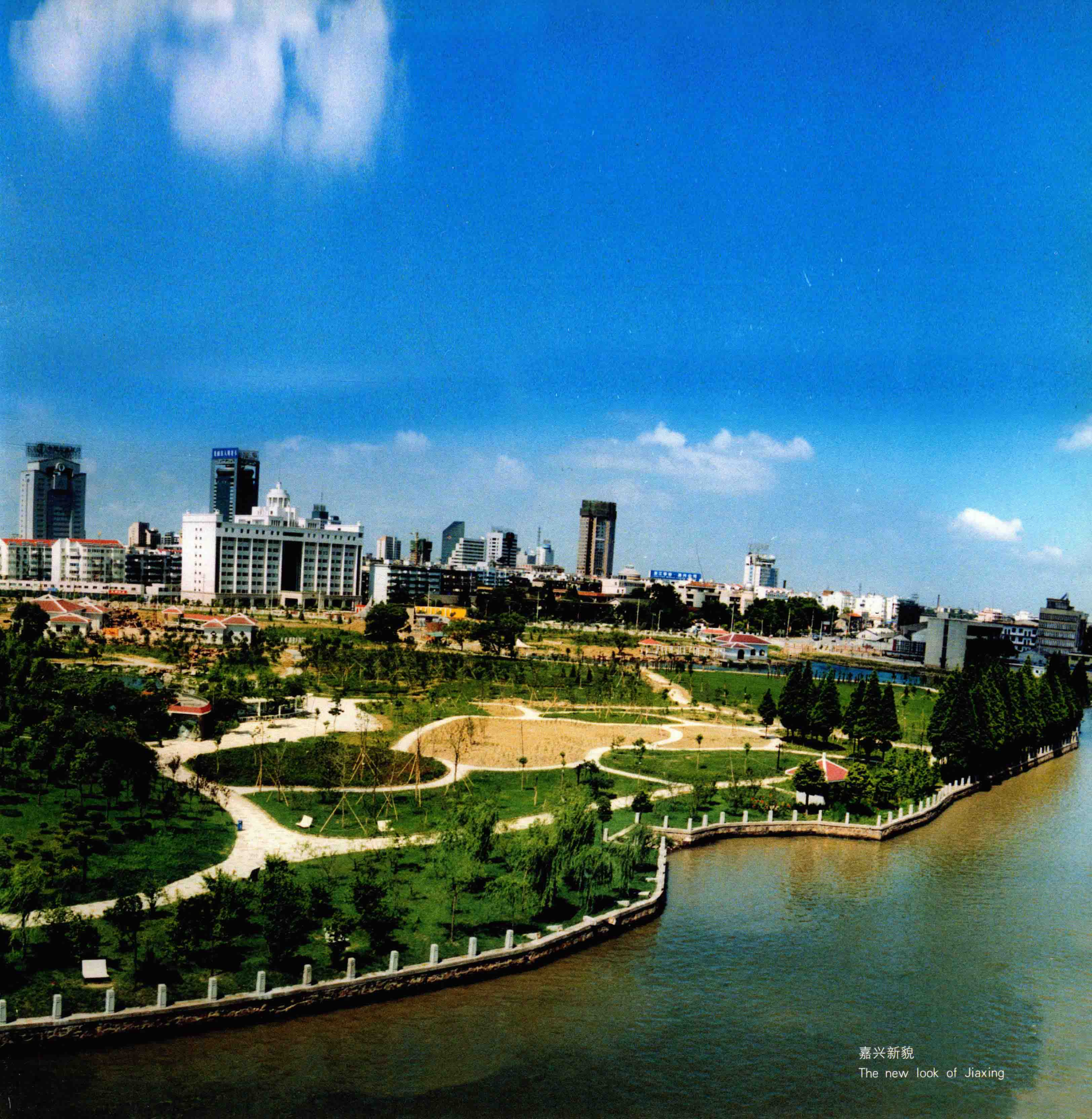
嘉兴新貌 The new look of Jiaxing