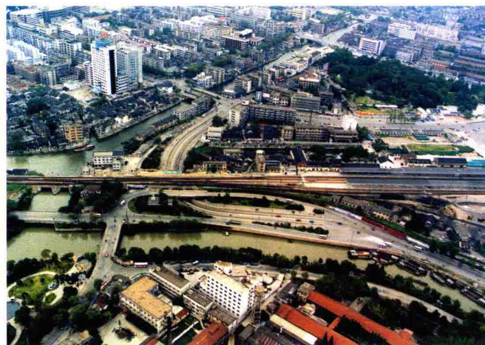
绿色项链 Green Necklace

Tracing back, people can't help pondering that the historical ancient town of Jiaxing, with its new shiny and fresh appearance, is becoming known to more and more people all over the world.