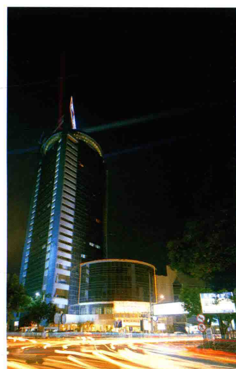
城市长高了 The growing city