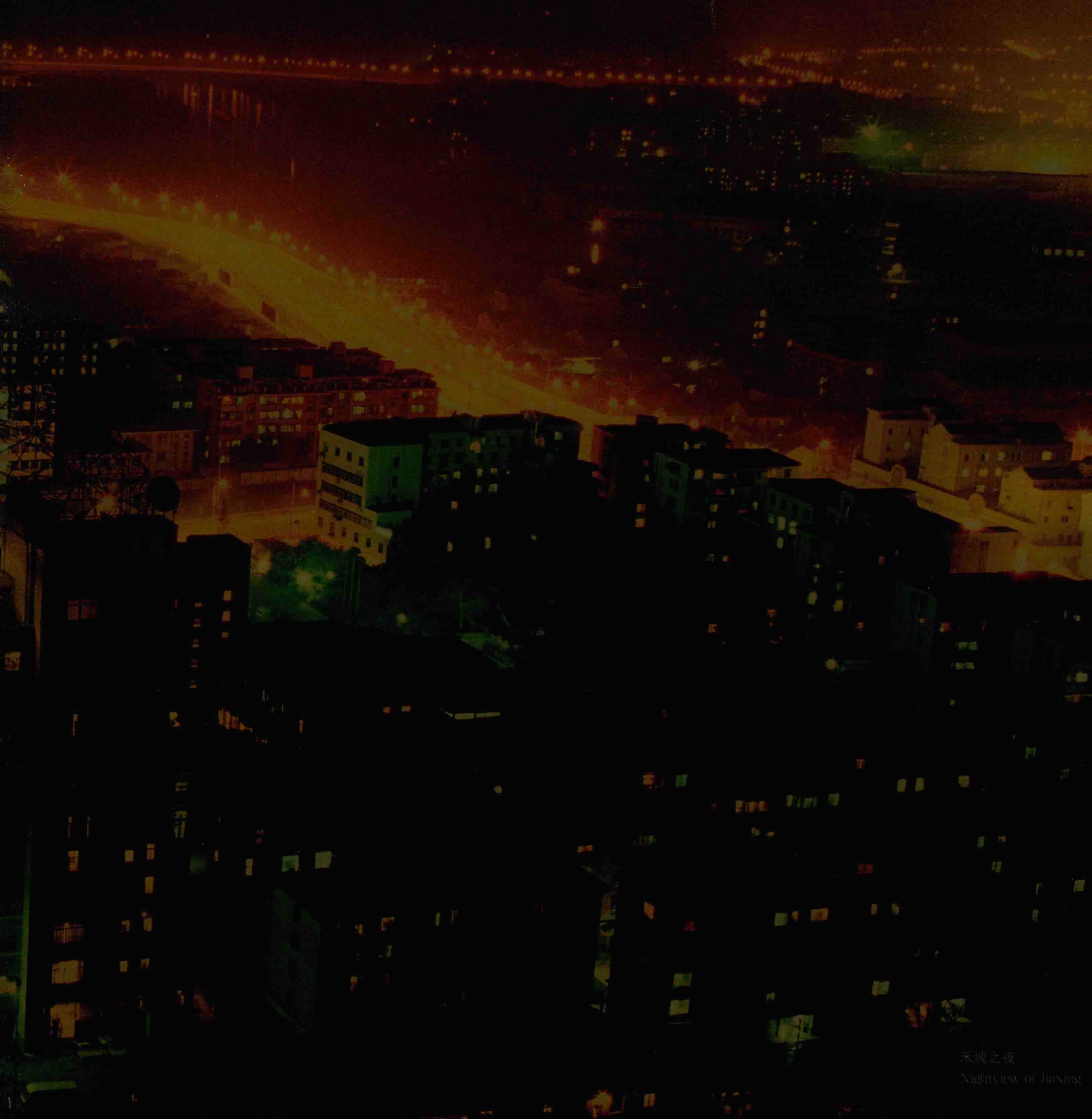
禾城之夜 Nightview of Jiangning