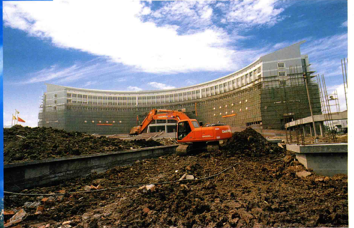
在建中的秀洲新区 New Xiuzhou District under construction