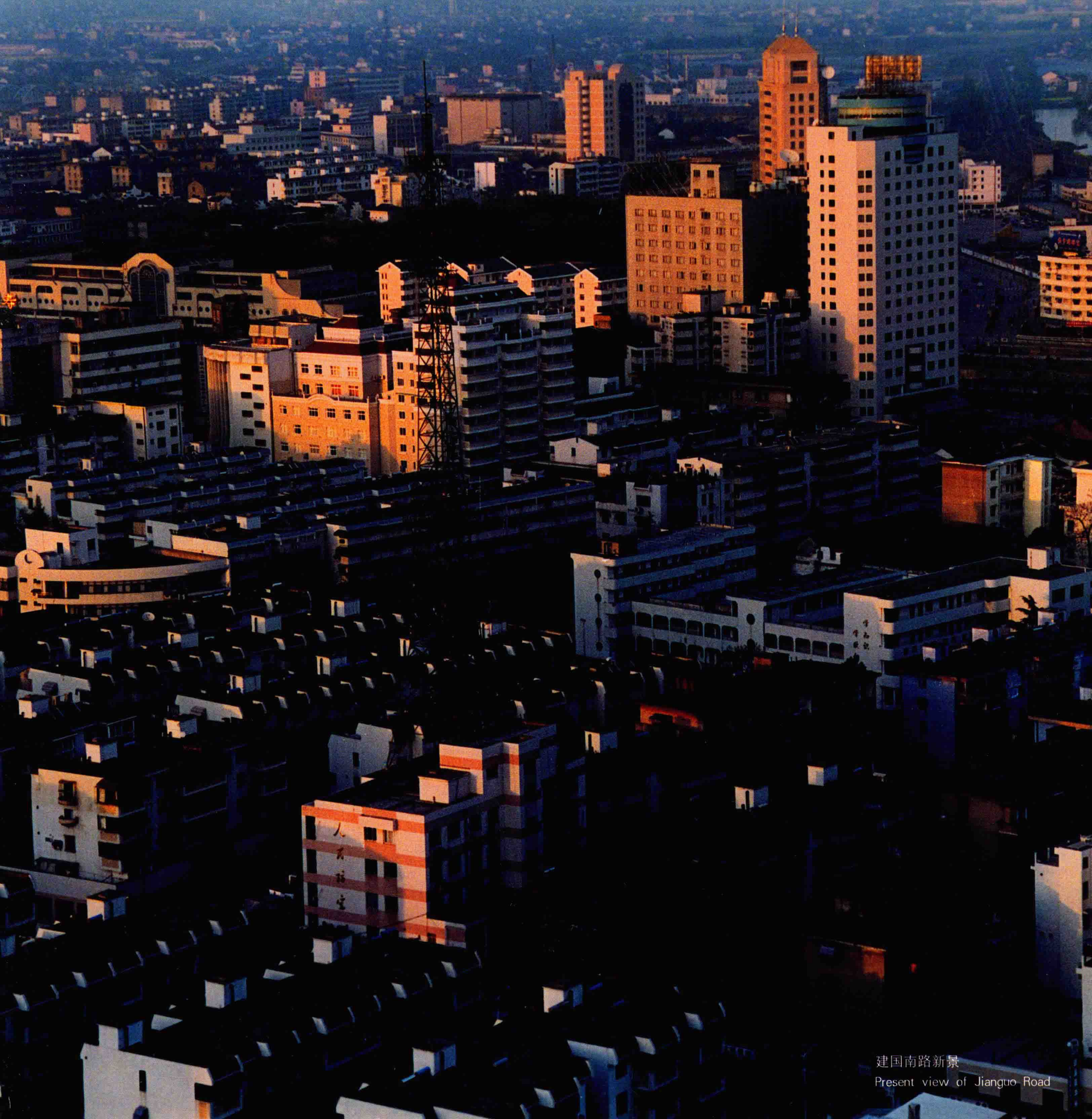
建国南路新景 Present view of Jianguo Road