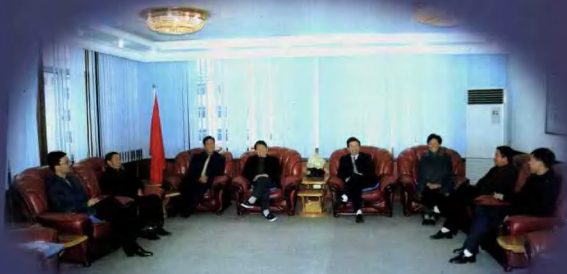
■ 学院党政领导 Members of the School Council

WZTC has gathered rich experience through many years of development. It has grown and developed through the efforts of generations of people. Now WZTC is embracing the 21 st century with significant changes under the lead of the Party Committee.