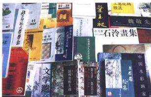
■教师科研著作成果 Teachers' Research Works

In recent years, by promoting competition, investing in fundamental educational needs, employing teachers with senior academic titles and establishing key laboratories, research work has been greatly enhanced. The college has seen great achievements in scientific research, widely influencing both society and academia.