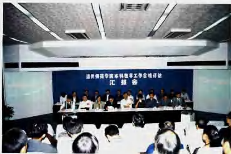
■教育部本科教学工作合格评估汇报会 An evaluation of undergraduate education by the State Ministry of Education