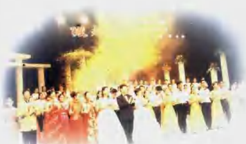
■文艺演出 Variety performance

In 2001, WZTC passed the evaluation of undergraduate education by the State Ministry of Education with flying colors.