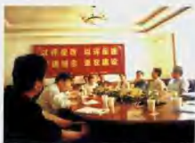
■评估专家工作现场 Evaluating staff performance