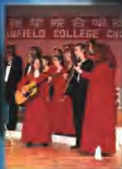
■ 惠德学校学生来访演出 A chorus presented by a visiting foreign delegation