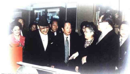
■江泽民总书记向外国元首赠送发绣艺术品 President Jiang Zeming presenting a hair embroidery portrait to a visiting head of state

Hair Embroidery is a skill unique to the East, and is renowned both home and abroad. Hair embroidery art works have been presented as China's State gifts. Groups of representatives for hair embroidery have exhibited and lectured in response to invitations from the U.N., the USA, and also Europe and Asia, earning the title of "Hair Embroidery Diplomacy".