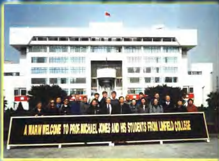
■ 惠德学校师生来访 A visiting foreign delegation