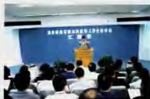
■院领导作本科教学工作合格评估汇报 A report being made to the experts team on undergraduate education