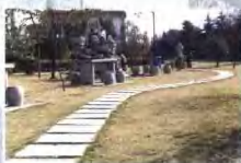
■体谈点 Recreation Area