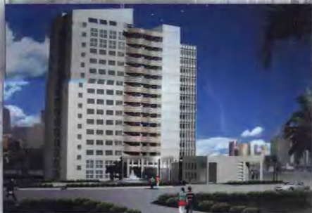
■教学主楼(在建) The Main College Building (under construction)