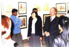
■发绣艺术展团国外艺术展 An overseas exhibition of hair embroidery portraits