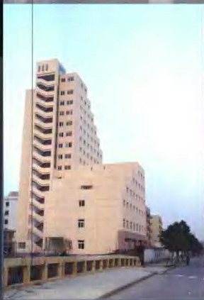
■综合大楼(留学生楼) Residential Block for international students