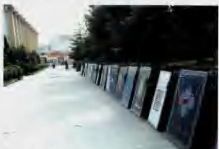
■校园文化活动 An example of campus cultural activities