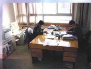
■系统科学理论研究所 Institute of Systems Analysis

Academicians and various famous experts scholars invited as visiting professors in our college