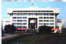
■文科大楼 Liberal Arts Building