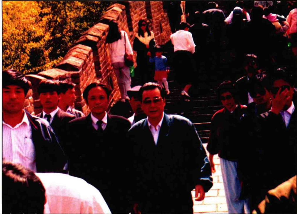
李鵬總理視察慕田峪長城旅遊區 Premier Li Peng Inspecting Mutianyu Great Wall Tourist Zone