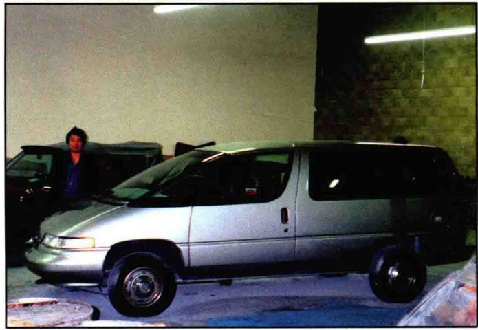
北京祥雲汽車制造有限公司生產的“祥雲”牌汽車 “Xiang Yun” Brand Automobile. produced by Beijing Xiang Yun Automobile Manufacturing Company Ltd.