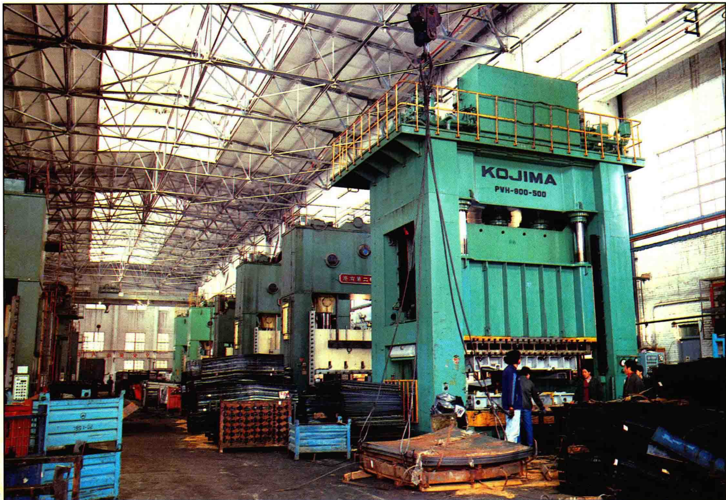
懷柔沖壓廠汽車配件沖壓車間 全木請在 www.ertongbook.com 購買 Automobile Fittings Stamping Workshop. Huairou Automobile Stamping Factory