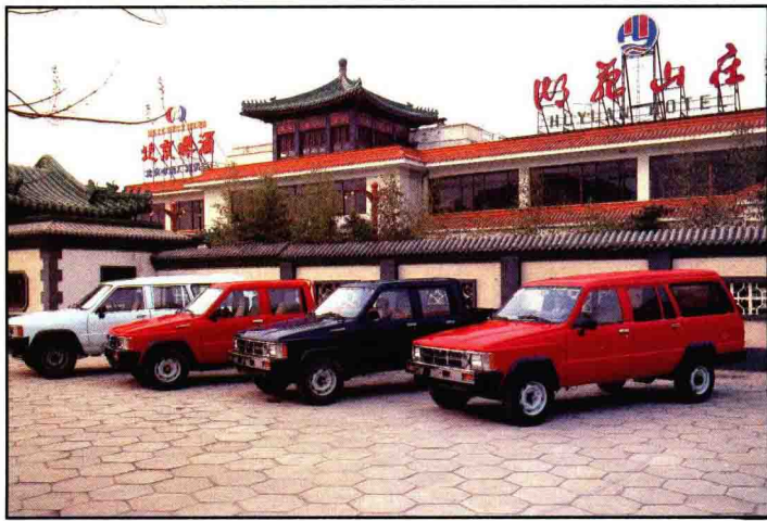
東關村生產組裝的“新海”汽車 “Xin Hai” Automobile. Produced and Packed by Dongguan Village