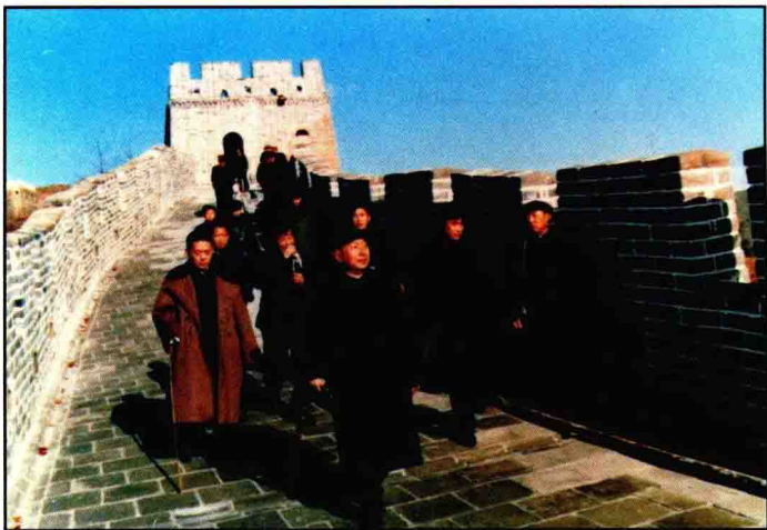
北京市委書記陳希同考察慕田峪長城 Chen Xitong, secretary of Beijing Municipal Committee, Inspecting Mutianyu Great Wall

Huairou benefits from the favourable geographical position and the spiritual influence of the natural environment. Leaders of the Party and State have come inspecting and instructing.