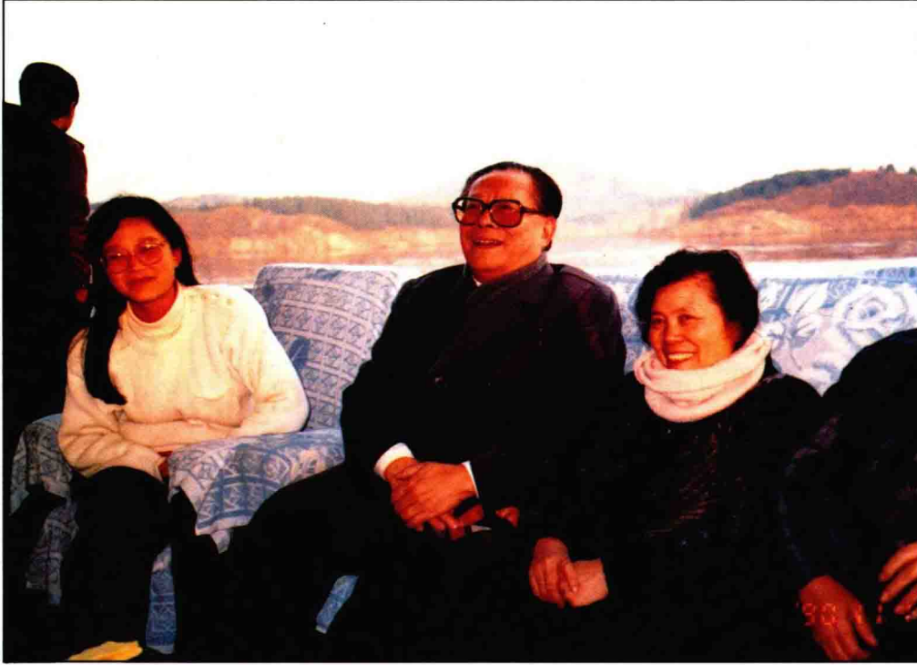
江澤民總書記在雁栖湖 General Secretary Jiang Zemin at Yanqi Lake