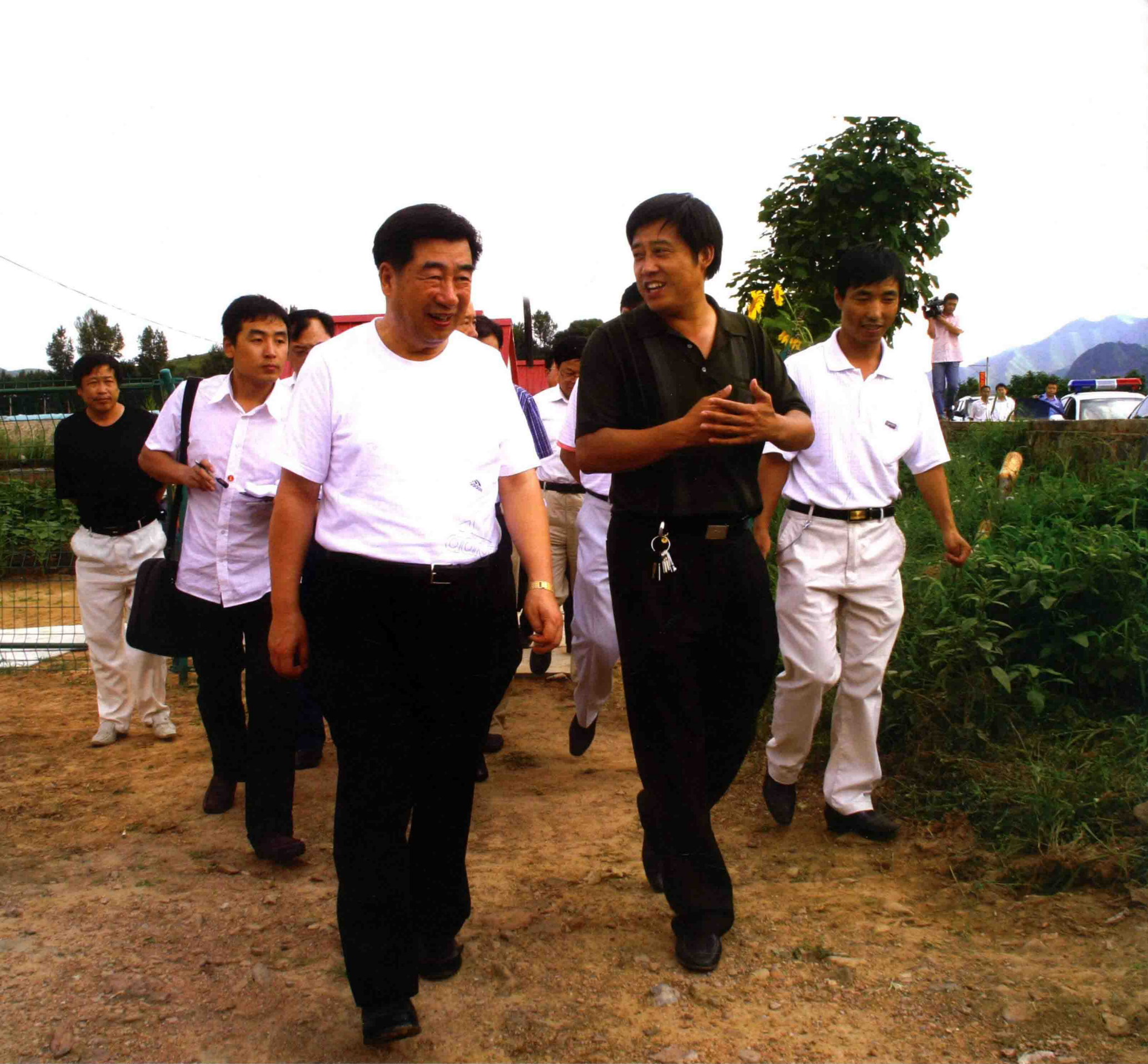
2007 年 8 月回良玉同志视察隆化。