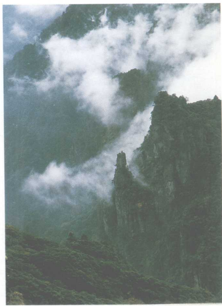
梵 净 山