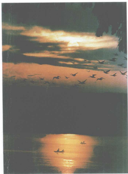
威 宁 草 海