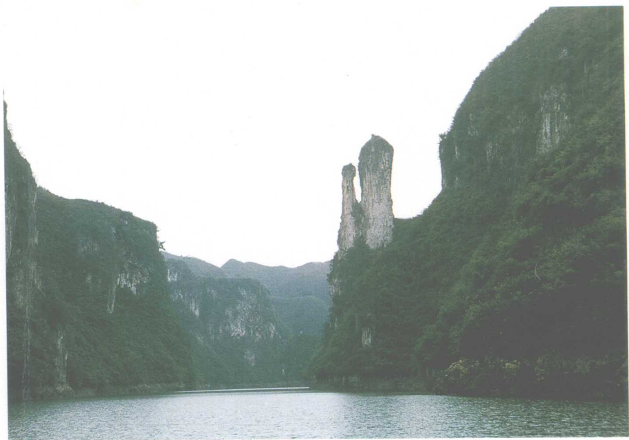
舞 阳 河