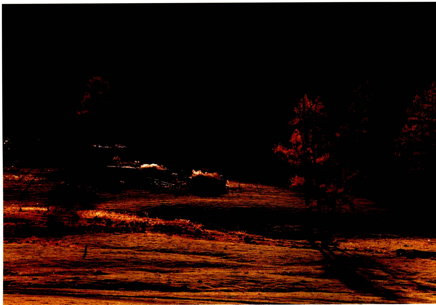
新疆 · Xin Jiang