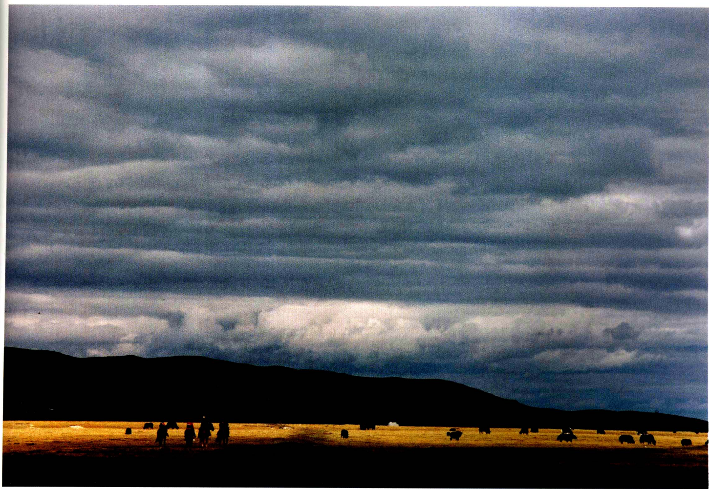
甘肃 · Gan su