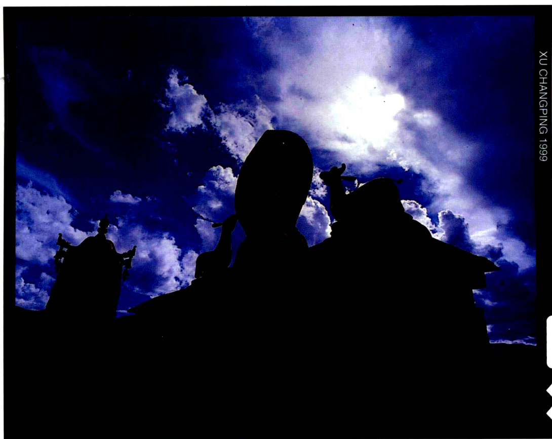
XU CHANGPING 1999