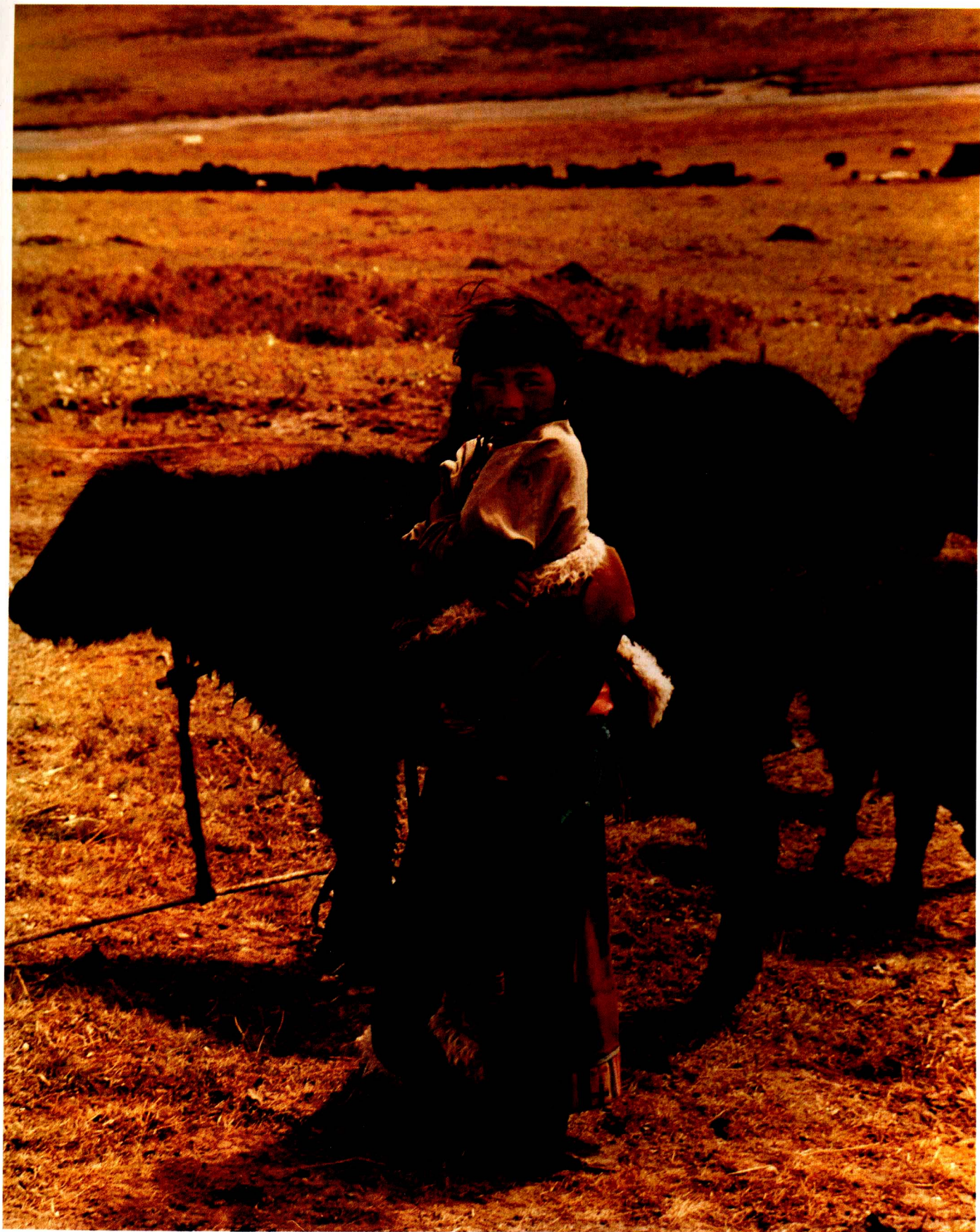
甘肃 · Gan su