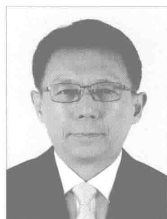
周树春 全国政协常委 中国日报社总编辑

在此，感谢各位摄影家、各协办单位和各界人士对画册以及中国日报社的支持。中国日报社将与各界共同当好新时代改革开放事业的推动者、贡献者，做好新时代改革开放故事的记录者、传播者。